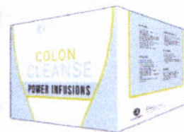
Figure 5. Unregistered Power Rock Salt and Therapeutic Claims by the Establishment

Uses: The oil palm powder helps penetrate the accumulation in the colon, lubricates the colonwall, and makes it slippery so that the rubbery accumulation can easily slip right out. This powerful combination enhances the growth of good bacteria in the intestine, absorbs large amounts of water in the bowels thereby increasing fecal bulk material and the weight of the stools. This makes the stools softer and improves bowel function. You can see the effect 4 – 8 hours after taking the first sachet. If there is no effect within this time, take 1 sachet 3/day until you are able to remove the fecal material.