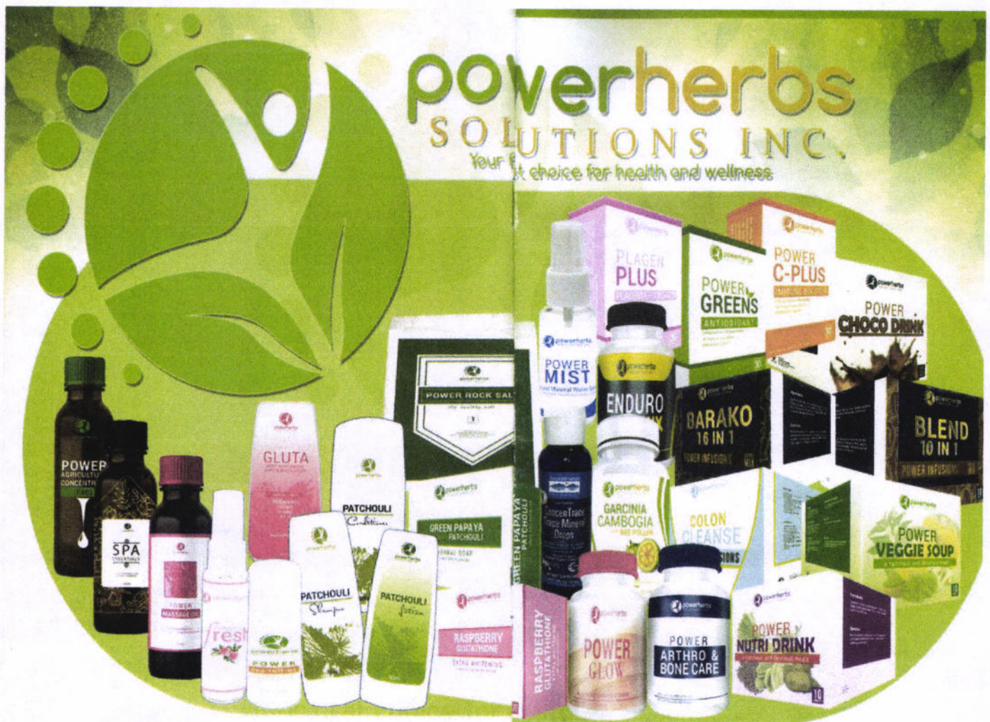
Figure 1. Front Page of the Brochure of Powerherbs Solutions Inc.

The public is warned that all food products and food supplements being advertised by Powerherbs Solutions Inc. is not registered with the FDA. Pursuant to Republic Act No. 9711, otherwise known as the "Food and Drug Administration Act of 2009", the manufacture, importation, exportation, sale, offering for sale, distribution, transfer, non-consumer use, promotion, advertising or sponsorship of health products without the proper authorization from FDA is prohibited.