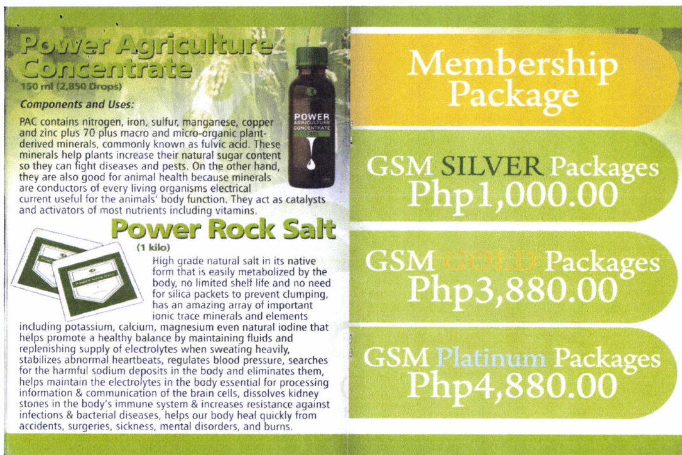
Figure 6. Unregistered Power Rock Salt and Therapeutic Claims by the Establishment

Likewise, all claims advertised by the said establishment in their brochure are false, deceptive, and misleading. As per Administrative Order 2010-0008, no person shall advertise, promote, or use in any sponsorship any food/dietary supplements unless such product is duly registered and approved by the Food and Drug Administration. Therefore, all activities related to the distribution and advertisement of Powerherbs Solutions, Inc. are in violation of RA 9711 and AO 2010-0008.