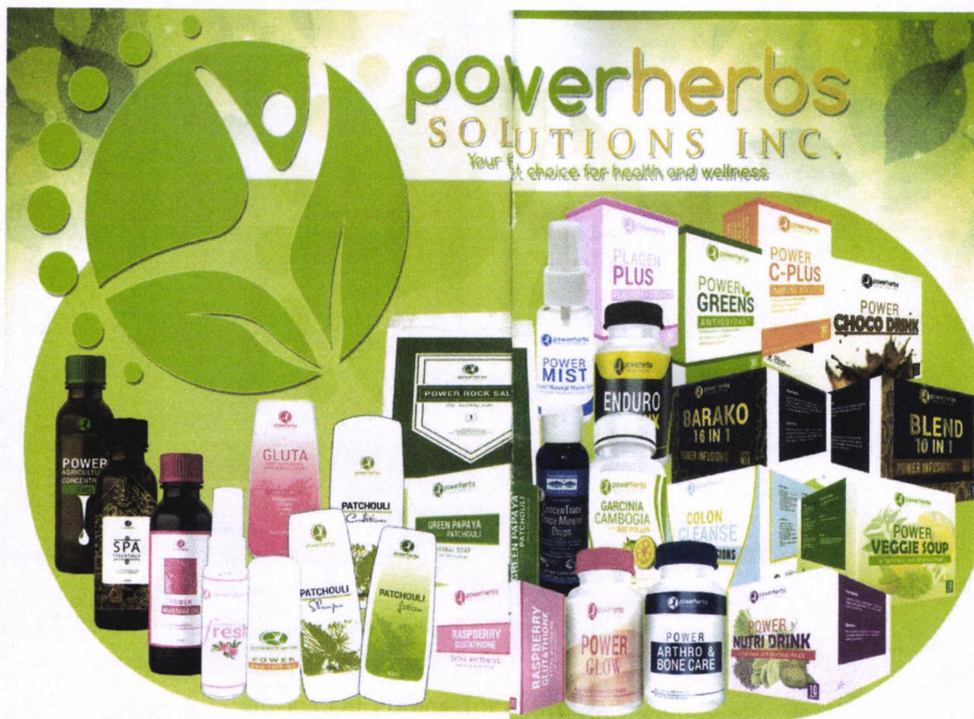
Figure 1. Front Page of the Brochure of Powerherbs Solutions Inc.

The public is warned that all food products and food supplements being advertised by Powerherbs Solutions Inc. is not registered with the FDA. Pursuant to Republic Act No. 9711, otherwise known as the “Food and Drug Administration Act of 2009”, the manufacture, importation, exportation, sale, offering for sale, distribution, transfer, non-consumer use, promotion, advertising or sponsorship of health products without the proper authorization from FDA is prohibited.