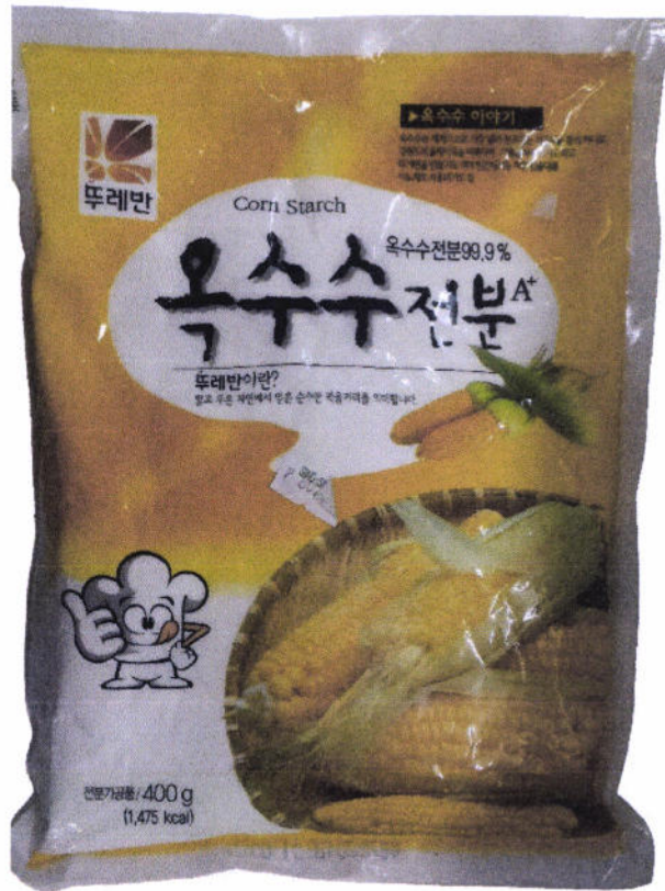
Figure 2. In Korean Character Corn Starch