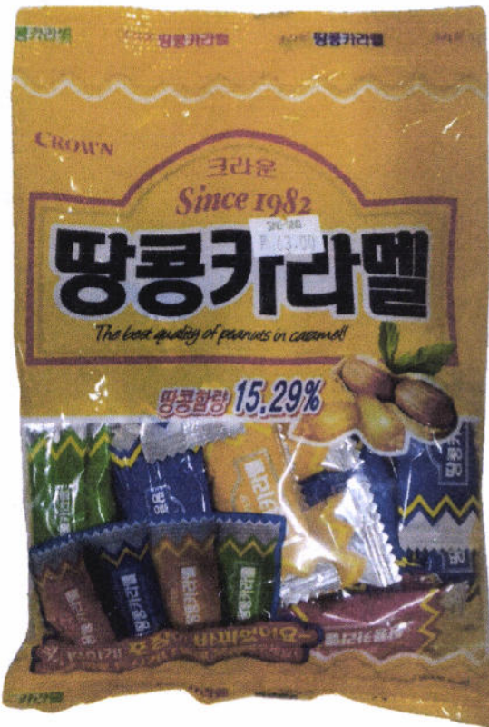
Figure 3. Crown the Best Quality of Peanuts in Caramel Candy