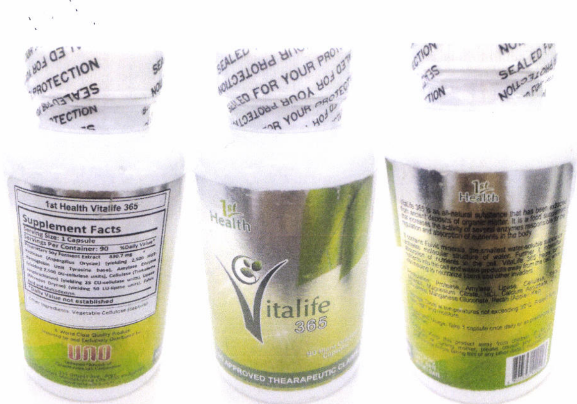
Figure 4. Unregistered 1 st Health Vitalife 365

FDA post-marketing surveillance (PMS) activities have verified that the abovementioned food products and food supplement have not gone through the registration process of the agency and have not been issued the proper authorization in the form of Certificate of Product Registration. Pursuant to Republic Act No. 9711, otherwise known as the “Food and Drug Administration Act of 2009”, the manufacture, importation, exportation, sale, offering for sale, distribution, transfer, non-consumer use, promotion, advertising or sponsorship of health products without the proper authorization from FDA is prohibited.