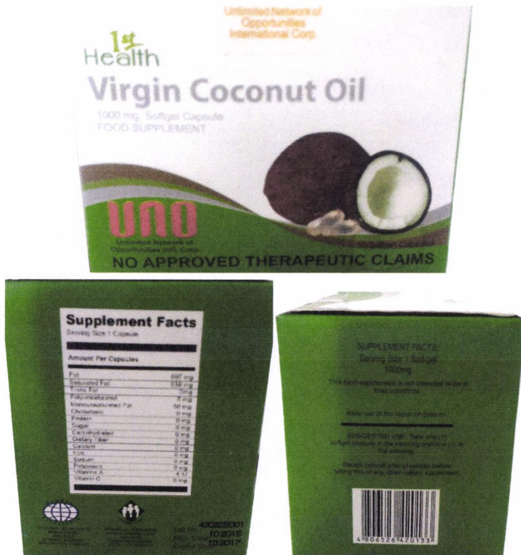
Figure 3. Unregistered 1 st Health Virgin Coconut Oil