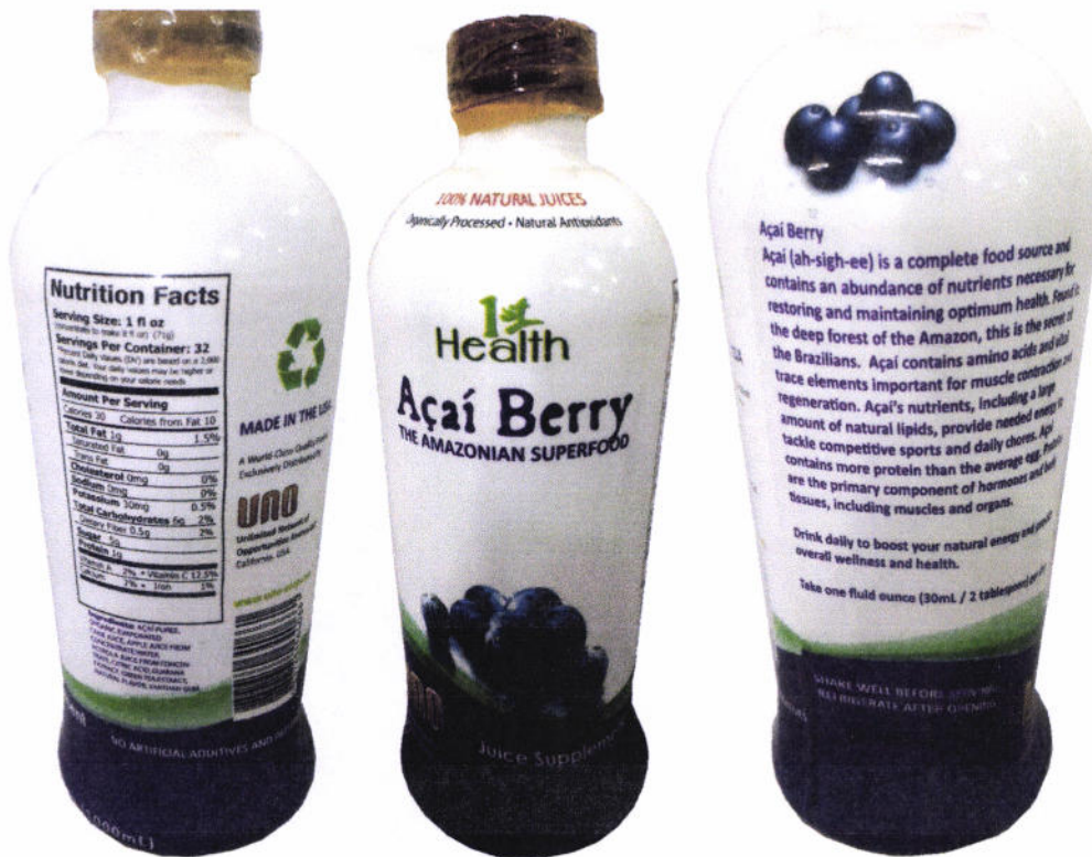
Figure 1. Unregistered 1 st Health Acai Berry the Amazonian Superfood

The Food and Drug Administration (FDA) advises the public against the purchase and consumption of the following unregistered food products and food supplement: