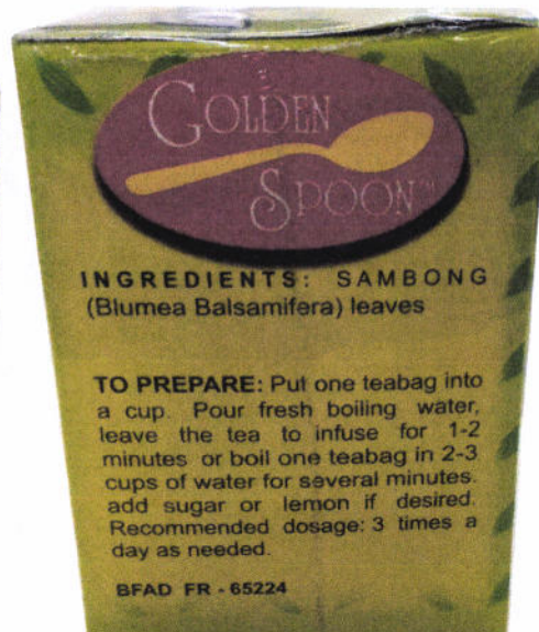
Figure 1. Unregistered Golden Spoon Sambong Herbal Tea Health Drink