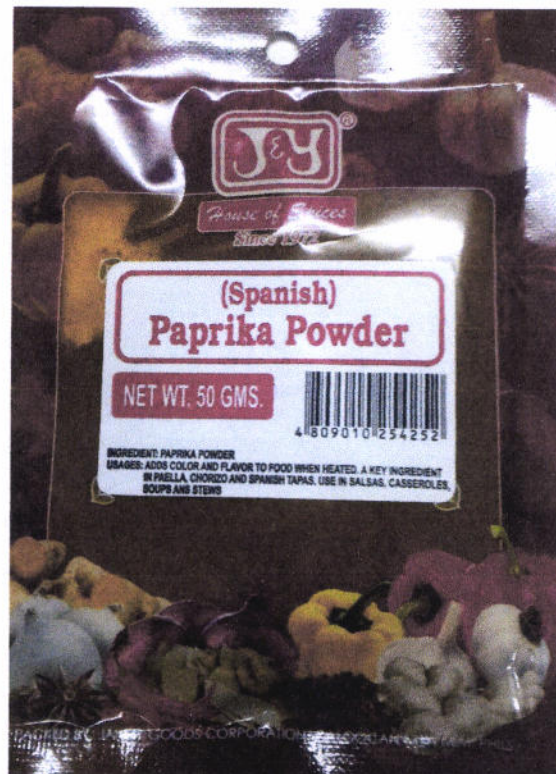
Figure 3. Unregistered J&Y House of Spices (Spanish) Paprika Powder

FDA post-marketing surveillance (PMS) activities have verified that the abovementioned food products have not gone through the registration process of the agency and have not been issued the proper authorization in the form of Certificate of Product Registration. Pursuant to Republic Act No. 9711, otherwise known as the "Food and Drug Administration Act of 2009", the manufacture, importation, exportation, sale, offering for sale, distribution, transfer,