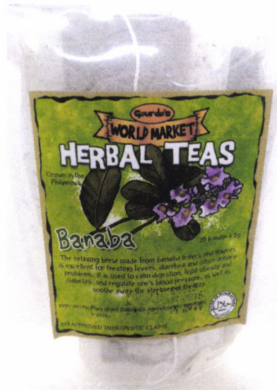
Figure 2. Unregistered Gourdo's World Market Herbal Teas Banaba