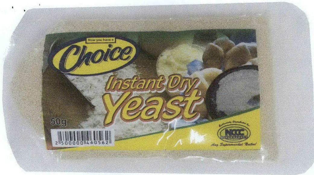
Figure 2. Choice Instant Dry Yeast