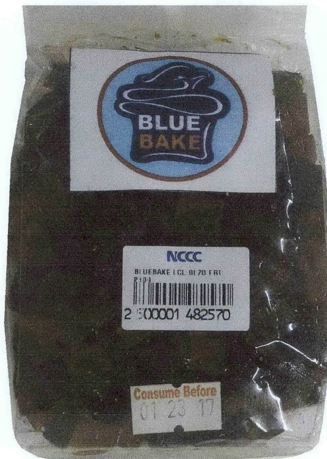
Figure 3. NCCC Blue Bake Glazed Fruit