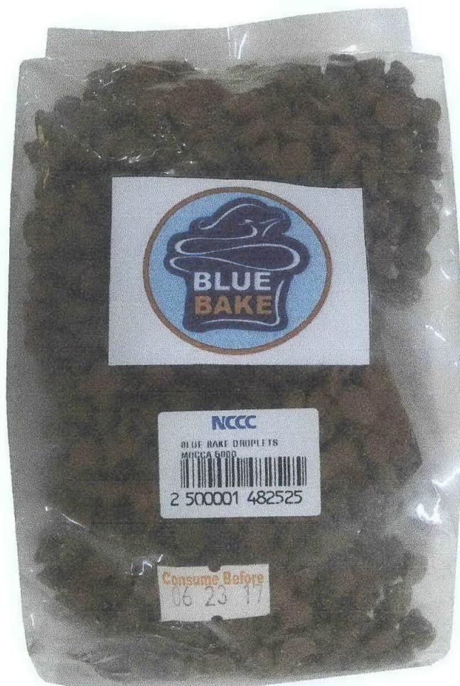
Figure 1. Blue Bake Droplets Mocha

The Food and Drug Administration (FDA) advises the public against the purchase and consumption of the following unregistered food products: