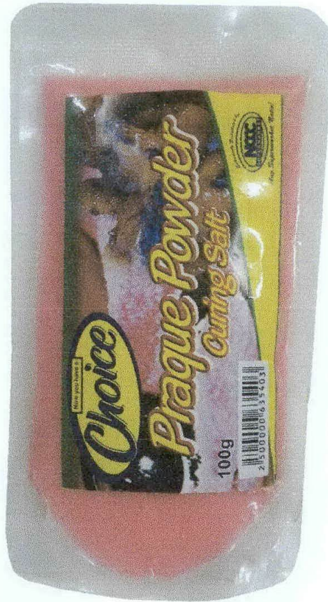
Figure 2. Choice Prague Powder Curing Salt