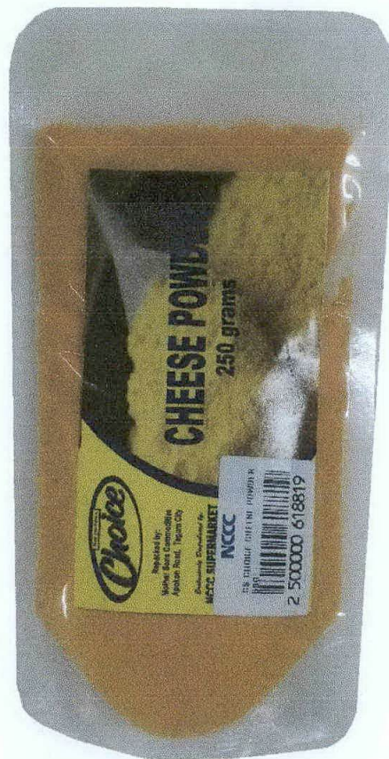
Figure 3. Choice Cheese Powder