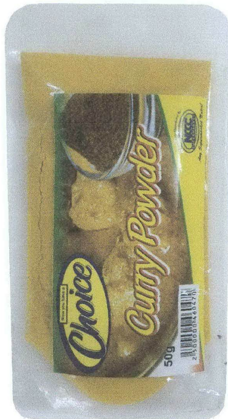
Figure 1. Choice Curry Powder

The Food and Drug Administration (FDA) advises the public against the purchase and consumption of the following unregistered food products: