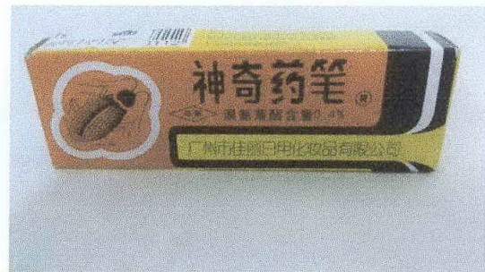
Figure 2. Miraculous Insecticide Chalk (Back Label)

FDA post-marketing surveillance (PMS) activities have verified that the abovementioned household/urban pesticide product has not gone through the registration process of the agency and has not been issued the proper marketing authorization (MA). Pursuant to Republic Act No. 9711, otherwise known as the “Food and Drug Administration Act of 2009”, the manufacture, importation, exportation, sale, offering for sale, distribution, transfer, non-consumer use, promotion, advertising or sponsorship of health products without the proper authorization from FDA is prohibited.