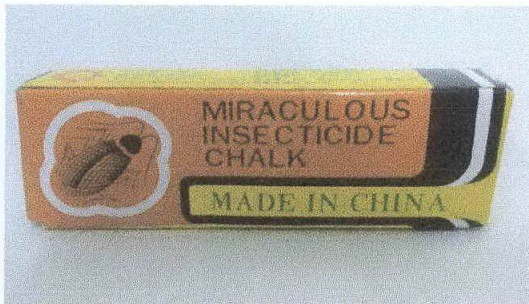
Figure 1. Miraculous Insecticide Chalk (Front Label)

The Food and Drug Administration (FDA) advises the public against the purchase and use of unregistered household/urban pesticide product with brand/product name MIRACULOUS INSECTICIDE CHALK .