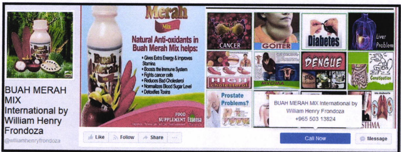
Figure 3. Unapproved claims of Buah Merah Mix Used in Social Media