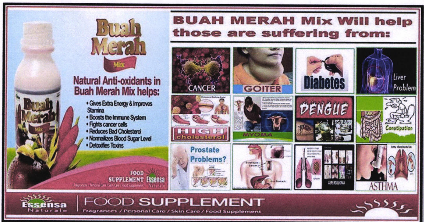
Figure 4. Unapproved claims of Buah Merah Mix