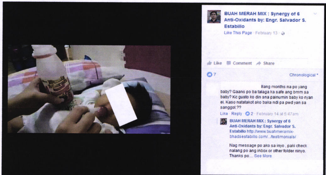
Figure 5. Infant being provided with Buah Merah Mix.

Further to this, the FDA also warns the public on the use or provision of Buah Merah Mix and other similar food products to infants and to children without proper recommendation from their pediatricians.