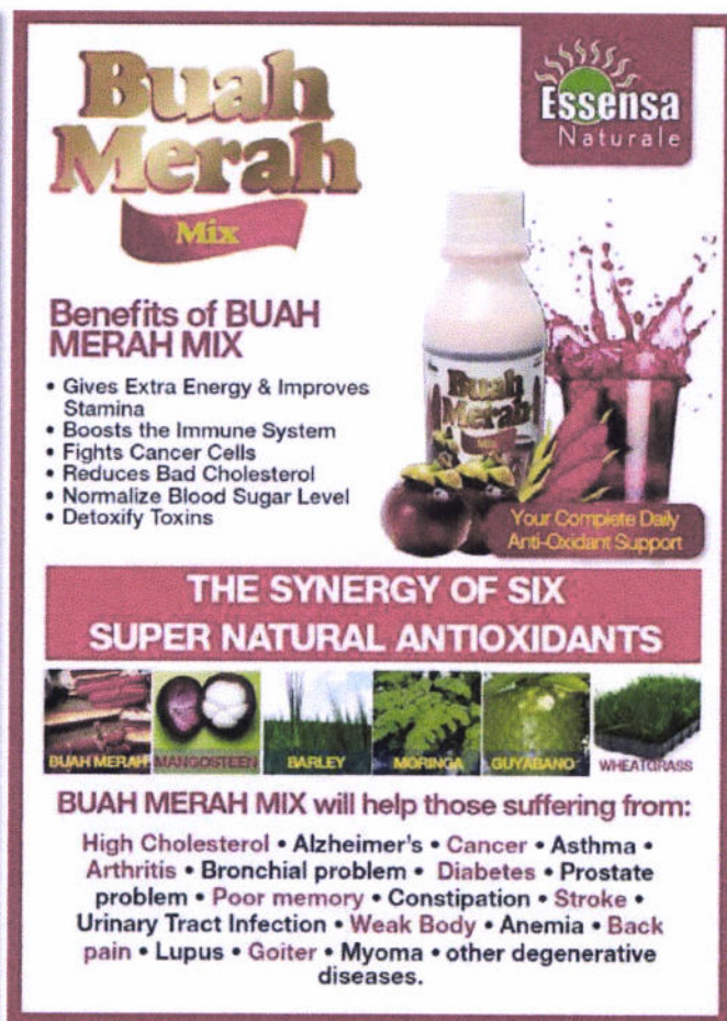
Figures 1 and 2. Unapproved claims of Buah Merah Mix