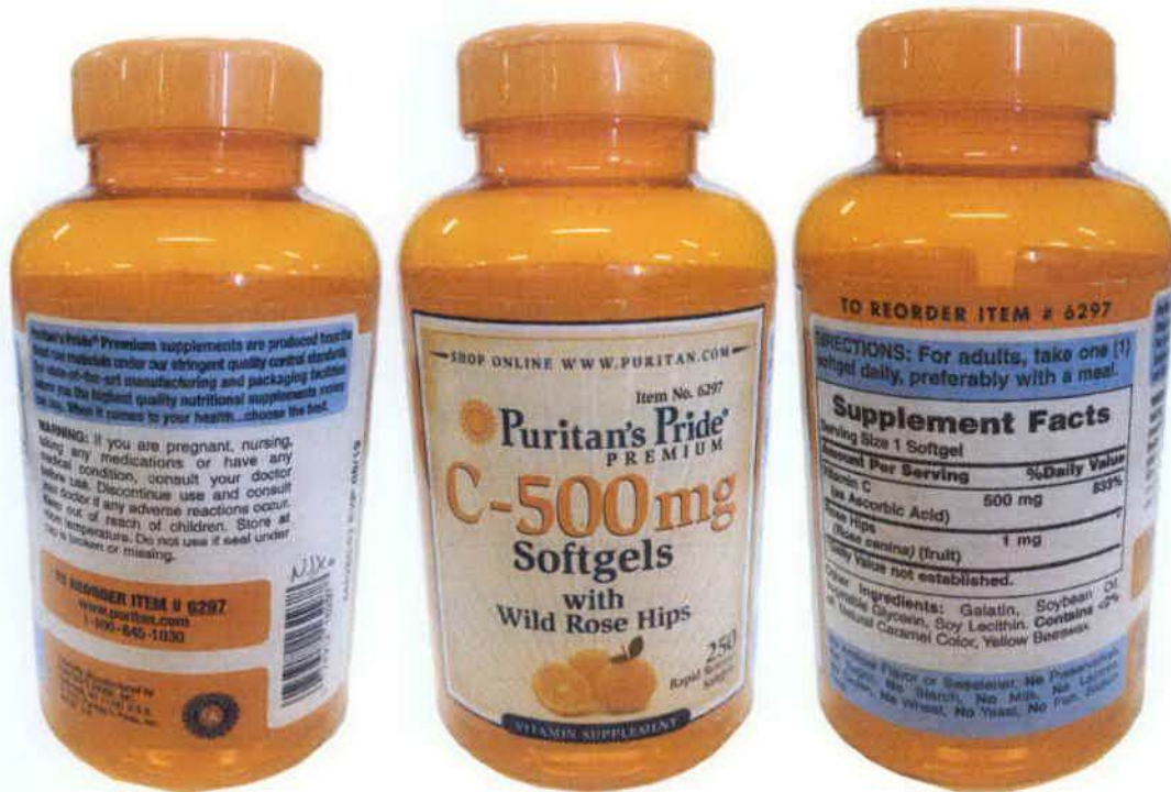
Figure 9. Unregistered Puritan's Pride Premium C-500mg with Wild Rose Hips