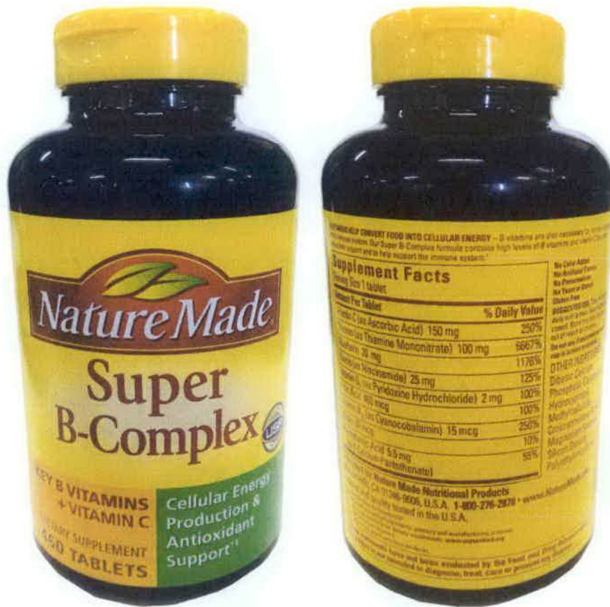
Figure 10. Unregistered Nature Made Super B-Complex

FDA post-marketing surveillance (PMS) activities have verified that the abovementioned food products and food supplements have not gone through the registration process of the agency and have not been issued the proper authorization in the form of Certificate of Product Registration. Pursuant to Republic Act No. 9711, otherwise known as the “Food and Drug Administration Act of 2009”, the manufacture, importation, exportation, sale, offering for sale, distribution, transfer, non-consumer use, promotion, advertising or sponsorship of health products without the proper authorization from FDA is prohibited.