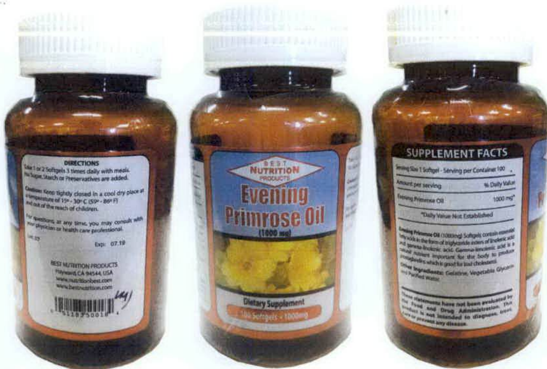
Figure 4. Best Nutrition Products Evening Primrose Oil