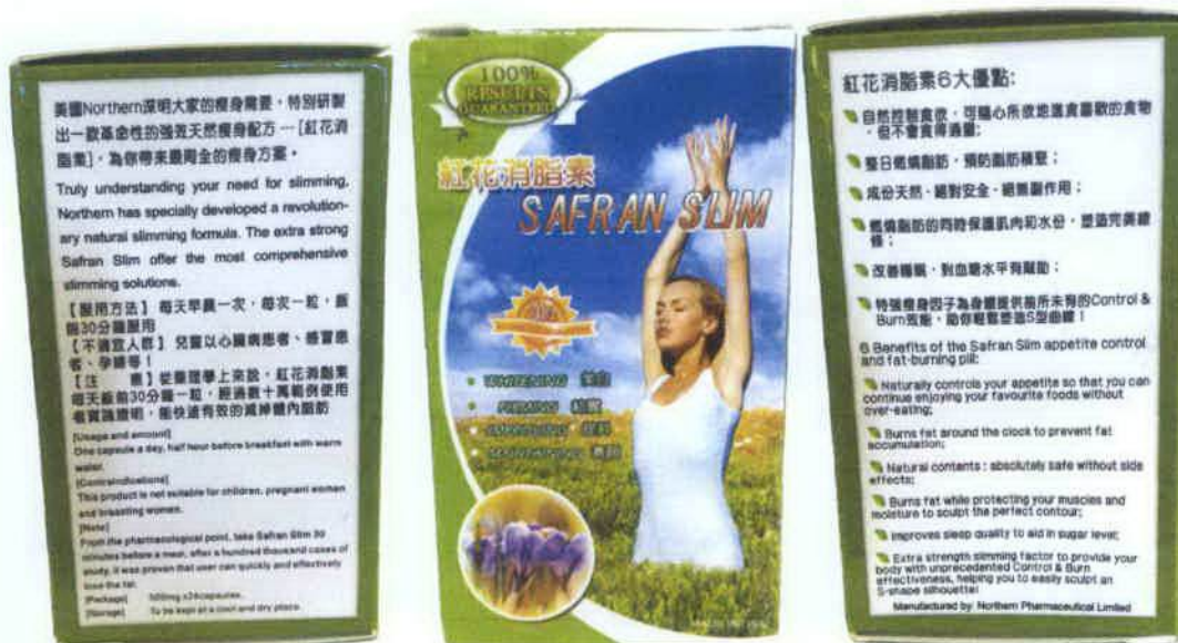
Figure 1. Unregistered Safran Slim

The Food and Drug Administration (FDA) advises the public against the purchase and consumption of the following unregistered food products and food supplements: