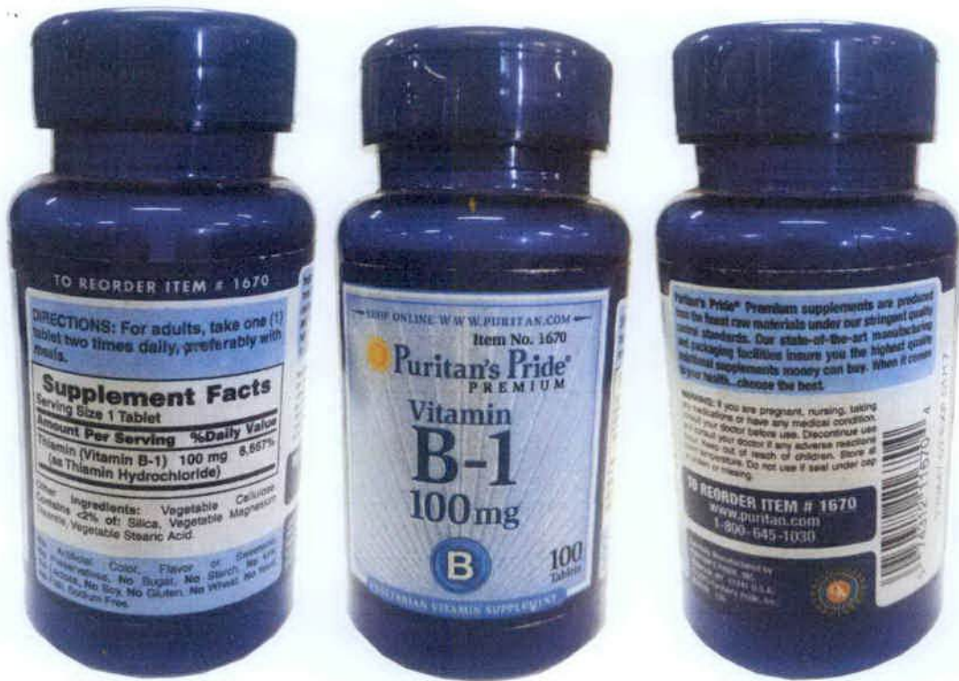
Figure 8. Unregistered Puritan's Pride Premium Vitamin B-1 100mg