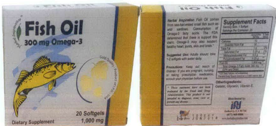
Figure 3. Unregistered Fish Oil 300 mg Omega-3