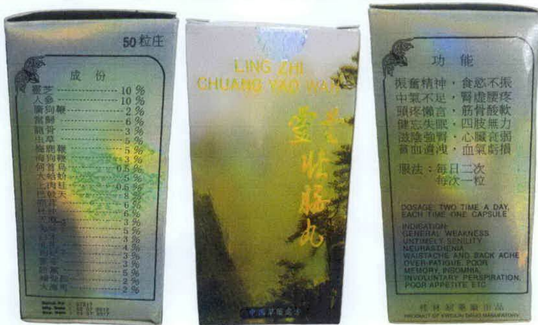
Figure 7. Unregistered Ling Zhi Chuang Yao Wan