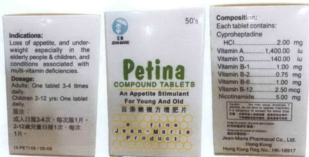
Figure 5. Unregistered Petina Compound Tablets