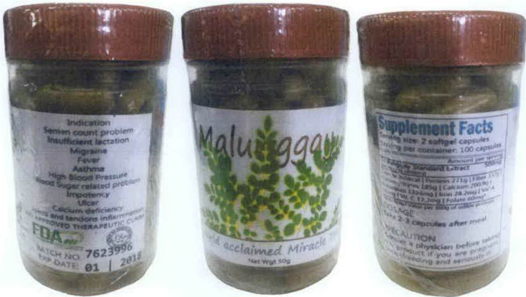
Figure 8. Unregistered Malunggay Food Supplement