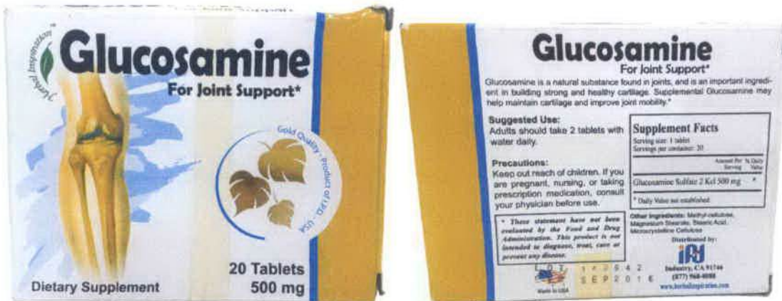
Figure 1. Unregistered Glucosamine for Joint Support

The Food and Drug Administration (FDA) advises the public against the purchase and consumption of the following unregistered food products and food supplements: