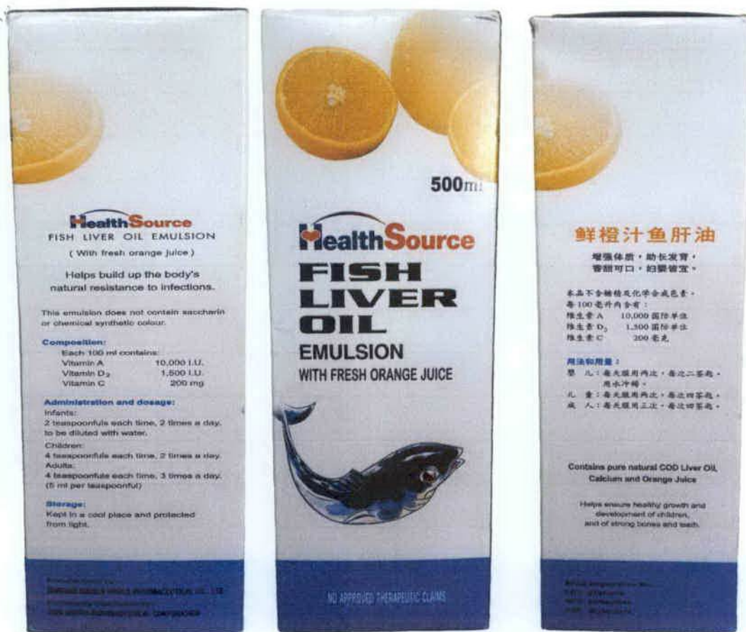
Figure 4. Unregistered HealthSource Fish Liver Oil Emulsion with Fresh Orange Juice