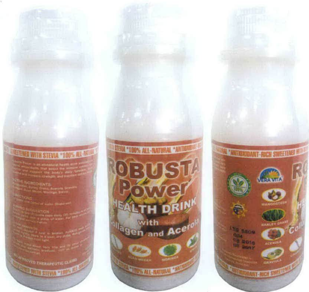
Figure 6. Unregistered Robusta Power Health Drink with Collagen and Acerola