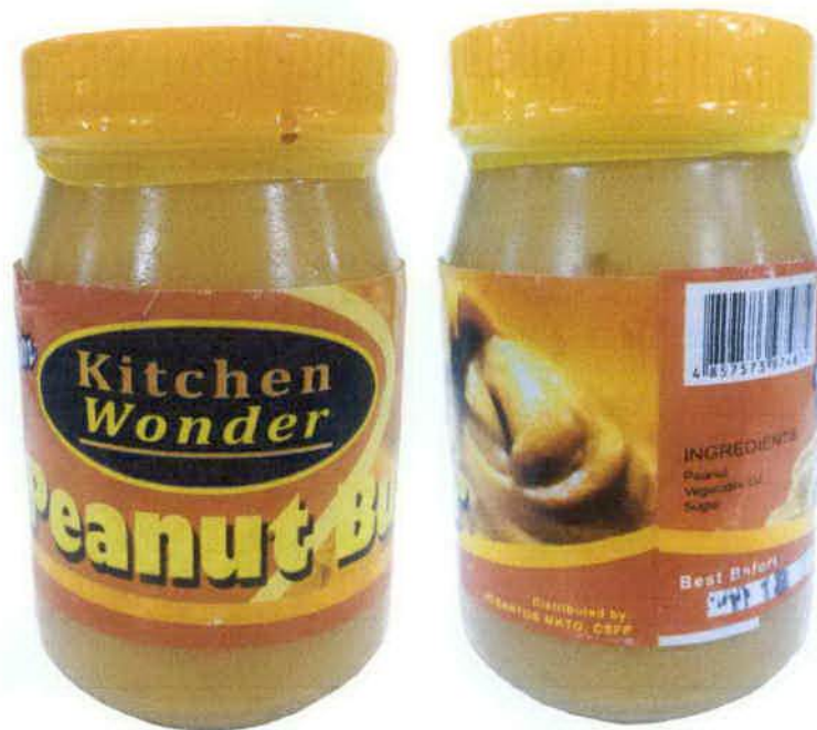
Figure 10. Unregistered Kitchen Wonder Peanut Butter

FDA post-marketing surveillance (PMS) activities have verified that the abovementioned food products and food supplements have not gone through the registration process of the agency and have not been issued the proper authorization in the form of Certificate of Product Registration. Pursuant to Republic Act No. 9711, otherwise known as the “Food and Drug Administration Act of 2009”, the manufacture, importation, exportation, sale, offering for sale, distribution, transfer, non-consumer use, promotion, advertising or sponsorship of health products without the proper authorization from FDA is prohibited.