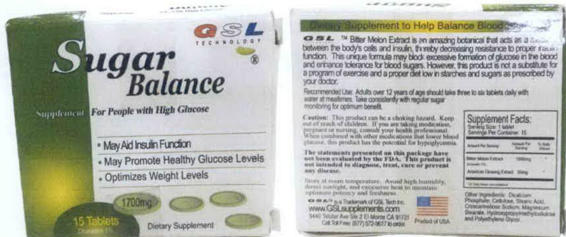
Figure 2. Unregistered Sugar Balance for People with High Glucose