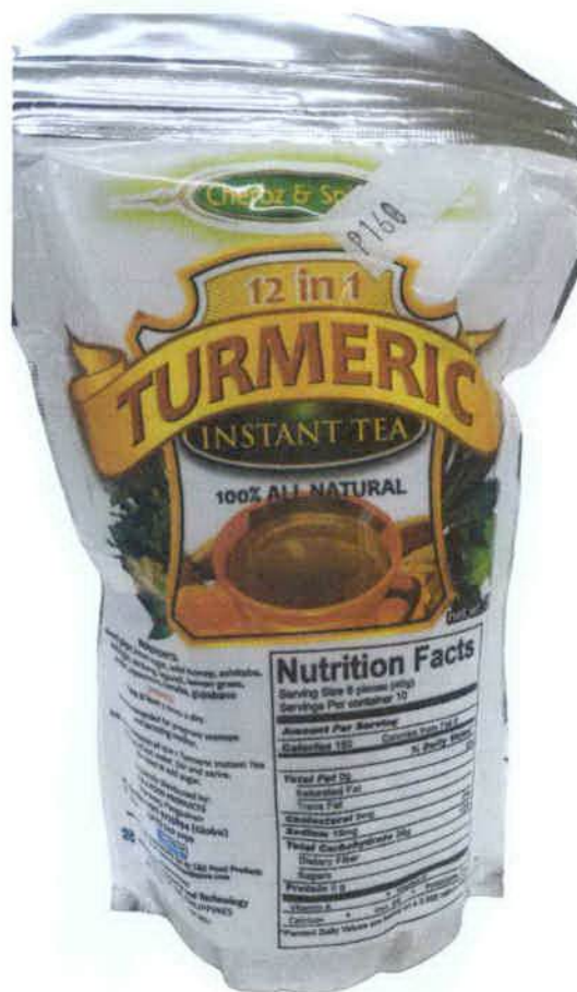
Figure 9. Unregistered Cherbz & Spice 12 in 1 Turmeric Instant Tea