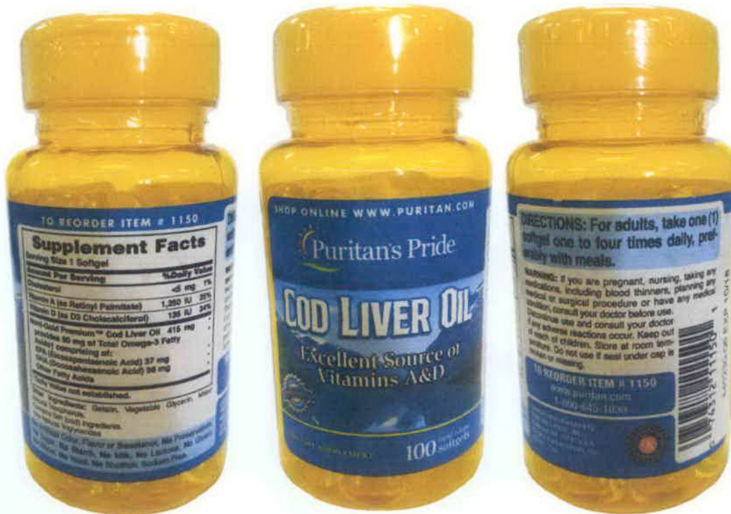
Figure 1. Unregistered Puritan's Pride Cod Liver Oil

The Food and Drug Administration (FDA) advises the public against the purchase and consumption of the following unregistered food products and food supplements: