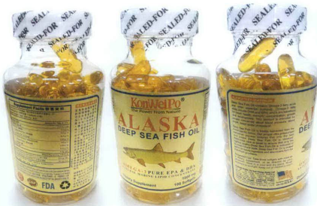
Figure 6. Unregistered KonWeiPo Alaska Deep Sea Fish Oil