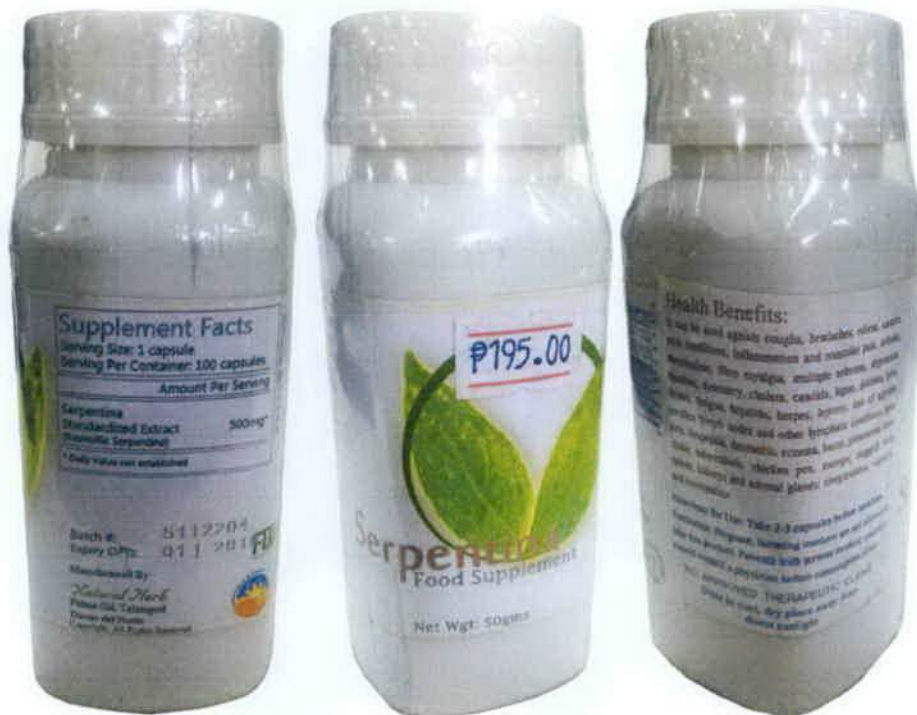
Figure 11. Unregistered Natural Herb Serpentina Food Supplement

FDA post-marketing surveillance (PMS) activities have verified that the abovementioned food products and food supplements have not gone through the registration process of the agency and have not been issued the proper authorization in the form of Certificate of Product Registration. Pursuant to Republic Act No. 9711, otherwise known as the “Food and Drug Administration Act of 2009”, the manufacture, importation, exportation, sale, offering