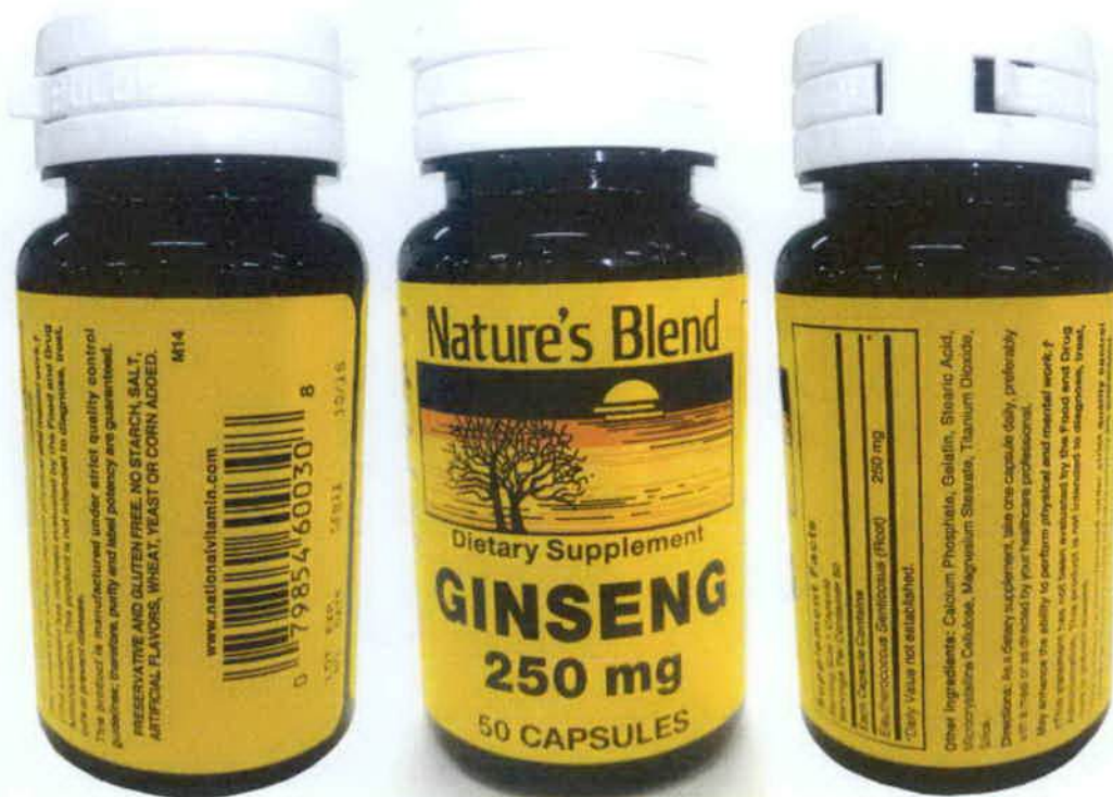
Figure 3. Unregistered Nature's Blend Ginseng 250mg