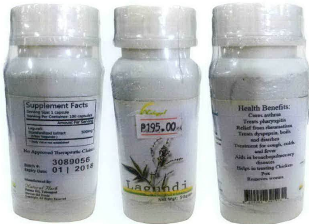
Figure 10. Unregistered Natural Herb Lagundi Food Supplement