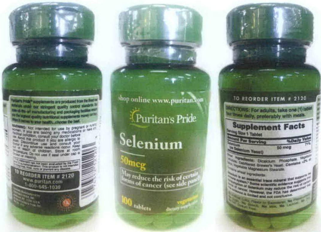
Figure 5. Unregistered Puritan's Pride Selenium 50mcg