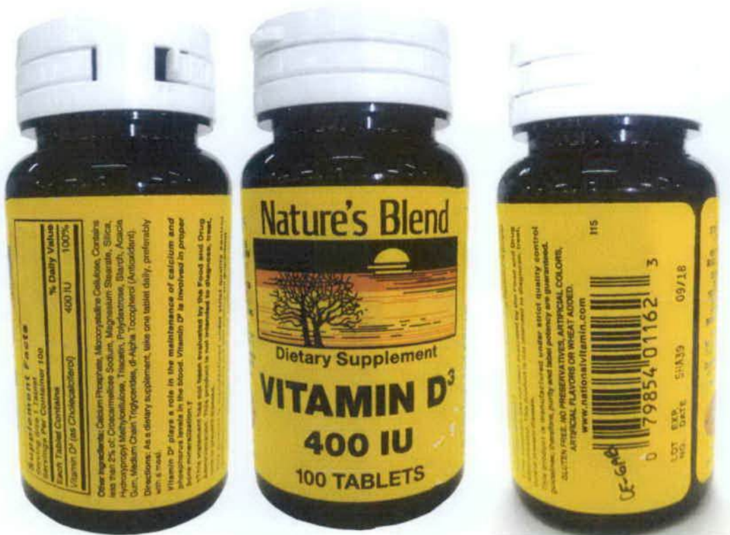
Figure 4. Unregistered Nature's Blend Vitamin D3 400 IU