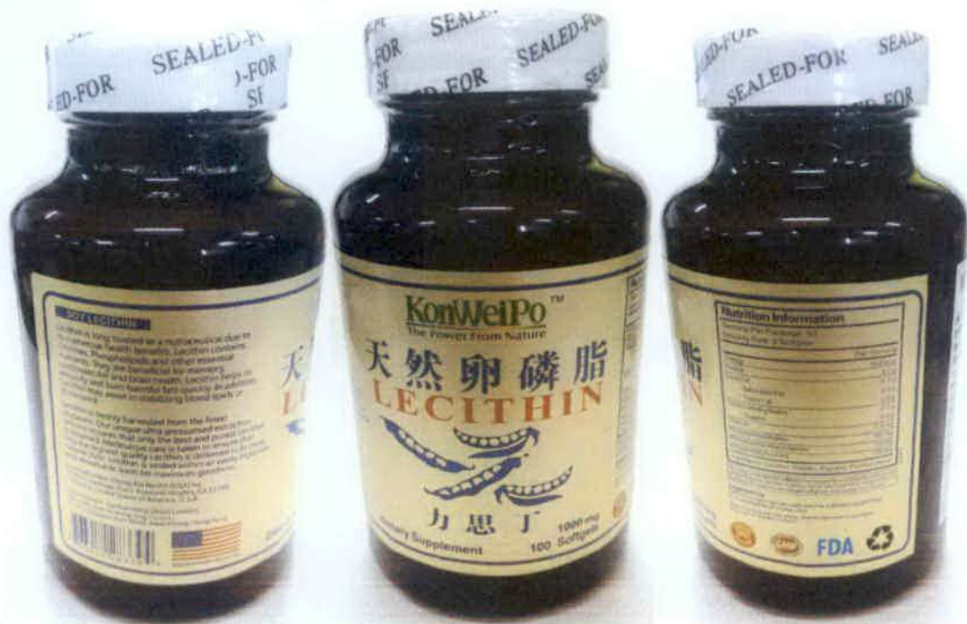
Figure 7. Unregistered KonWeiPo Lecithin