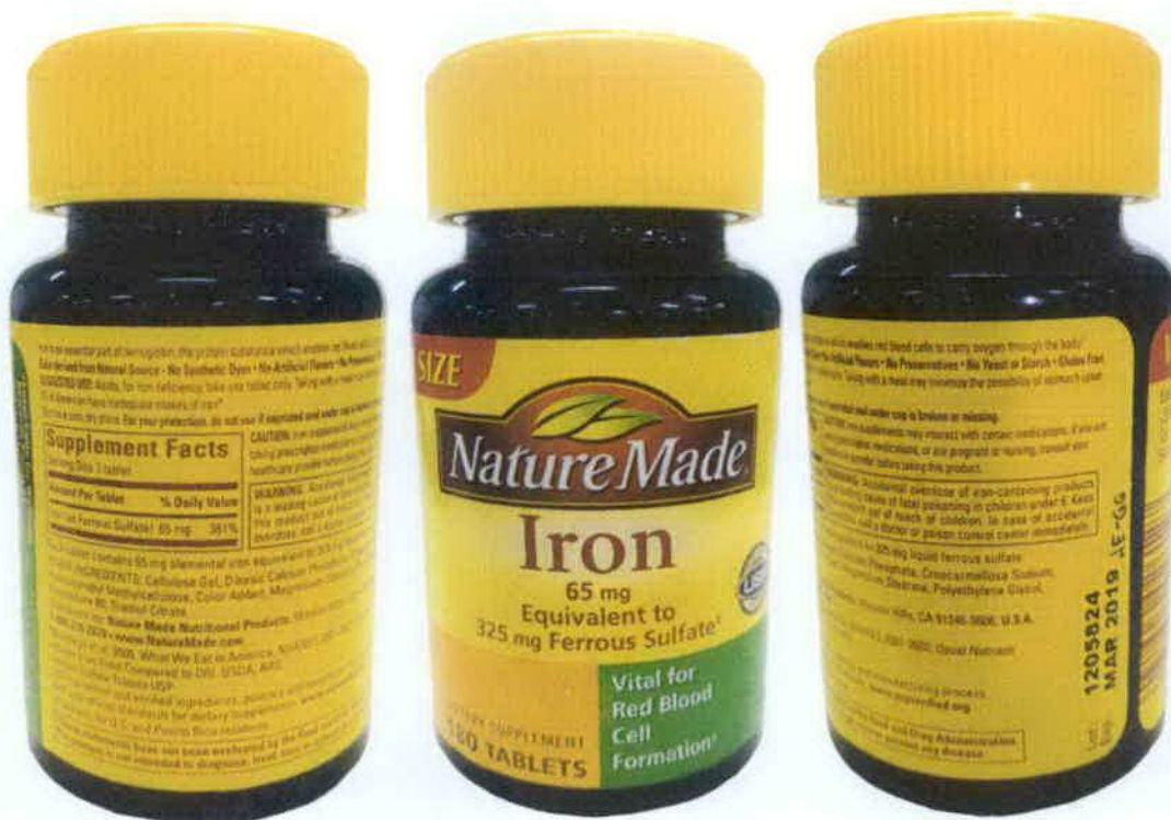
Figure 2. Unregistered Nature Made Iron 65 mg