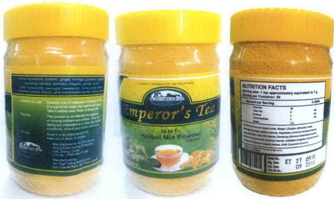
Figure 8. Unregistered Emperor's Tea 15 in 1 Herbal Mix Powder Original