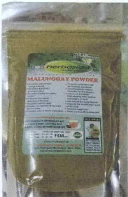
Figure 8. Unregistered BDO HERBOSIDO Herbal products Malunggay Powder