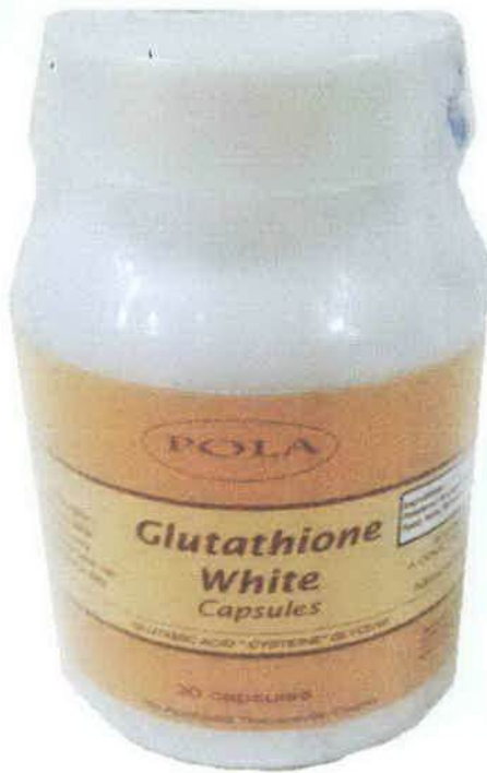
Figure 6. Unregistered POLA Glutathione