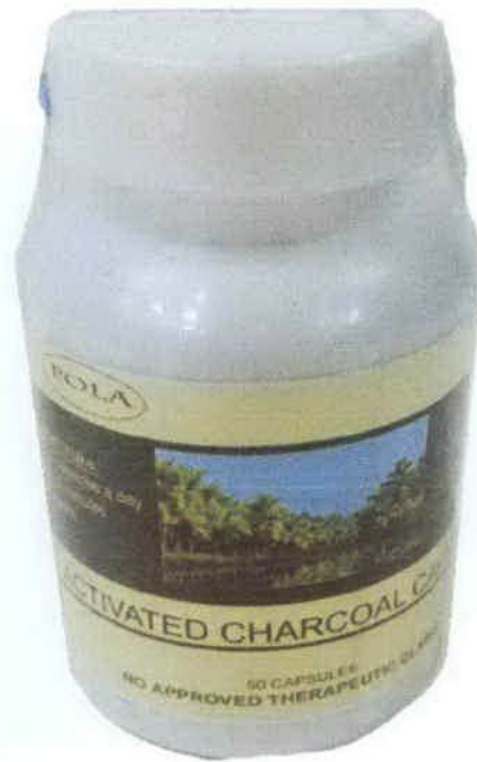
Figure 7. Unregistered POLA Activated Charcoal White Capsules