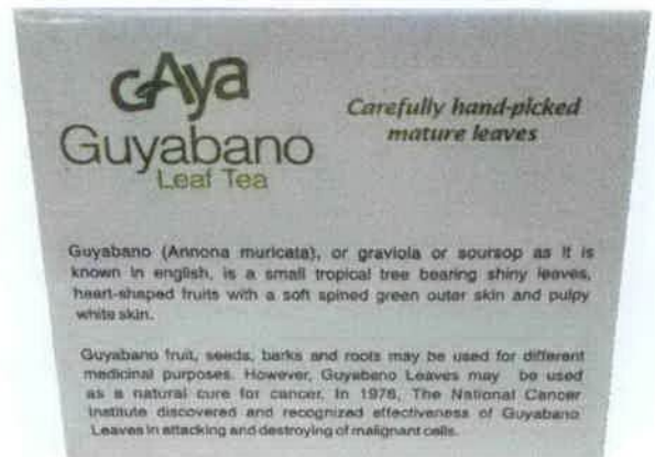
Figure 4. Unregistered Caya Guyabano Leaf Tea