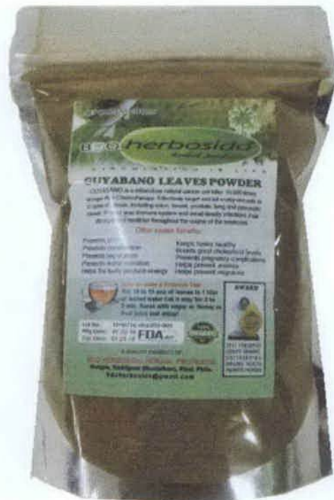
Figure 9. Unregistered BDO HERBOSIDO Herbal Products Guyabano Leaves Powder