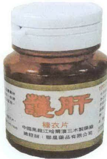
Figure 3. Unregistered Liver Aid (Sugar-Coated Tab)