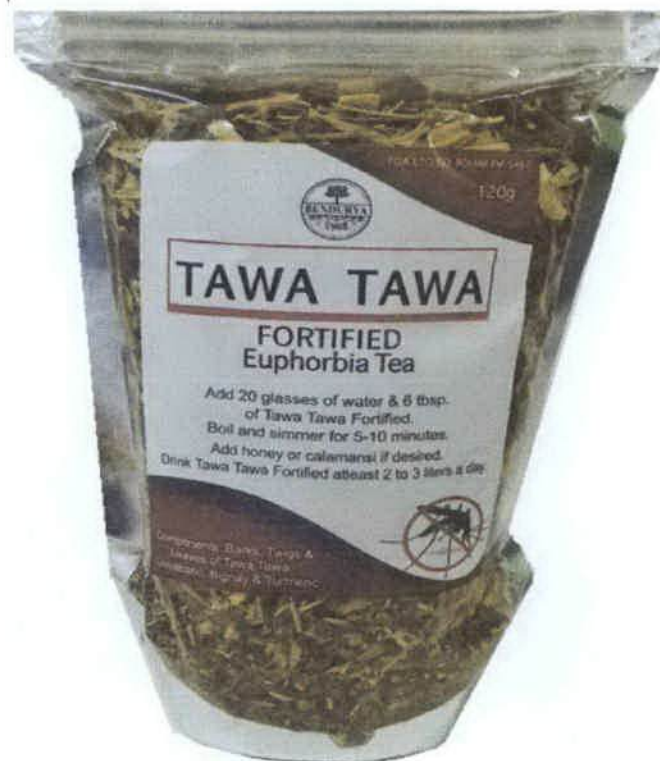
Figure 10. Unregistered BENDURYA TAWA TAWA Fortified Euphorbia Tea

FDA post-marketing surveillance (PMS) activities have verified that the abovementioned food supplements have not gone through the registration process of the agency and have not been issued the proper authorization in the form of Certificate of Product Registration. Pursuant to Republic Act No. 9711, otherwise known as the “Food and Drug Administration Act of 2009”, the manufacture, importation, exportation, sale, offering for sale, distribution, transfer, non-consumer use, promotion, advertising or sponsorship of health products without the proper authorization from FDA is prohibited.