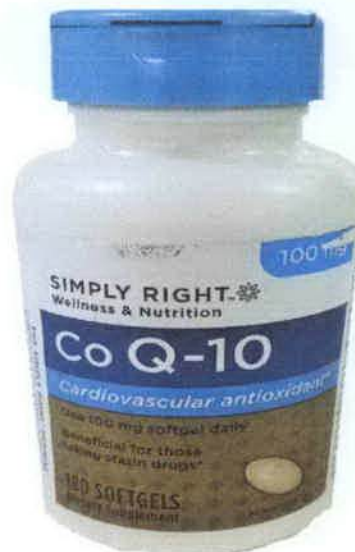
Figure 2. SIMPLY RIGHT Wellness & Nutrition Co Q-10 Cardiovascular Antioxidant