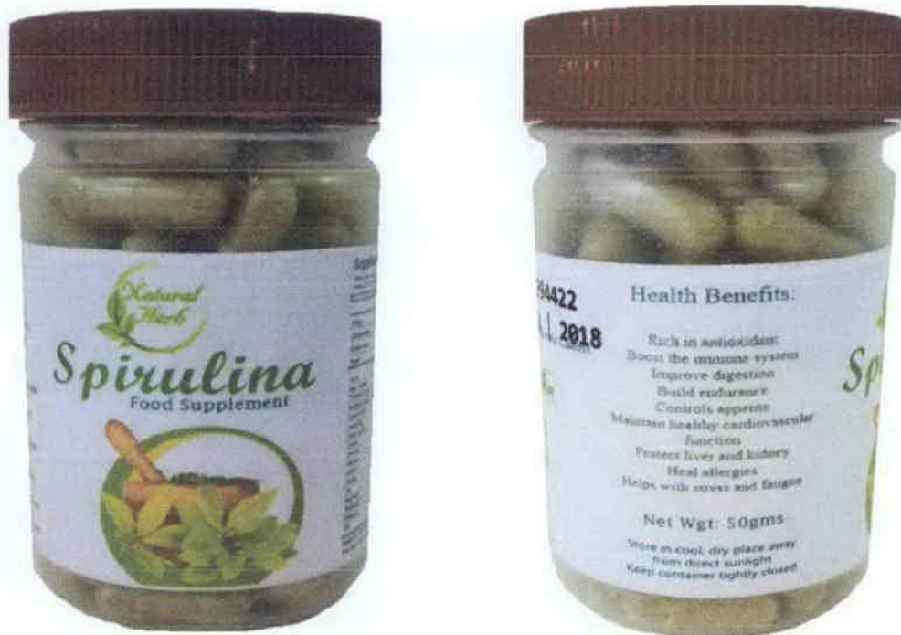
Figure 4. Unregistered Natural Herb Spirulina Food Supplement

FDA post-marketing surveillance (PMS) activities have verified that the abovementioned food supplements have not gone through the registration process of the agency and have not been issued the proper authorization in the form of Certificate of Product Registration. Pursuant to Republic Act No. 9711, otherwise known as the “Food and Drug Administration Act of 2009”, the manufacture, importation, exportation, sale, offering for sale, distribution, transfer, non-consumer use, promotion, advertising or sponsorship of health products without the proper authorization from FDA is prohibited.