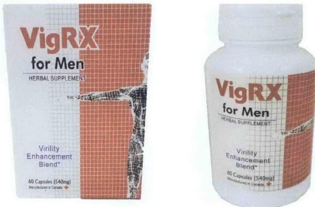
Figure 3. Unregistered VigRX for Men Herbal Supplement