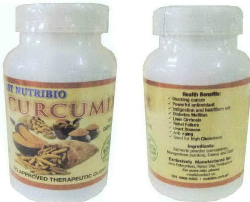
Figure 1. Unregistered FIRST NUTRIBIO CURCUMIX

The Food and Drug Administration (FDA) advises the public against the purchase and consumption of the following unregistered food supplements: