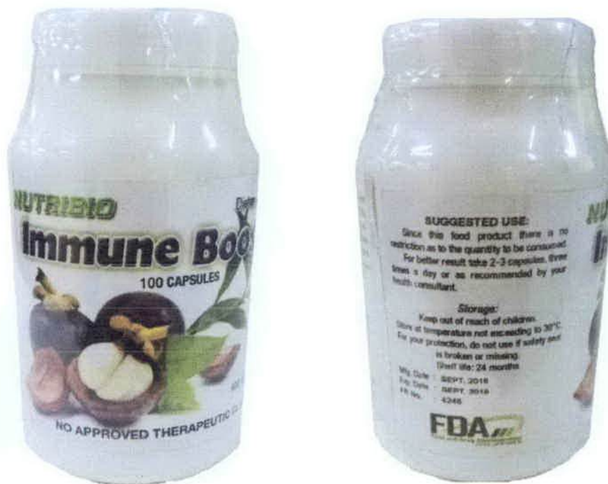
Figure 2. Unregistered NUTRIBIO Immune Booster