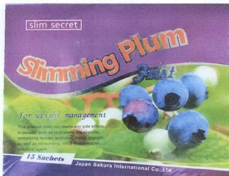
Figure 2. Unregistered Slim Secret Slimming Plum Fast

FDA post-marketing surveillance (PMS) activities have verified that the abovementioned food products have not gone through the registration process of the agency and have not been issued the proper authorization in the form of Certificate of Product Registration. Pursuant to Republic Act No. 9711, otherwise known as the “Food and Drug Administration Act of 2009”, the manufacture, importation, exportation, sale, offering for sale, distribution, transfer, non-consumer use, promotion, advertising or sponsorship of health products without the proper authorization from FDA is prohibited.