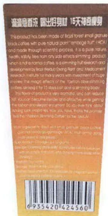
Figure 1. Unregistered Fashion Slimming Coffee