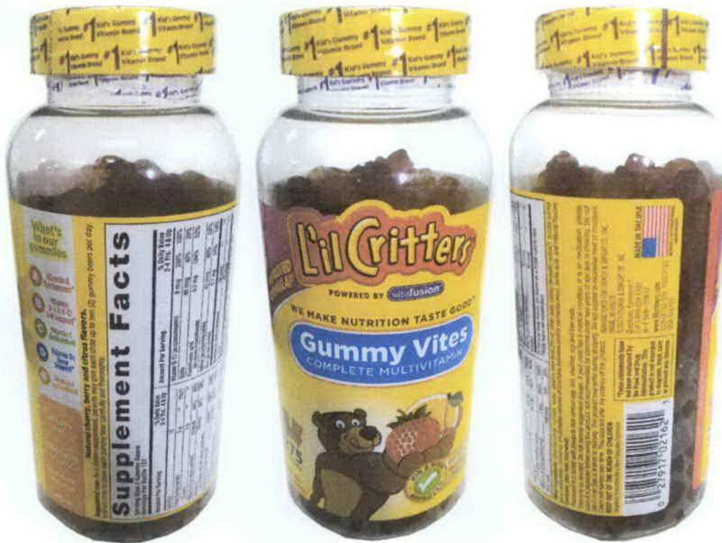
Figure 2. Unregistered L'il Critters Gummy Vites Complete Multivitamin