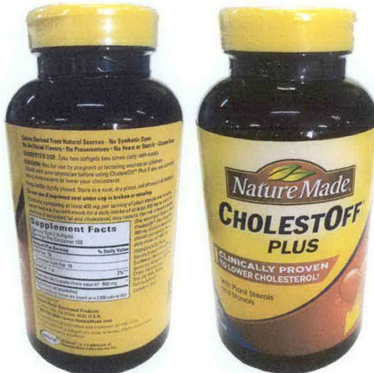
Figure 3. Unregistered Nature Made CholestOff Plus

FDA post-marketing surveillance (PMS) activities have verified that the abovementioned food supplements have not gone through the registration process of the agency and have not been issued the proper authorization in the form of Certificate of Product Registration. Pursuant to Republic Act No. 9711, otherwise known as the “Food and Drug Administration Act of 2009”, the manufacture, importation, exportation, sale, offering for sale, distribution,