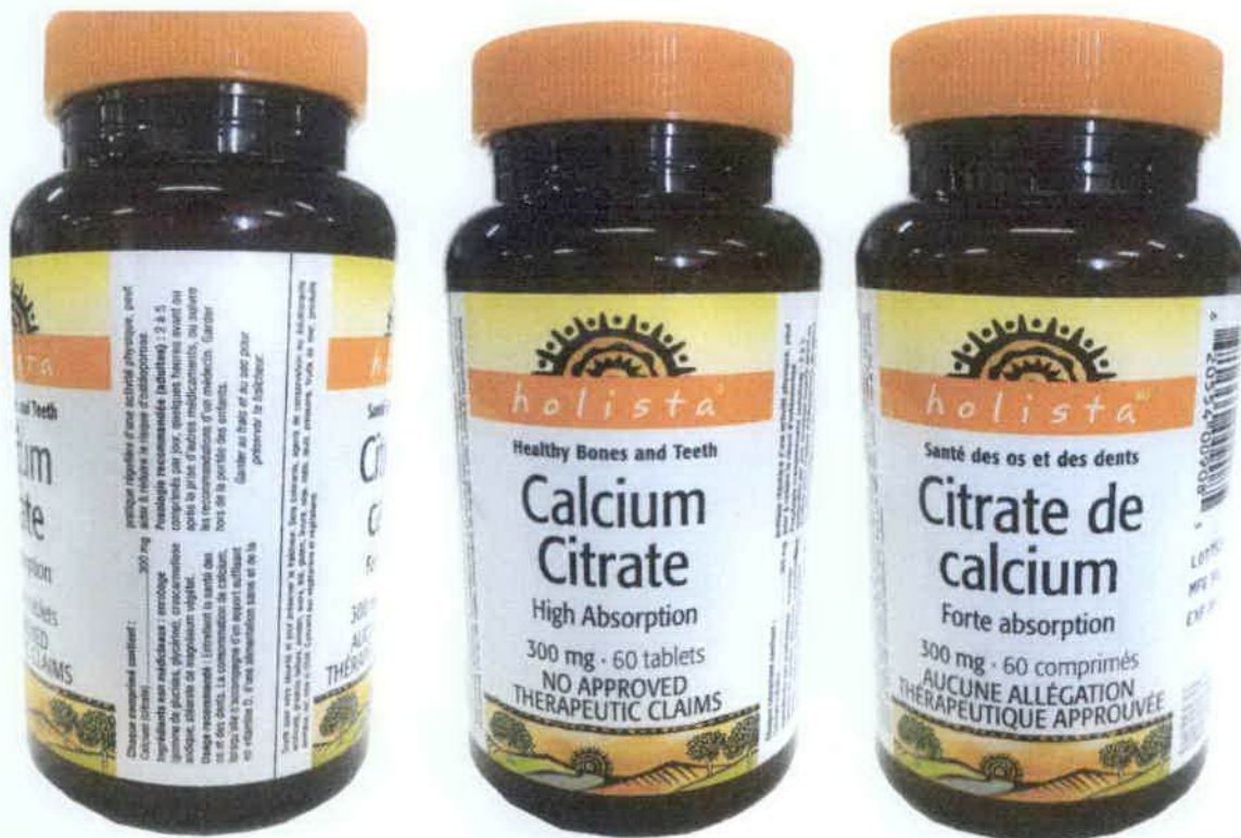
Figure 3. Unregistered Holista Calcium Citrate

FDA post-marketing surveillance (PMS) activities have verified that the abovementioned food product and food supplements have not gone through the registration process of the agency and have not been issued the proper authorization in the form of Certificate of Product Registration. Pursuant to Republic Act No. 9711, otherwise known as the "Food and