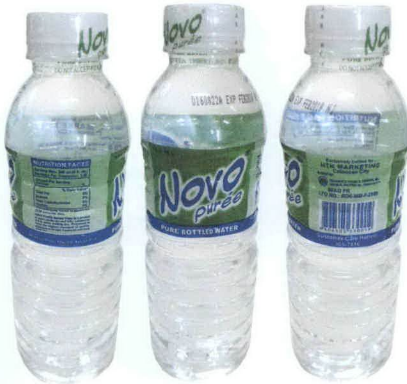
Figure 2. Unregistered Novo Puree Pure Bottled Water