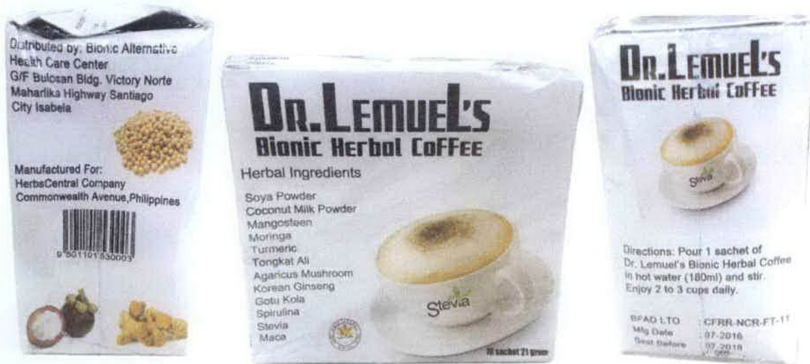
Figure 2. Unregistered Dr. Lemuel's Bionic Herbal Coffee