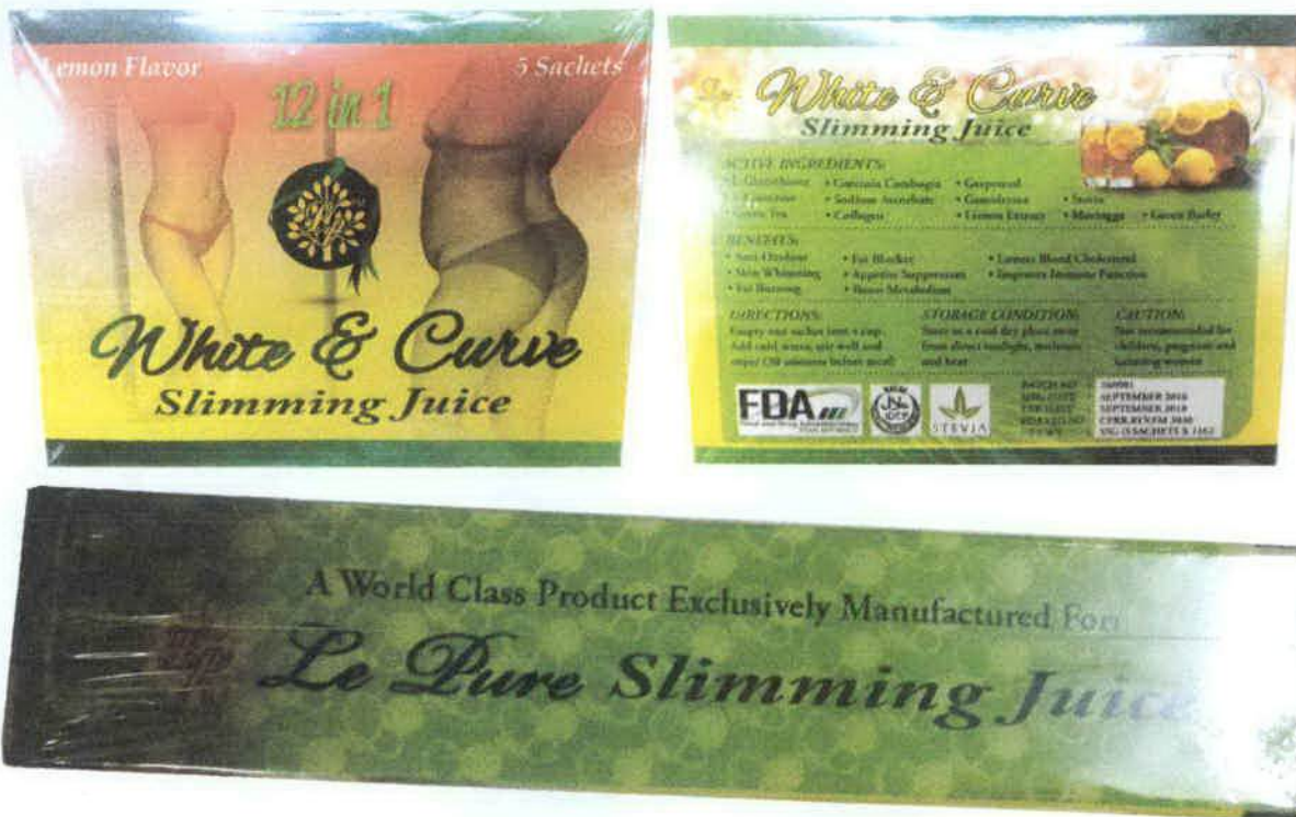
Figure 3. Unregistered White & Curve Slimming Juice

FDA post-marketing surveillance (PMS) activities have verified that the abovementioned food products and food supplement have not gone through the registration process of the agency and have not been issued the proper authorization in the form of Certificate of Product Registration. Pursuant to Republic Act No. 9711, otherwise known as the "Food and Drug Administration Act of 2009", the manufacture, importation, exportation, sale, offering for sale, distribution, transfer, non-consumer use, promotion, advertising or sponsorship of health products without the proper authorization from FDA is prohibited.