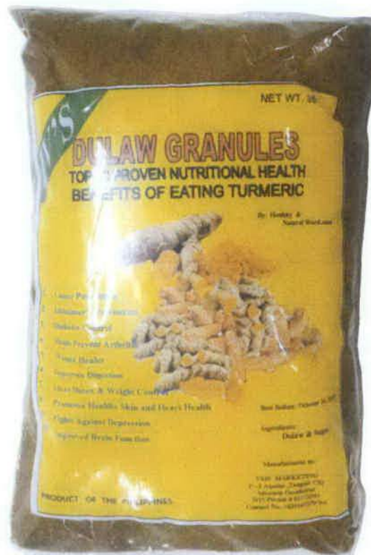
Figure 3. Unregistered JV's Dulaw Granules