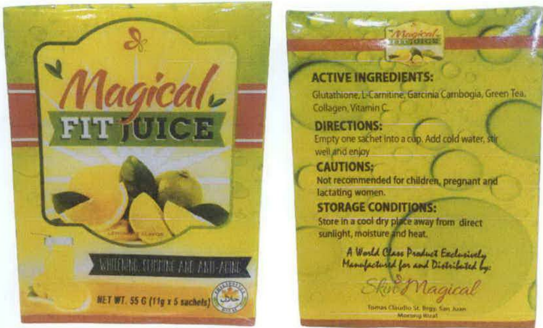
Figure 4. Unregistered Magical Fit Juice