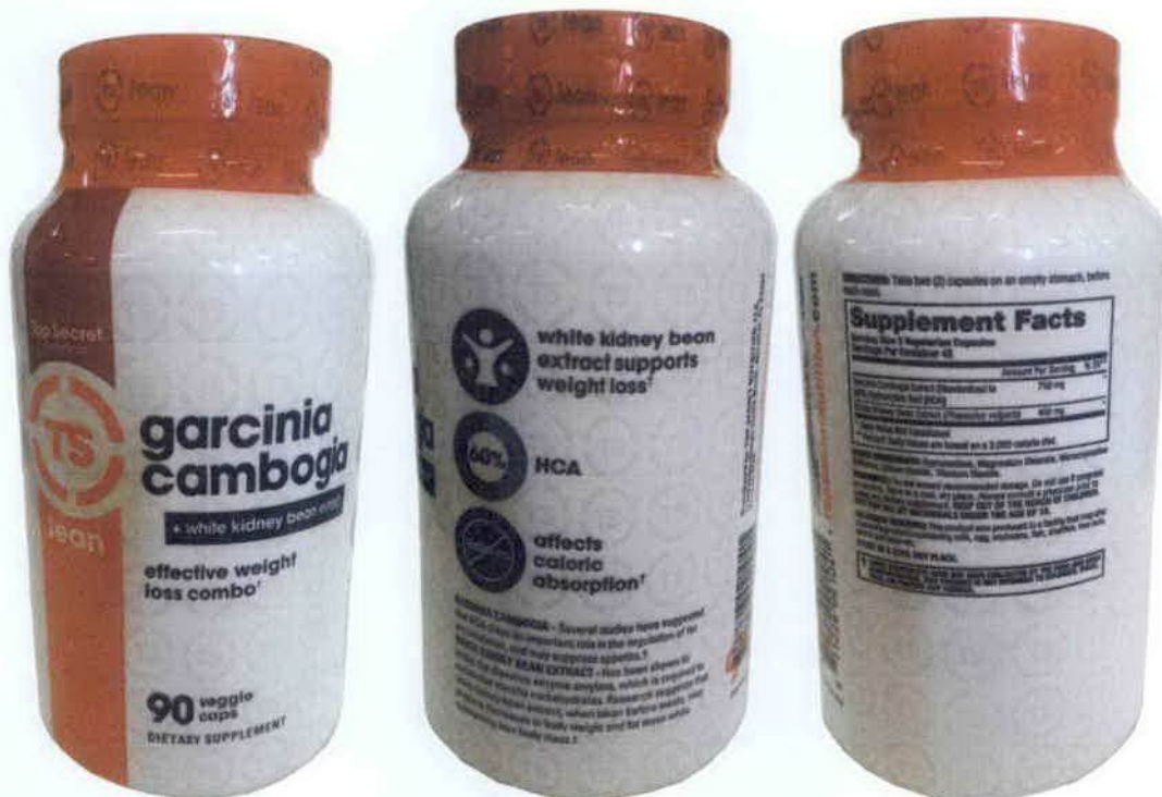
Figure 7. Unregistered Top Secret Nutrition Garcinia Cambogia + White Kidney Bean Extract