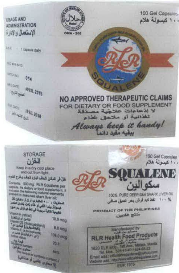
Figure 5. Unregistered RLR Squalene 100% Pure Deep-sea Shark Liver Oil