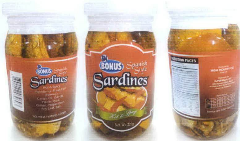
Figure 9. Unregistered SM Bonus Spanish Style Sardines