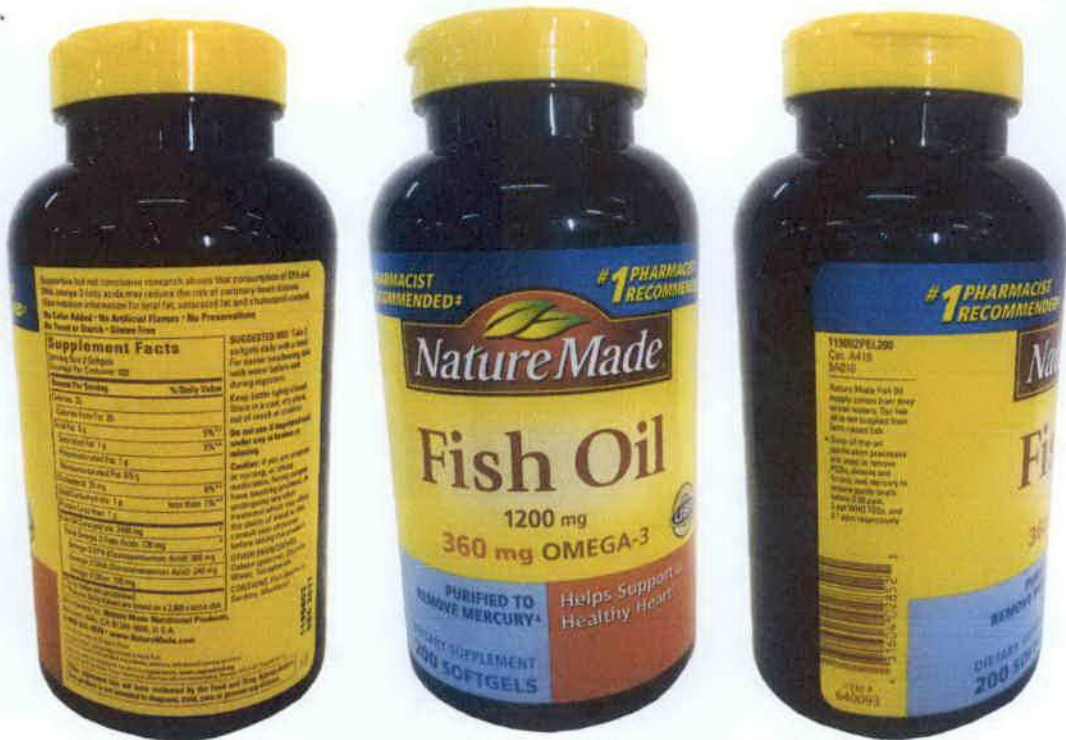
Figure 2. Unregistered Nature Made Fish Oil 1200 mg