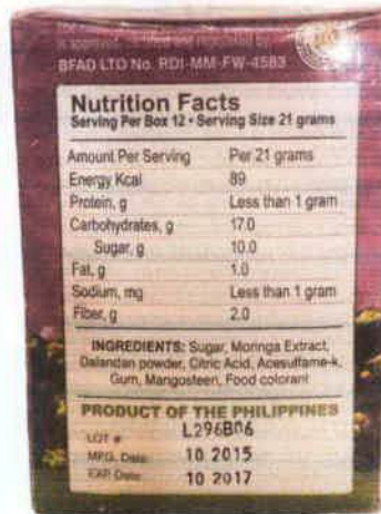
Figure 8. Unregistered Lorenzana's Mangosteen Malunggay Juice