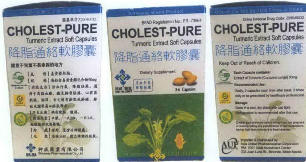
Figure 1. Unregistered Cholest-Pure Turmeric Extract Soft Capsules

The Food and Drug Administration (FDA) advises the public against the purchase and consumption of the following unregistered food products and food supplements: