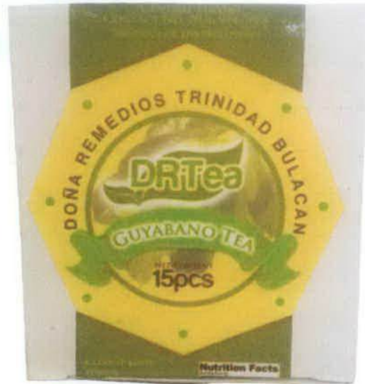
Figure 6. Unregistered DRiTea Guyabano Tea