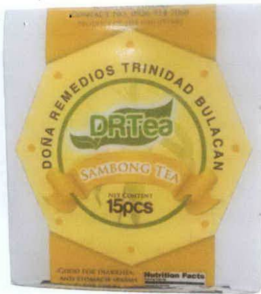
Figure 5. Unregistered DRiTea Sambong Tea