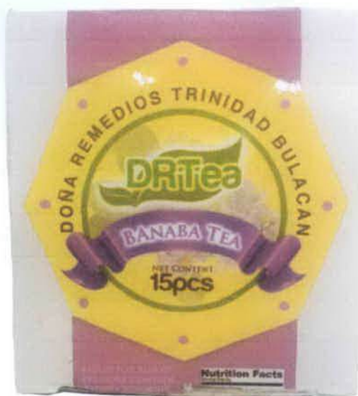
Figure 3. Unregistered DRTea Banaba Tea