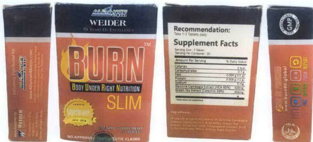
Figure 1. Unregistered Alliance in Motion Weider BURN Body Under Right Nutrition Slim

The Food and Drug Administration (FDA) advises the public against the purchase and consumption of the following unregistered food products and food supplements: