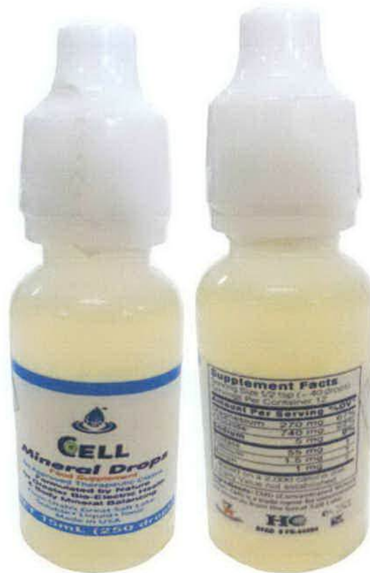
Figure 2. Unregistered Cell Mineral Drops