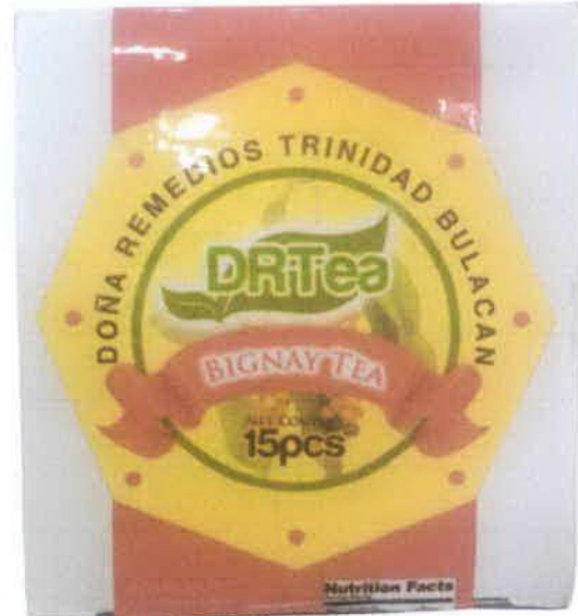
Figure 4. Unregistered DRTea Bignay Tea