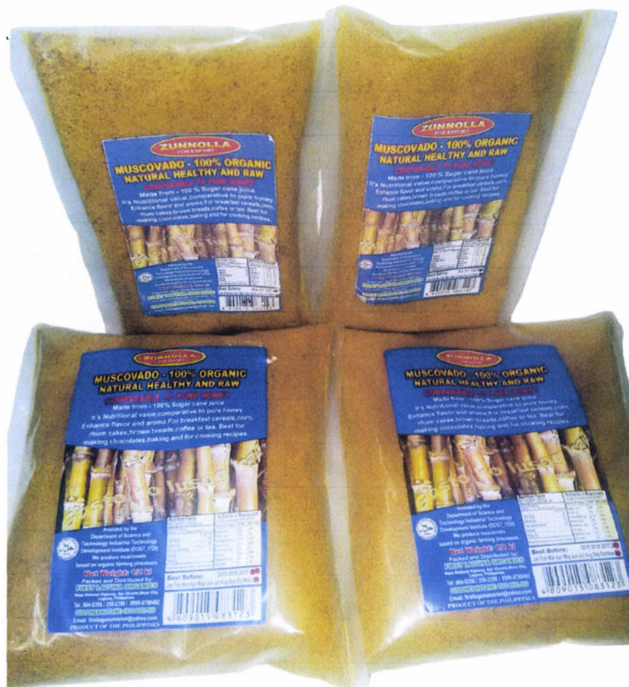
Figure 5. Unregistered Zunnolla Muscovado – 100% Organic Natural Healthy and Raw