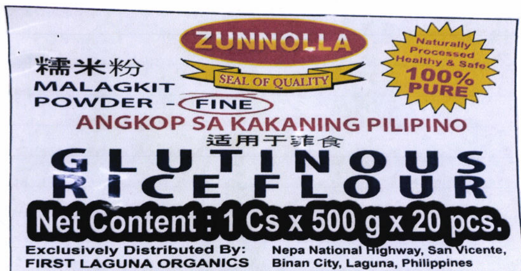
Figure 11. Unregistered Zunnolla Glutinous Rice Flour