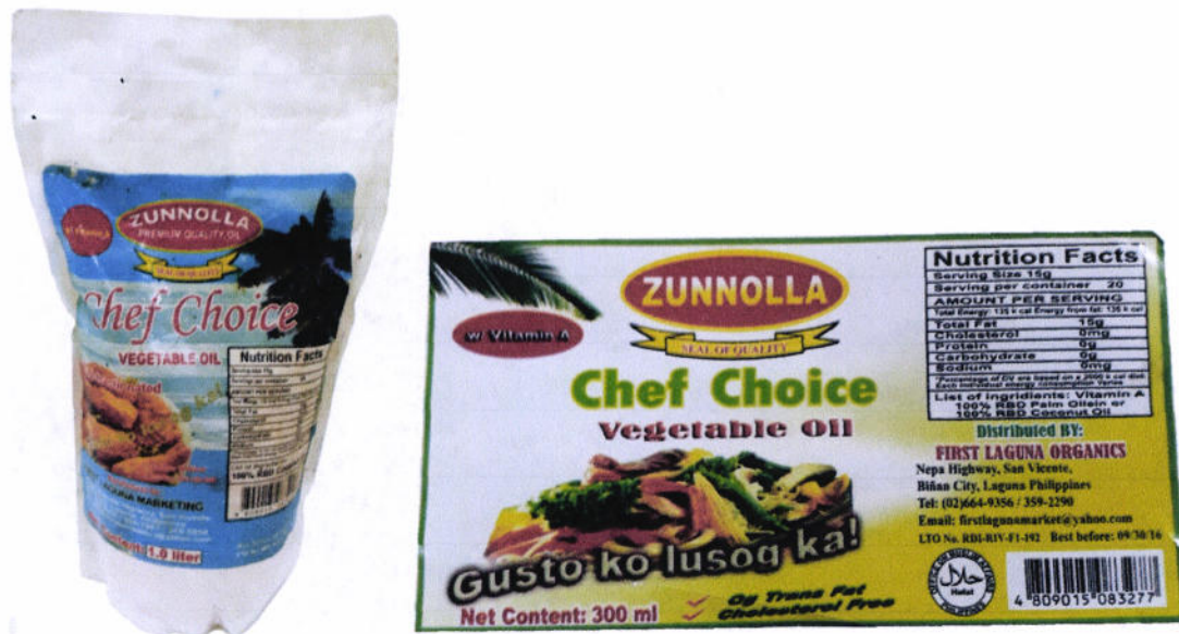
Figure 9. Unregistered Zunnolla Chef Choice Vegetable Oil