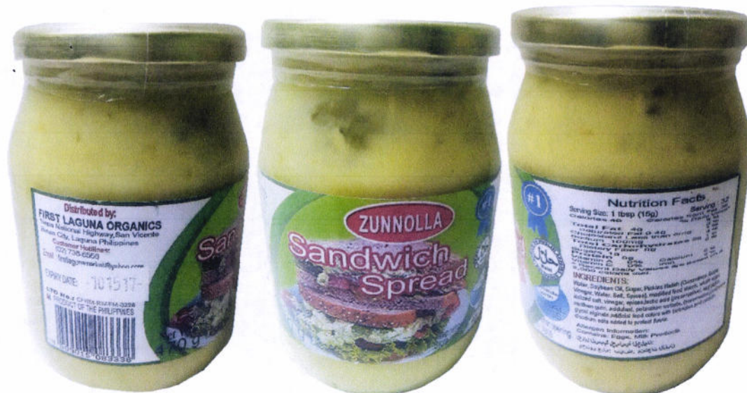
Figure 7. Unregistered Zunnolla Sandwich Spread