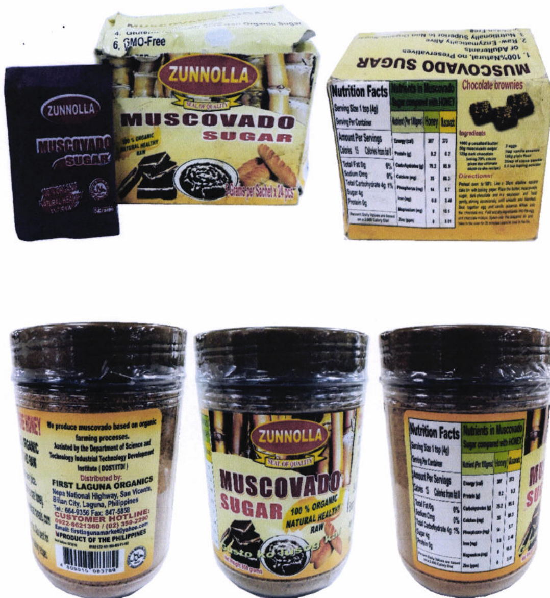
Figure 13. Unregistered Zunnolla Muscovado Sugar 100 % Organic Natural Healthy and RAW