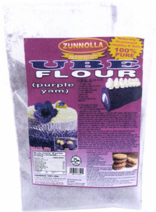
Figure 14. Unregistered Zunnolla Ube Flour