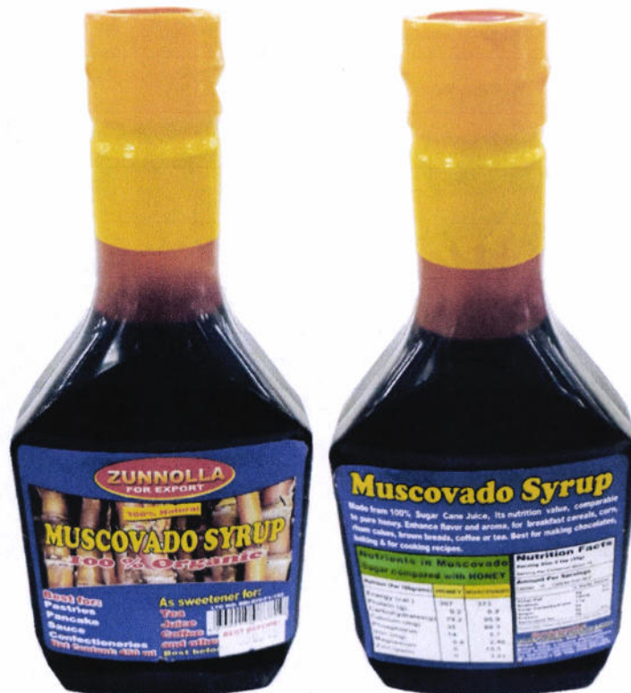
Figure 15. Unregistered Zunnolla For Export Muscovado Syrup 100% Organic