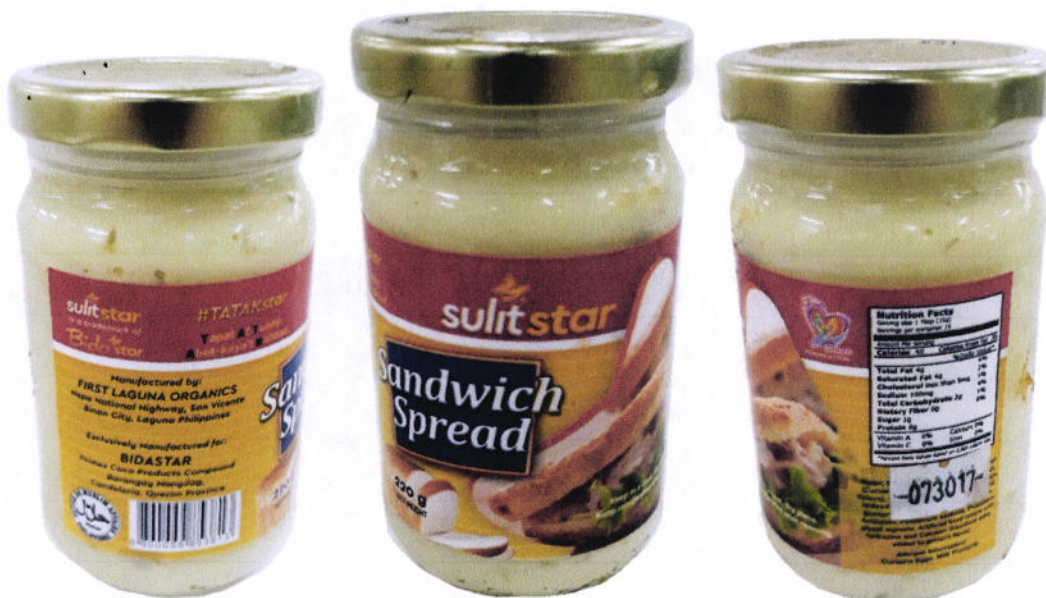
Figure 16. Unregistered Sulit Star Sandwich Spread