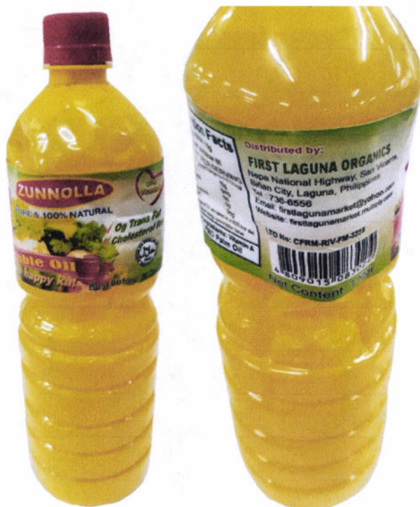
Figure 18. Unregistered Zunnolla Pure & 100% Natural Vegetable Oil

All Local Government Units and Law Enforcement Agencies are requested to ensure that these products are not sold or made available in their localities or areas of jurisdiction.