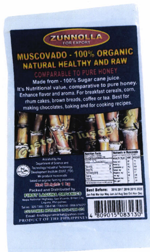
Figure 12. Unregistered Zunnolla For Export Muscovado – 100% Organic Natural Healthy and Raw