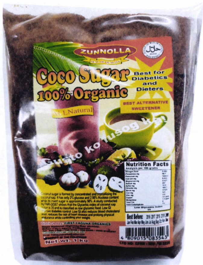
Figure 10. Unregistered Zunnolla Coco Sugar 100% Organic All Natural