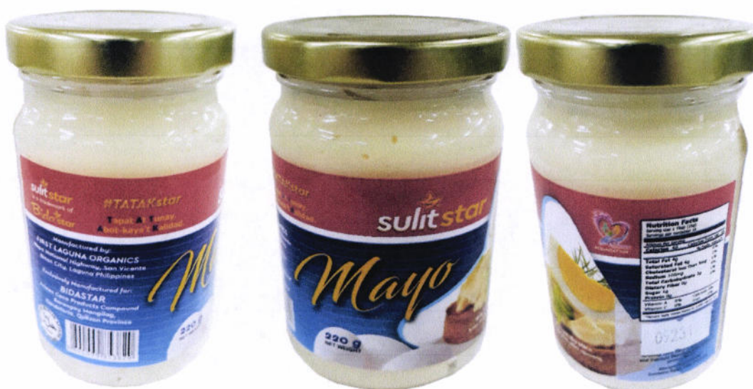
Figure 17. Unregistered Sulit Star Mayo