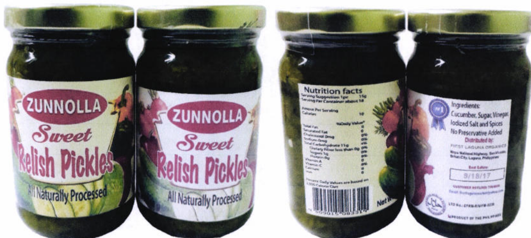
Figure 6. Unregistered Zunnolla Sweet Relish Pickles