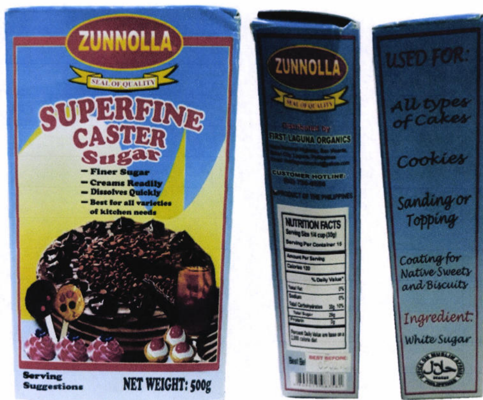
Figure 8. Unregistered Zunnolla Superfine Caster Sugar