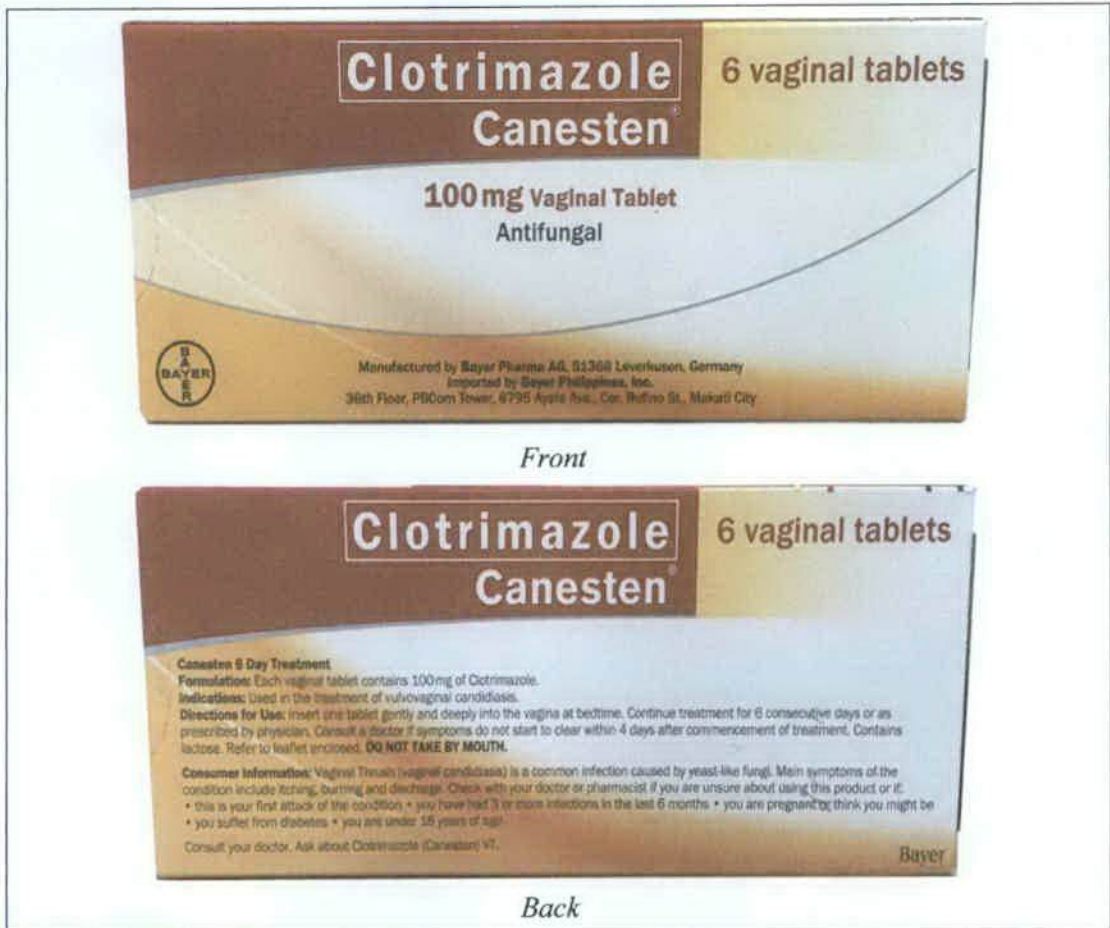
Figure 2. Secondary packaging of the registered Clotrimazole (Canesten) 100 mg Vaginal Tablet (Registration Number: DR-XY32759)