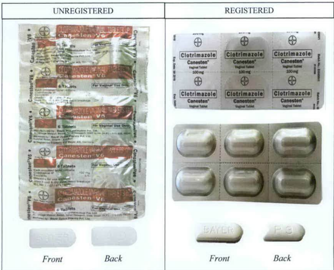
Figure 3. Comparison of the blister packs and tablets of the unregistered and registered drug product