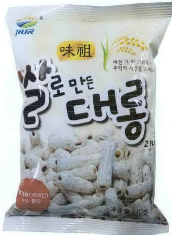
Figure 7. Jiur