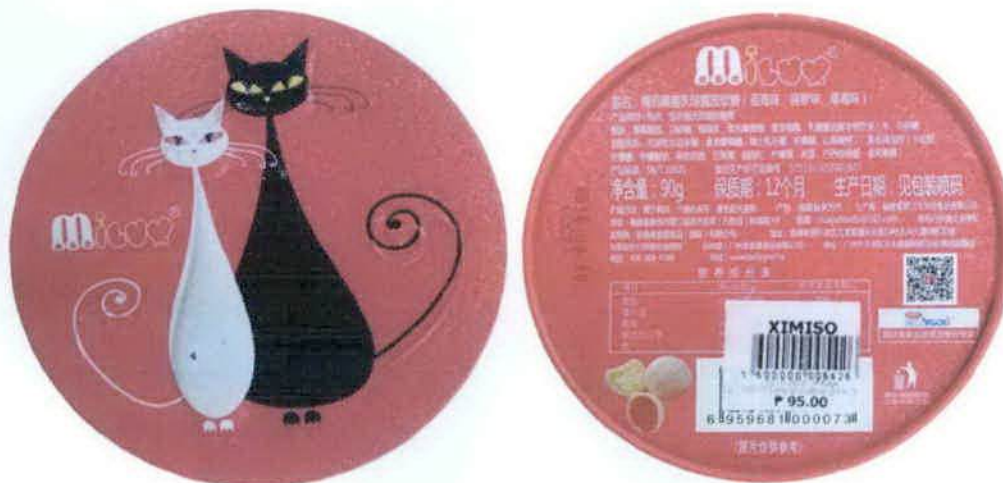
Figure 4. Milux