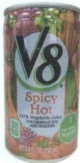
Figure 1. V8 Spicy Hot 100% Vegetable Juice

The Food and Drug Administration (FDA) advises the public against the purchase and consumption of the following unregistered food products and food supplement: