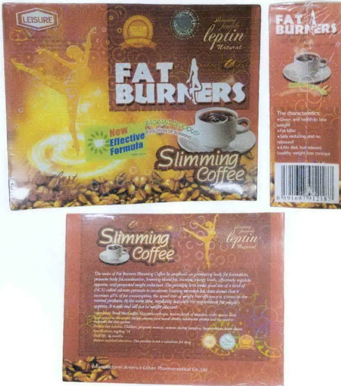
Figure 10. Leisure Fat Burners Slimming Coffee