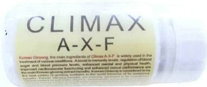
Figure 9. Climax A-X-F