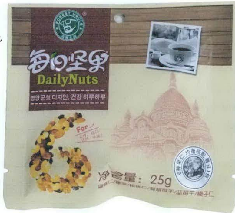
Figure 5. Forest Uncle Daily Nuts