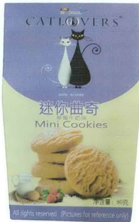
Figure 6. Bellygood Catlovers Mini Cookies