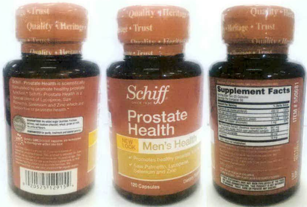
Figure 9. Unregistered Schiff Prostate Health