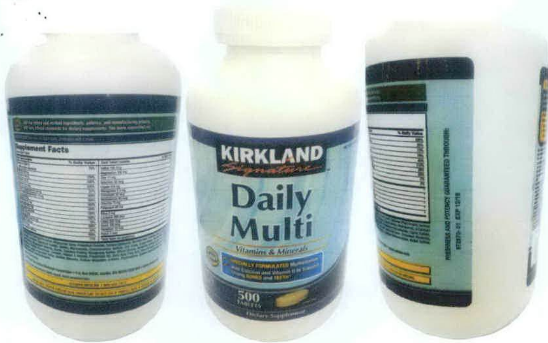
Figure 10. Unregistered Kirkland Signature Daily Multi Vitamins & Minerals