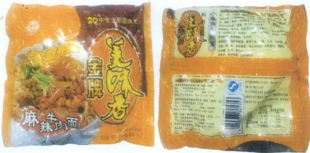
Figure 6. Unregistered Noodles (In Chinese Characters) Orange