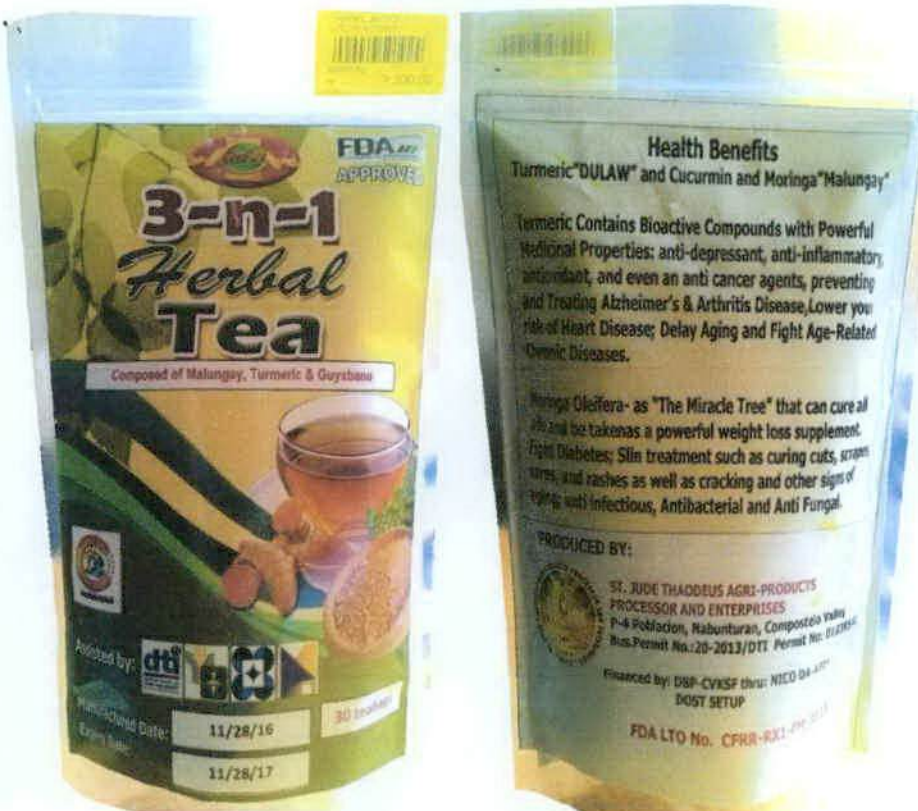
Figure 2. Unregistered JohnPaul 3-n-1 Herbal Tea Composed of Malunggay, Turmeric & Guyabano