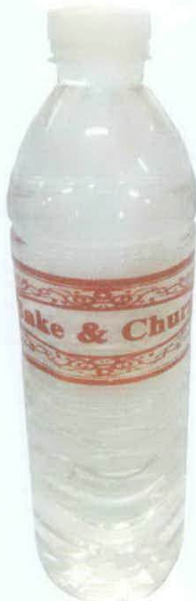
Figure 11. Unregistered Bake & Churn Bottled Water