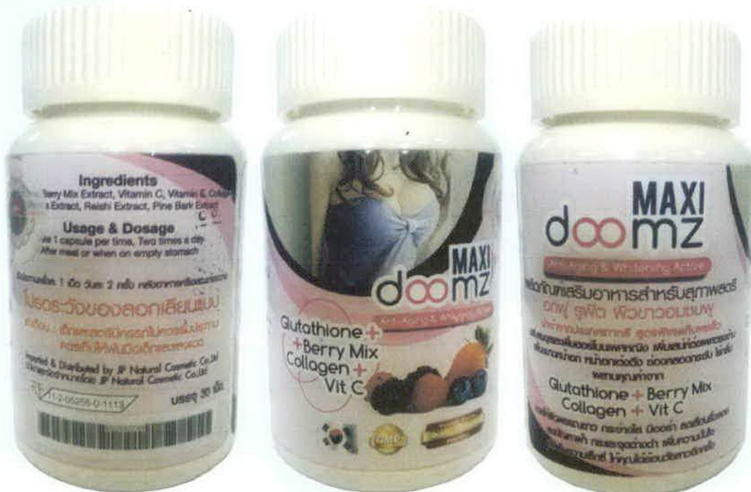
Figure 1. Unregistered Maxi doomz Anti-Aging & Whitening Active

The Food and Drug Administration (FDA) advises the public against the purchase and consumption of the following unregistered food products and food supplements: