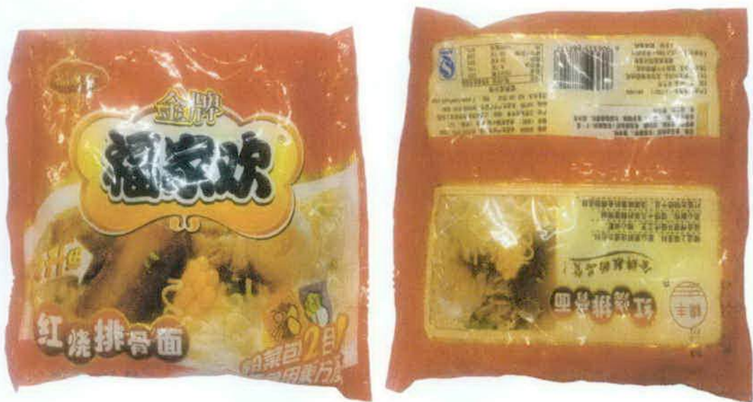
Figure 7. Unregistered Noodles (In Chinese Characters) Red