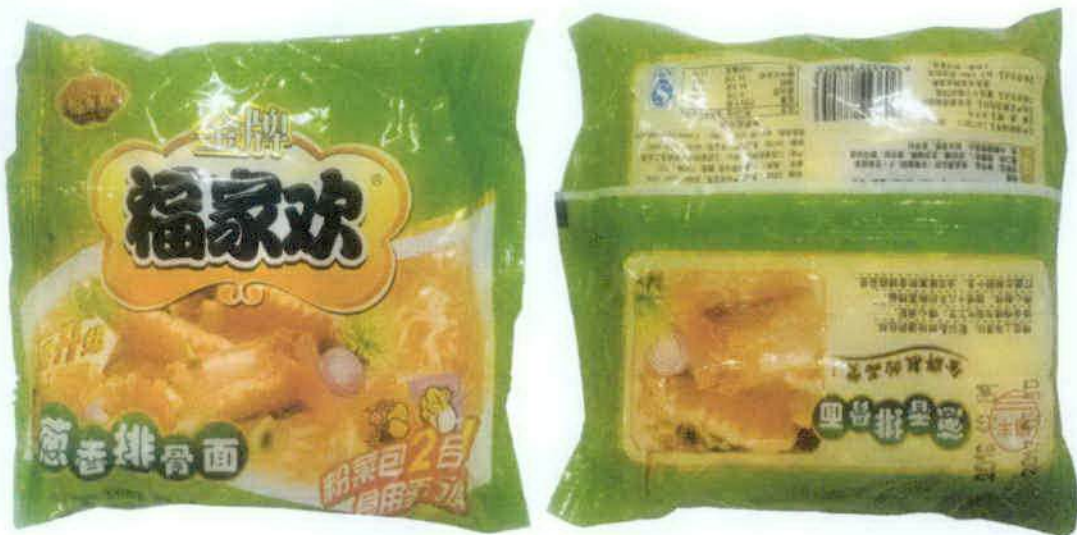
Figure 5. Unregistered Noodles (In Chinese Characters) Green