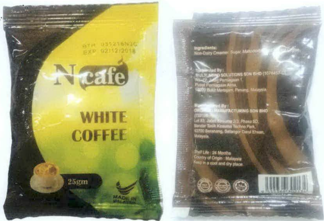
Figure 4. Unregistered N Café White Coffee