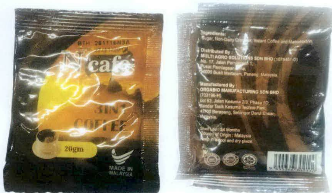
Figure 3. Unregistered N Café 3in1 Coffee