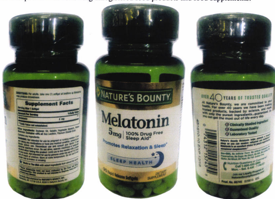
Figure 1. Unregistered Nature's Bounty Melatonin 5mg

The Food and Drug Administration (FDA) advises the public against the purchase and consumption of the following unregistered food products and food supplements: