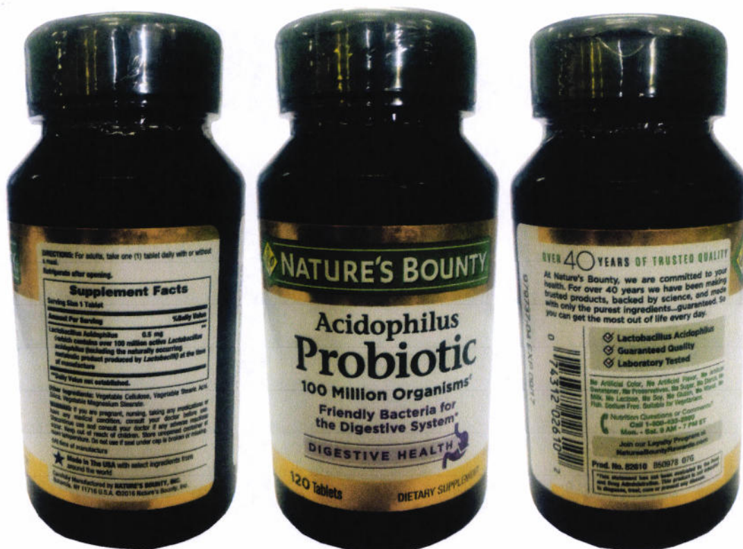
Figure 2. Unregistered Nature's Bounty Acidophilus Probiotic