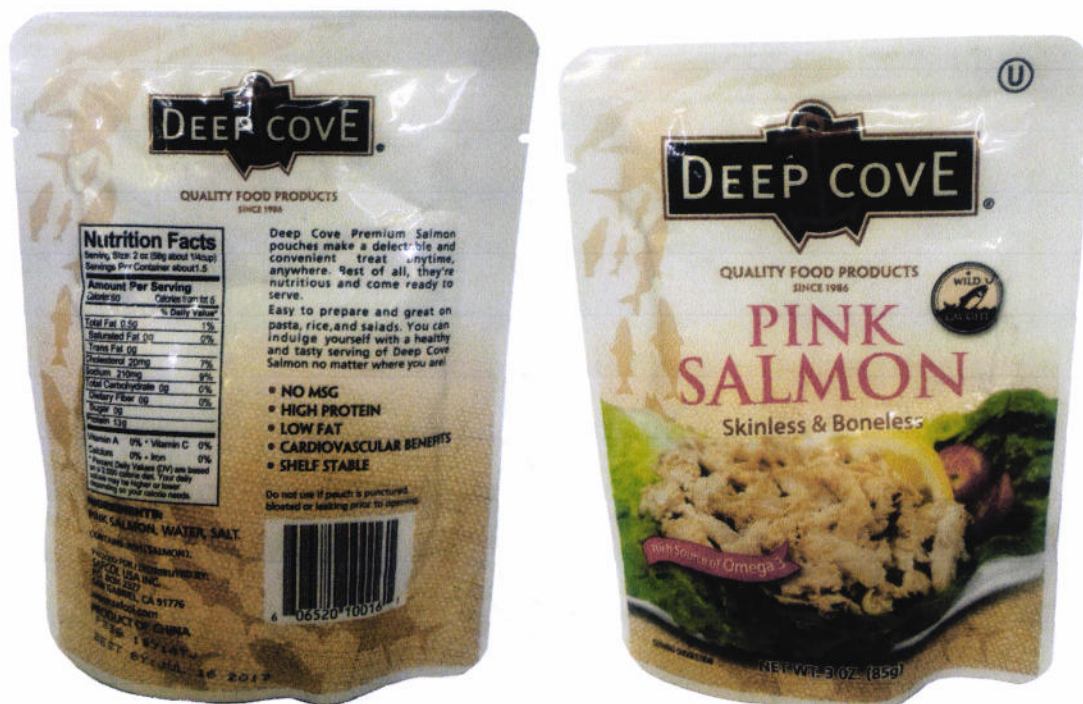
Figure 9. Unregistered Deep Cove Pink Salmon Skinless & Boneless