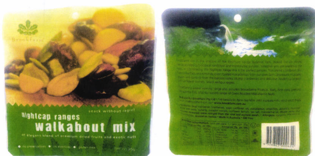
Figure 7. Unregistered Brookfarm Nightcap Ranges Walkabout Mix