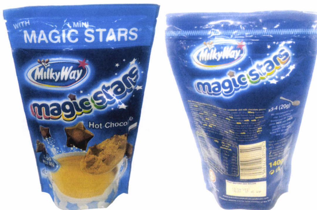
Figure 6. Unregistered Milky Way Magic Stars Hot Chocolate