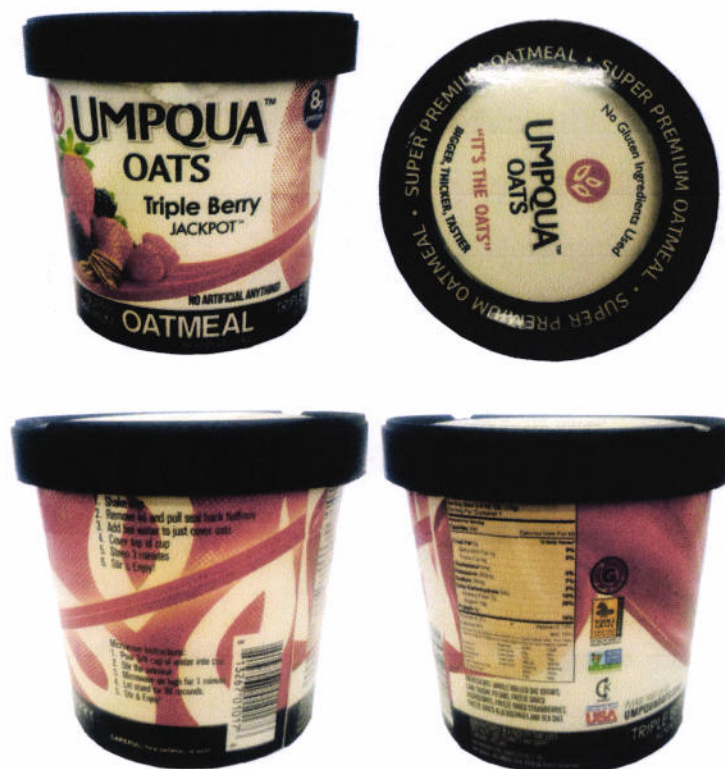
Figure 5. Unregistered Umpqua Oats Triple Berry Jackpot