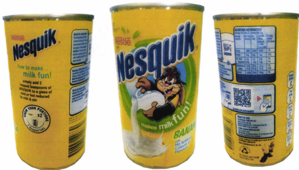
Figure 4. Unregistered Nestle Nesquik Banana