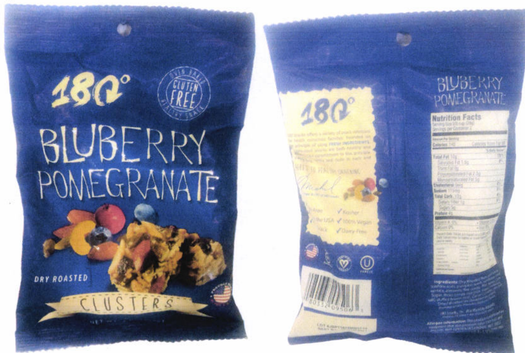
Figure 8. Unregistered 180 Blueberry Pomegranate dry Roasted Clusters

FDA post-marketing surveillance (PMS) activities have verified that the abovementioned food products and food supplements have not gone through the registration process of the agency and have not been issued the proper authorization in the form of Certificate of Product Registration. Pursuant to Republic Act No. 9711, otherwise known as the “Food and Drug Administration Act of 2009”, the manufacture, importation, exportation, sale, offering for sale, distribution, transfer, non-consumer use, promotion, advertising or sponsorship of health products without the proper authorization from FDA is prohibited.