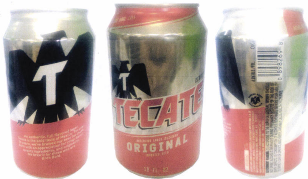
Figure 6. Unregistered Cerveza Tecate Original Imported Beer