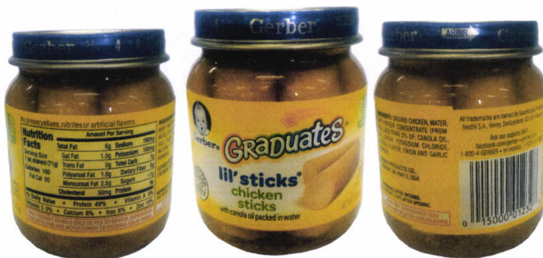
Figure 3. Unregistered Gerber Graduates Lil' Sticks Chicken Sticks