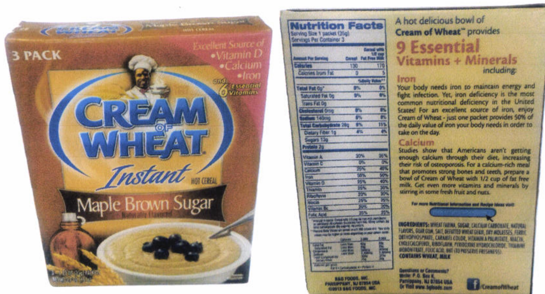
Figure 1. Unregistered Cream of Wheat Instant Maple Brown Sugar

The Food and Drug Administration (FDA) advises the public against the purchase and consumption of the following unregistered food products and food supplements: