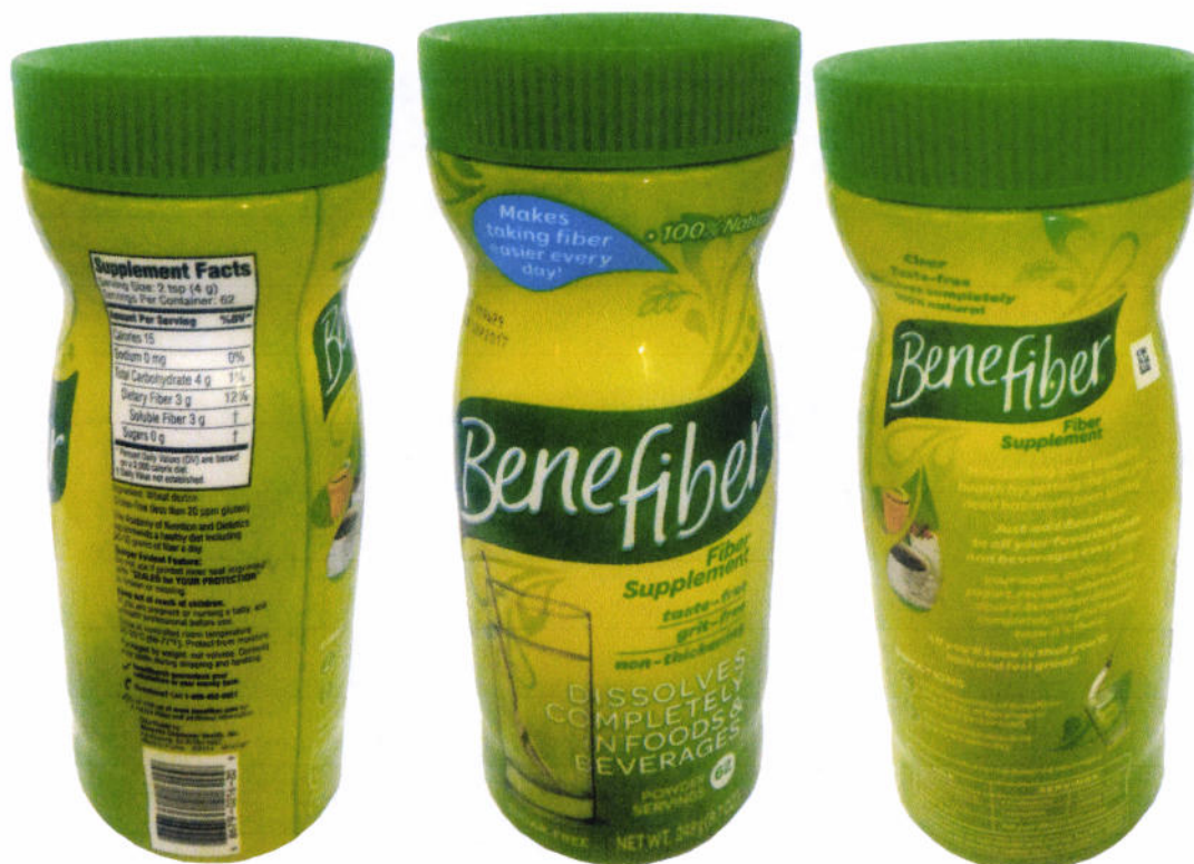
Figure 5. Unregistered Benefiber Fiber Supplement