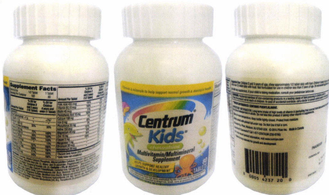
Figure 4. Unregistered Centrum Kids Chewables Multivitamin/ Multimineral