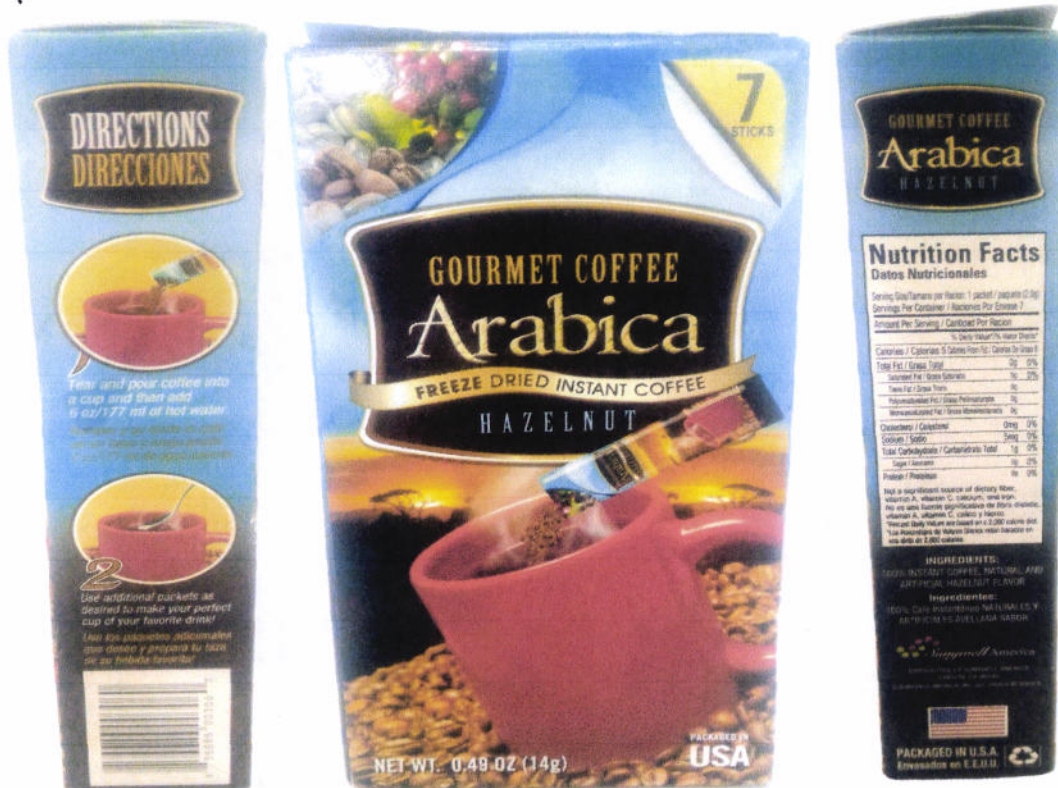
Figure 2. Unregistered Gourmet Coffee Arabica Freeze Dried Instant Coffee Hazelnut