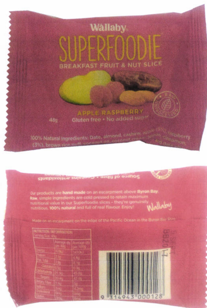
Figure 7. Unregistered Wallaby Superfoodie Breakfast Fruit & Nut Slice Apple Raspberry