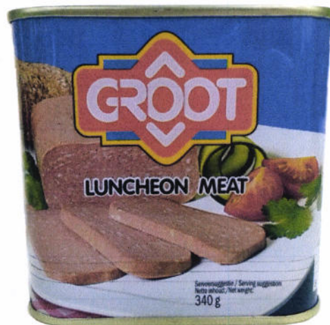
Figure 3. Unregistered Groot Luncheon Meat