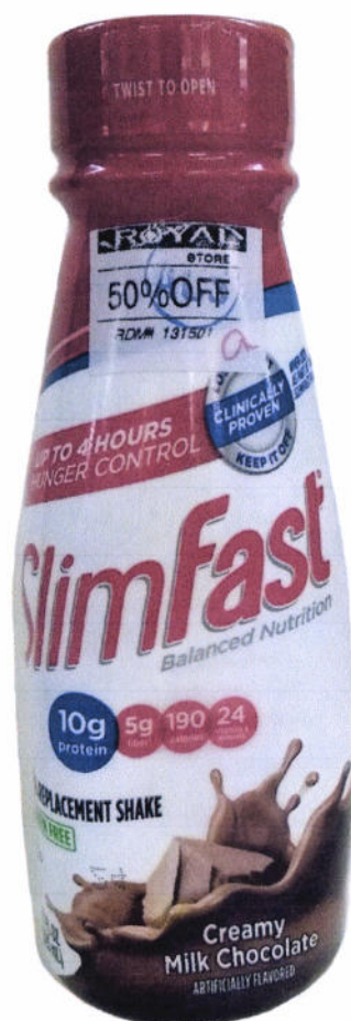
Figure 8. Unregistered Slimfast Balanced Nutrition Creamy Milk Chocolate Artificially Flavored Gluten Free Meal Replacement Shake