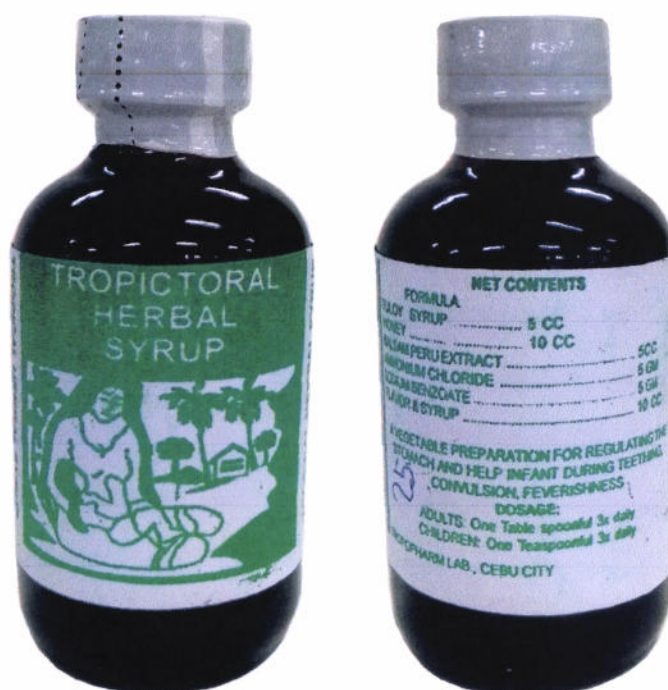
Figure 1. Unregistered Tropictoral Herbal Syrup

The Food and Drug Administration (FDA) advises the public against the purchase and consumption of the following unregistered food products and food supplement: