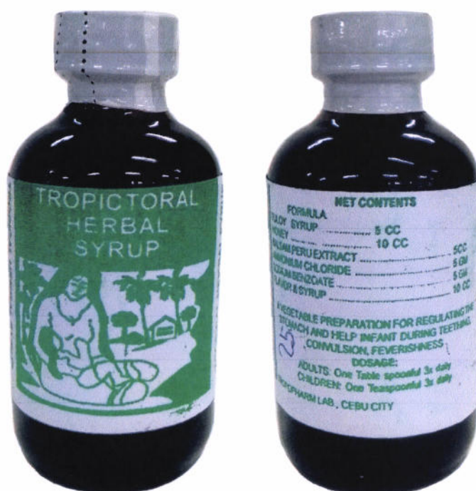
Figure 1. Unregistered Tropicitorial Herbal Syrup

The Food and Drug Administration (FDA) advises the public against the purchase and consumption of the following unregistered food products and food supplement: