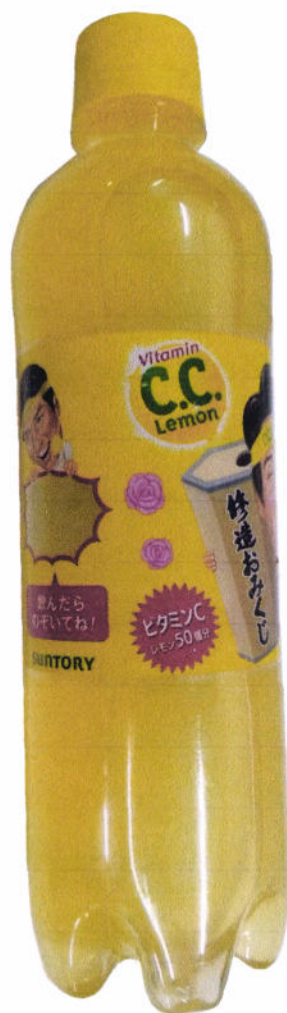
Figure 10. Unregistered Suntory Vitamin C.C. Lemon

FDA post-marketing surveillance (PMS) activities have verified that the abovementioned food products have not gone through the registration process of the agency and have not been issued the proper authorization in the form of Certificate of Product Registration. Pursuant to Republic Act No. 9711, otherwise known as the “Food and Drug Administration Act of 2009”, the manufacture, importation, exportation, sale, offering for sale, distribution, transfer, non-consumer use, promotion, advertising or sponsorship of health products without the proper authorization from FDA is prohibited.