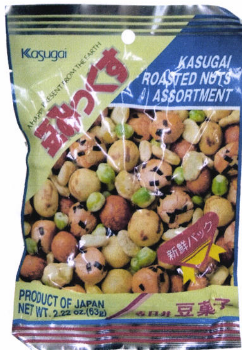
Figure 9. Unregistered Kasugai Roasted Nuts Assortment