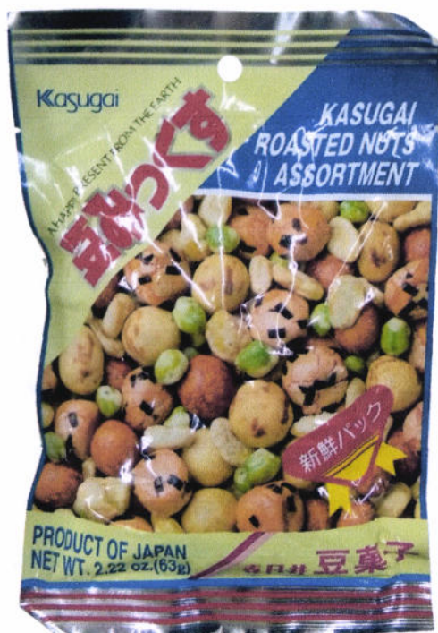
Figure 9. Unregistered Kasugai Roasted Nuts Assortment