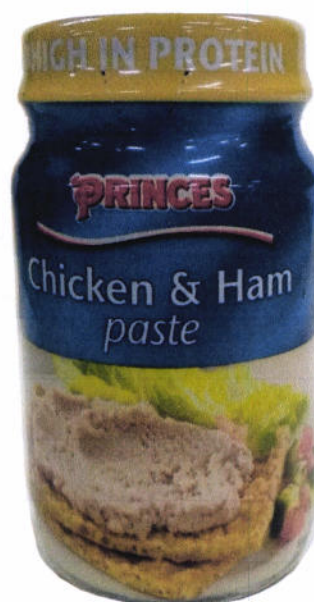
Figure 4. Unregistered Princes Chicken & Ham Paste High in Protein