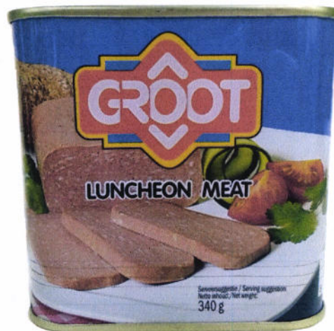
Figure 3. Unregistered Groot Luncheon Meat