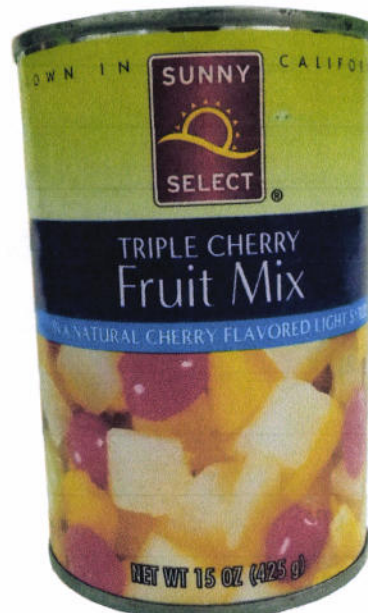
Figure 7. Unregistered Sunny Select Triple Cherry Fruit Mix in a Natural Cherry Flavored Light Syrup