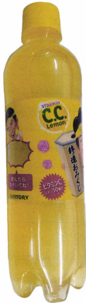
Figure 10. Unregistered Suntory Vitamin C.C. Lemon

FDA post-marketing surveillance (PMS) activities have verified that the abovementioned food products have not gone through the registration process of the agency and have not been issued the proper authorization in the form of Certificate of Product Registration. Pursuant to Republic Act No. 9711, otherwise known as the “Food and Drug Administration Act of 2009”, the manufacture, importation, exportation, sale, offering for sale, distribution, transfer, non-consumer use, promotion, advertising or sponsorship of health products without the proper authorization from FDA is prohibited.