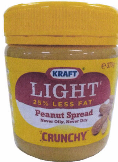
Figure 6. Unregistered Kraft Light 25% Less Fat Peanut Spread Never Oily Never Dry Crunchy