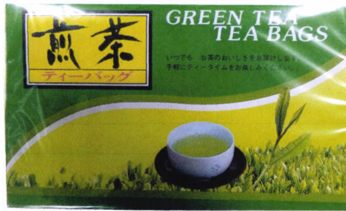
Figure 2. Unregistered Taguchi-En Green Tea Bags