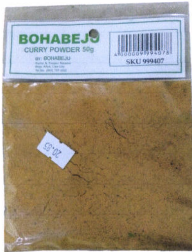
Figure 2. Bohabeju Curry Powder