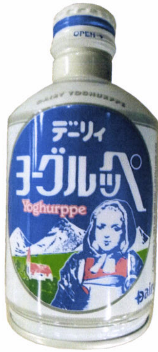
Figure 8. Dairy Yoghurppe