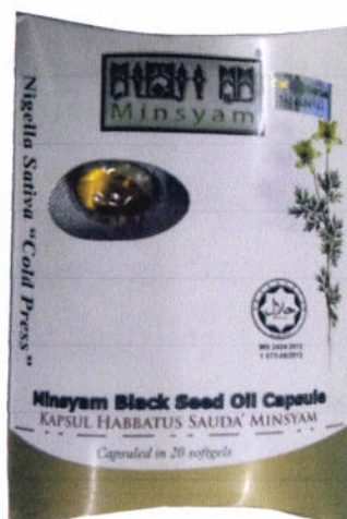
Figure 10. Minsyam Black Seed Oil Capsule

FDA post-marketing surveillance (PMS) activities have verified that the abovementioned food products have not gone through the registration process of the agency and have not been issued the proper authorization in the form of Certificate of Product Registration. Pursuant to Republic Act No. 9711, otherwise known as the “Food and Drug Administration Act of 2009”, the manufacture, importation, exportation, sale, offering for sale, distribution, transfer, non-consumer use, promotion, advertising or sponsorship of health products without the proper authorization from FDA is prohibited.