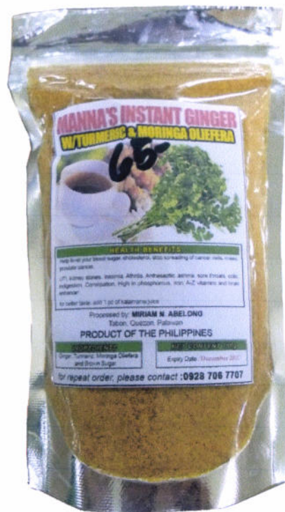
Figure 1. Manna's Instant Ginger w/ Turmeric & Moringa Oleifera

The Food and Drug Administration (FDA) advises the public against the purchase and consumption of the following unregistered food products food supplements: