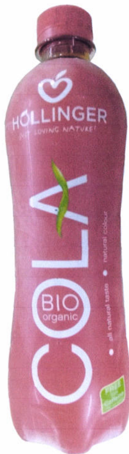
Figure 9. Hollinger Bio-Organic Cola