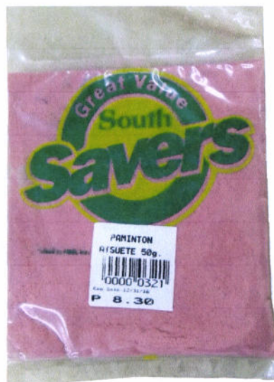
Figure 4. Great Value South Savers Paminton Atsuete