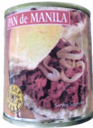
Figure 5. Pan de Manila Corned Beef Sautéed Onion and Garlic