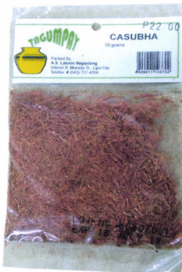
Figure 3. Tagumpay Casubha Bohabeju Curry Powder