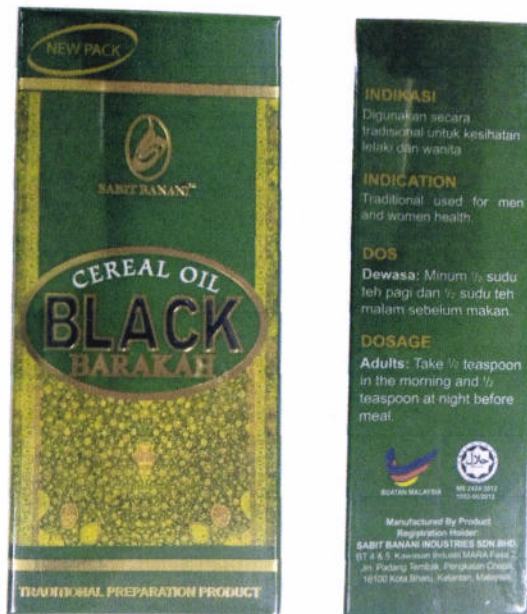
Figure 6. Sabit Banani Cereal Oil Black Barakah