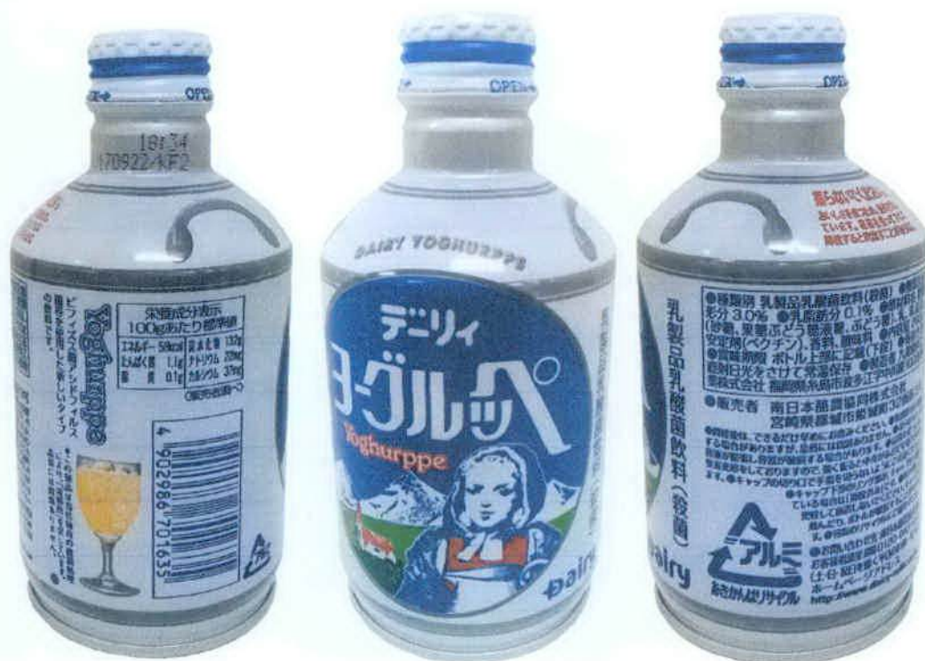
Figure 2. Unregistered Dairy Yoghurppe