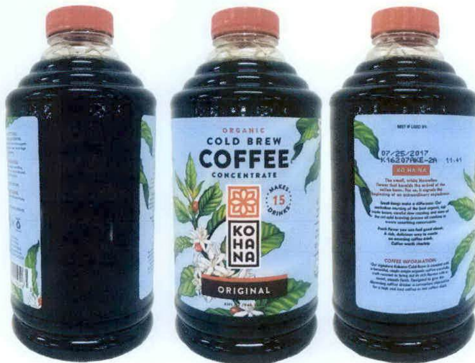
Figure 9. Unregistered Kohana Organic Cold Brew Coffee Concentrate Original