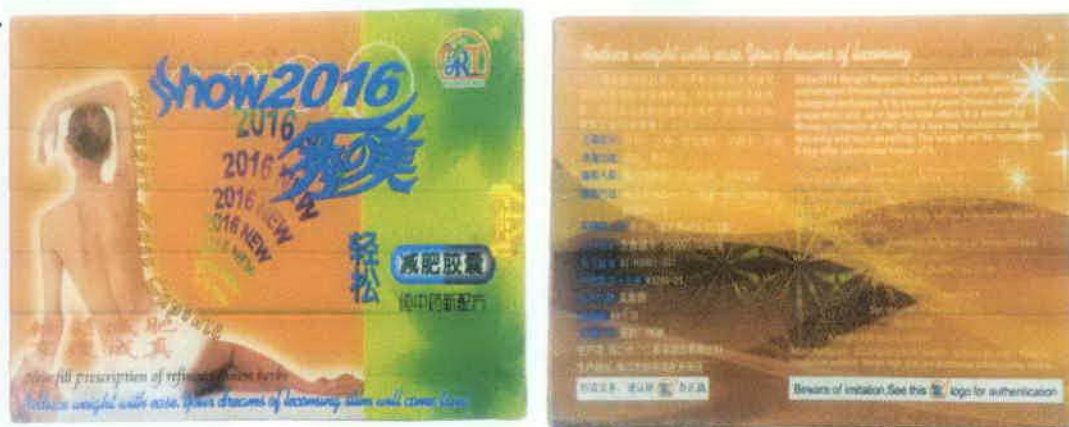
Figure 12. Unregistered Show2016 Weight Loss Capsules