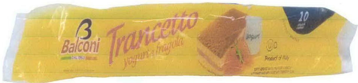
Figure 1. Unregistered Balconi Trancetto Yogurt e Fragola

The Food and Drug Administration (FDA) advises the public against the purchase and consumption of the following unregistered food products and food supplements: