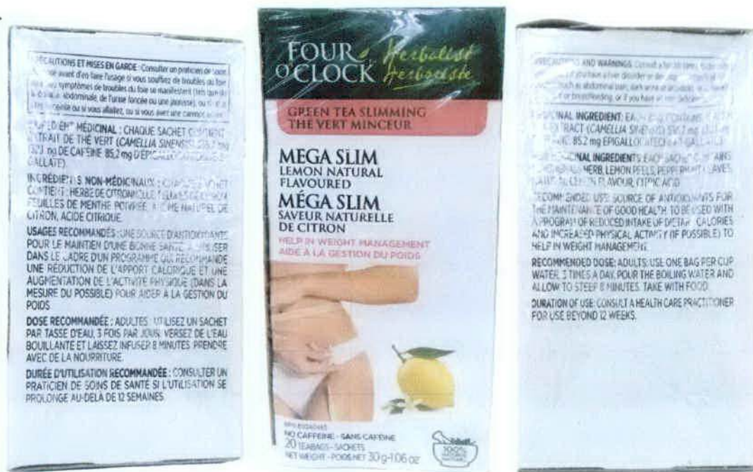
Figure 4. Unregistered Four O' Clock Herbalist Green Tea Slimming MEGA SLIM Lemon Natural Flavoured