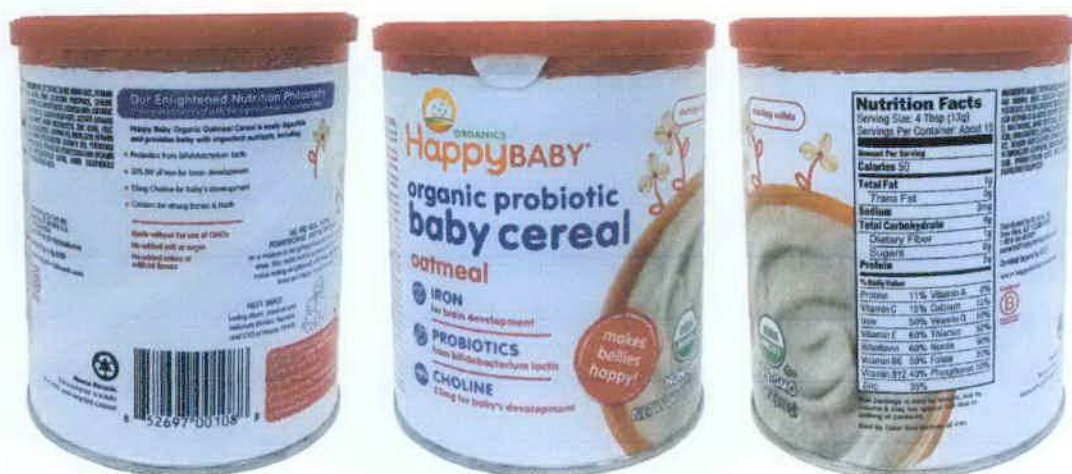
Figure 10. Unregistered Organics Happybaby Organic Probiotic Baby Cereal Oatmeal