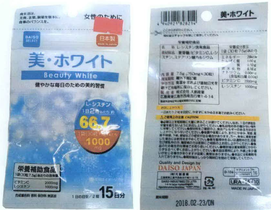
Figure 3. Unregistered Daiso Select Beauty White