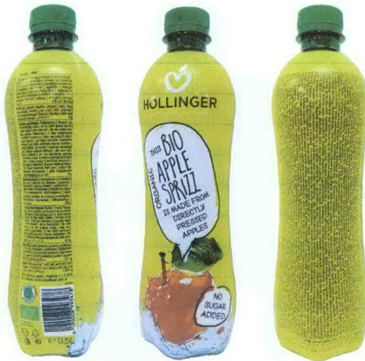
Figure 6. Unregistered Hollinger Bio Apple Sprizz Directly Pressed Apples