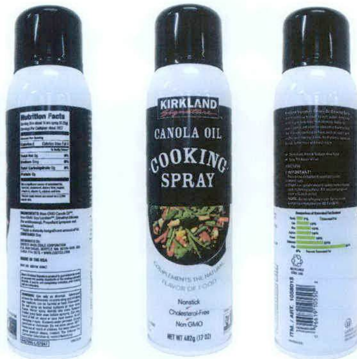
Figure 8. Unregistered KIRKLAND Signature Canola Oil Cooking Spray