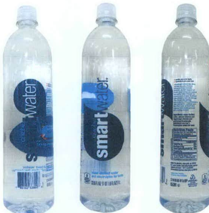
Figure 5. Unregistered Glaceau Smart Water Vapor Distilled Water and Electrolytes for Taste