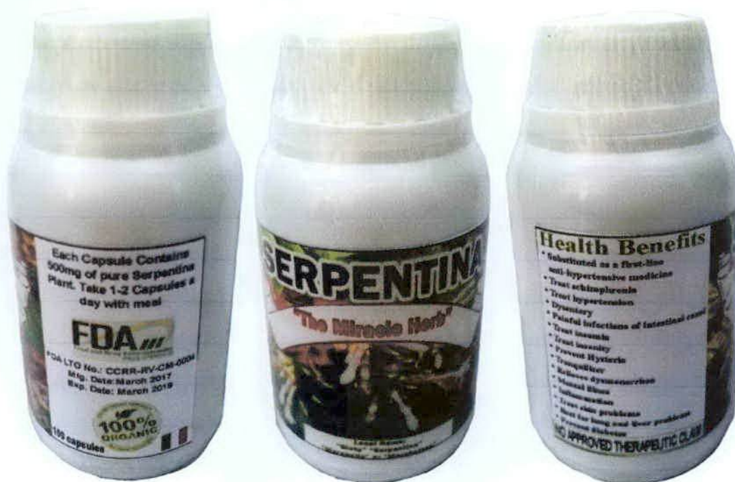
Figure 11. Unregistered Serpentina Miracle Herb