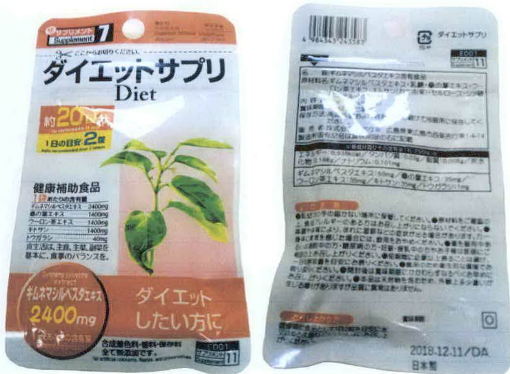
Figure 7. Unregistered Diet Supplement Gymnema Sylvestre Extract