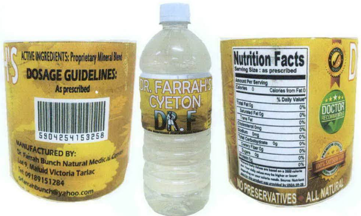
Figure 3. Unregistered DR. FARRAH'S CYETON