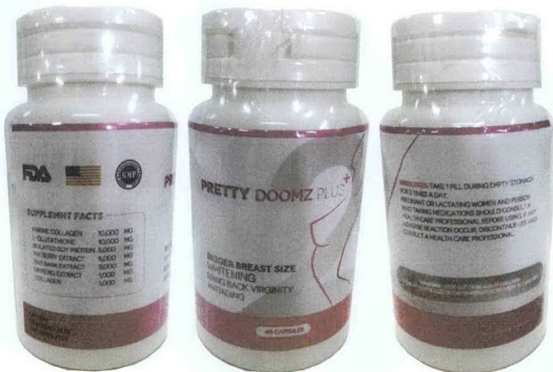
Figure 3. Unregistered Pretty Doomz Plus

FDA post-marketing surveillance (PMS) activities have verified that the abovementioned food supplements have not gone through the registration process of the agency and have not been issued the proper authorization in the form of Certificate of Product Registration. Pursuant to Republic Act No. 9711, otherwise known as the "Food and Drug Administration Act of 2009", the manufacture, importation, exportation, sale, offering for sale, distribution, transfer, non-consumer use, promotion, advertising or sponsorship of health products without the proper authorization from FDA is prohibited.