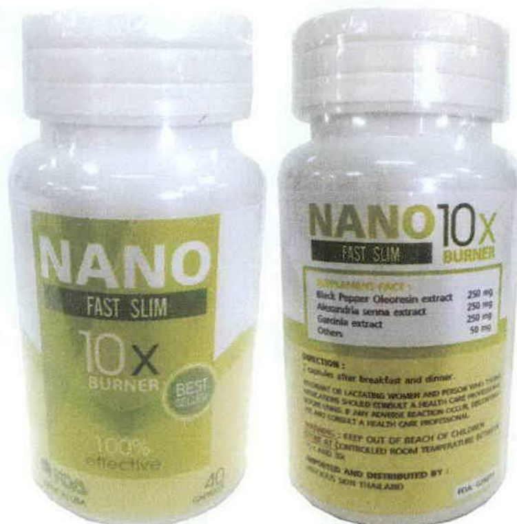
Figure 2. Unregistered Nano Fast Slim 10x Burner