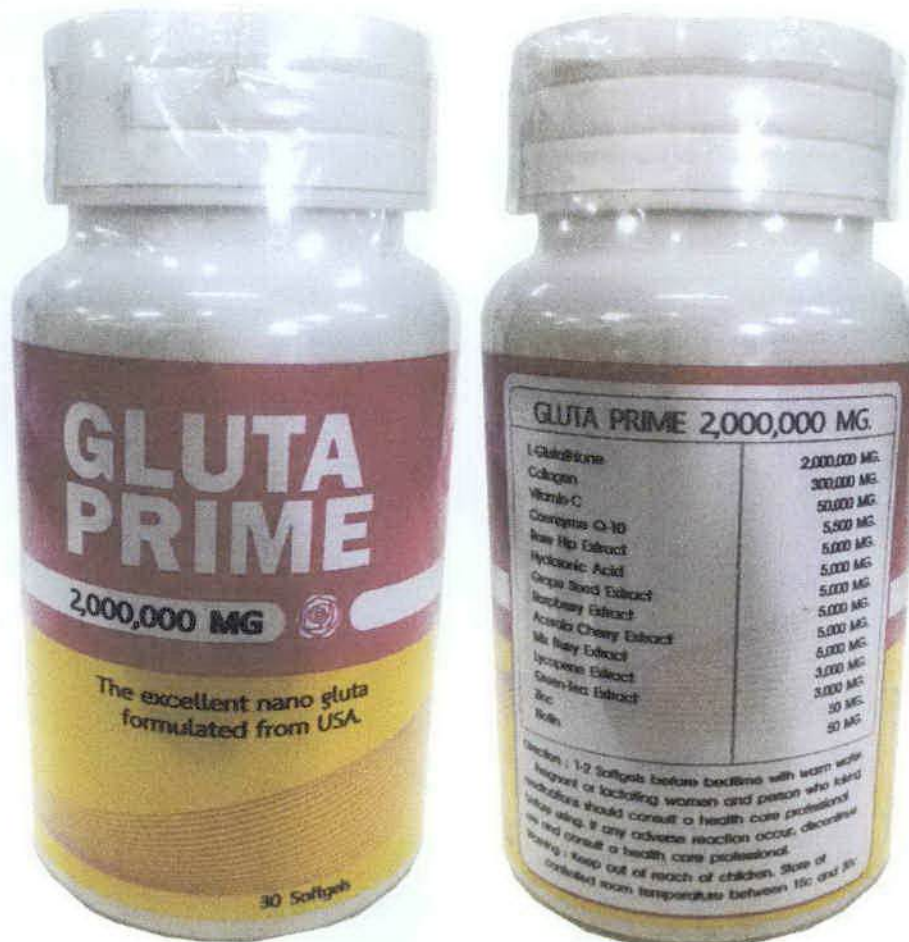
Figure 1. Unregistered Gluta Prime 2,000,000 mg

The Food and Drug Administration (FDA) advises the public against the purchase and consumption of the following unregistered supplements: