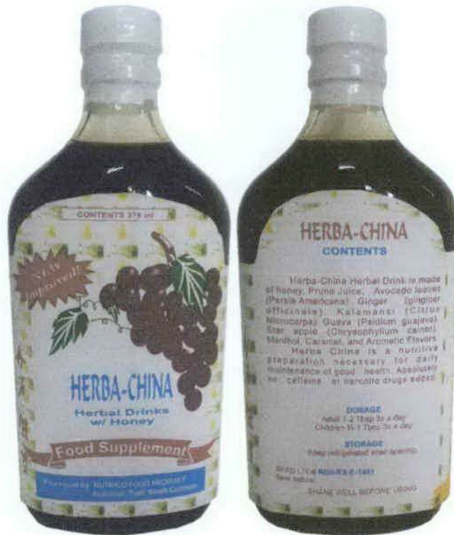
Figure 2. Unregistered Herba-China Herbal Drinks w/ Honey