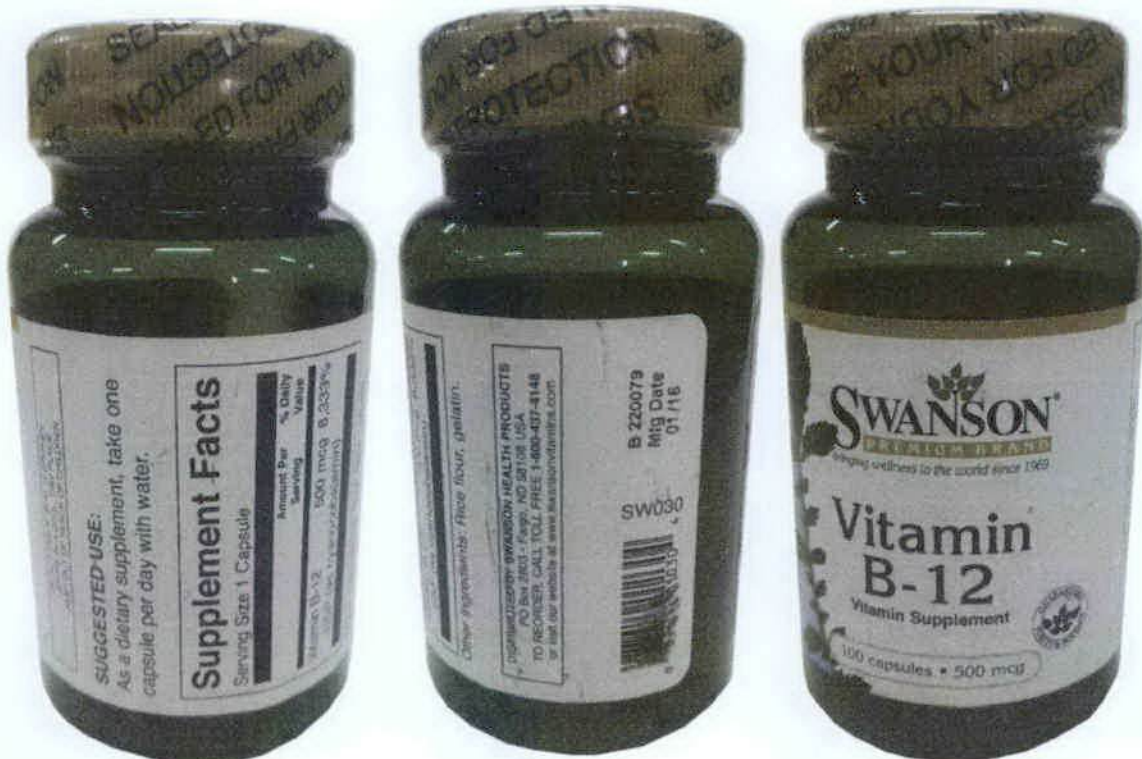
Figure 3. Unregistered Swanson Premium Brand Vitamin B-12 Vitamin Supplement

FDA post-marketing surveillance (PMS) activities have verified that the abovementioned food products and food supplement have not gone through the registration process of the agency and have not been issued the proper authorization in the form of Certificate of Product Registration. Pursuant to Republic Act No. 9711, otherwise known as the "Food and Drug Administration Act of 2009", the manufacture, importation, exportation, sale, offering