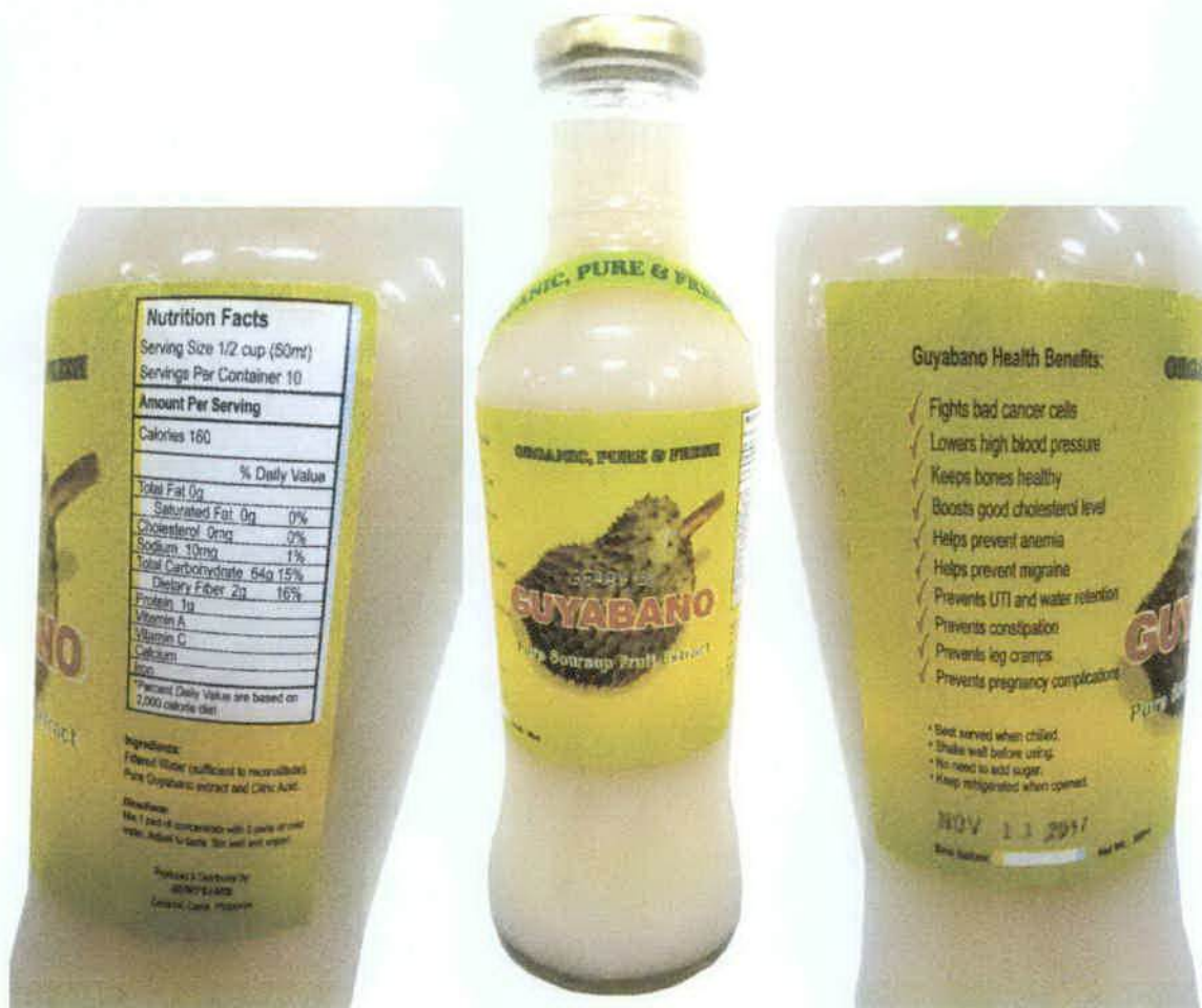
Figure 1. Unregistered Gerry's Guyabano Pure Soursop Fruit Extract

The Food and Drug Administration (FDA) advises the public against the purchase and consumption of the following unregistered food products and food supplement: