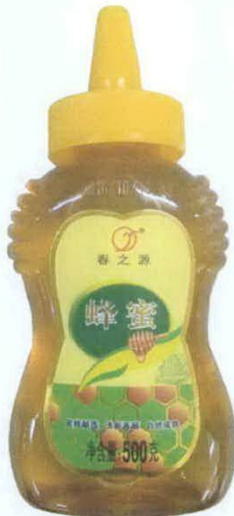
Figure 6. Honey Syrup (in foreign character)