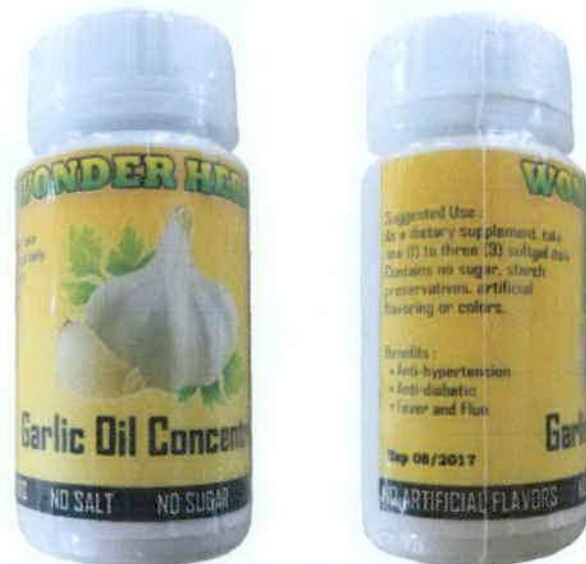
Figure 3. Wonder Herbs Garlic Oil Concentrate