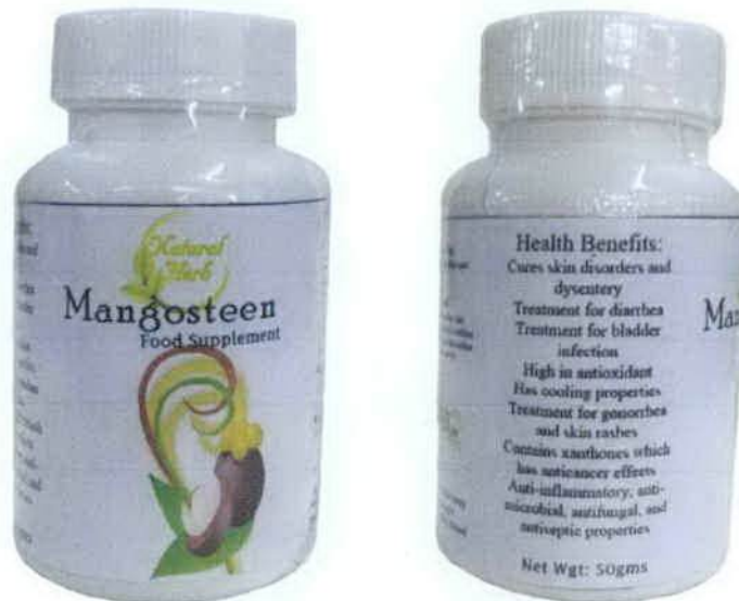
Figure 10. Natural Herb Mangosteen Food Supplement

FDA post-marketing surveillance (PMS) activities have verified that the abovementioned food products have not gone through the registration process of the agency and have not been issued the proper authorization in the form of Certificate of Product Registration. Pursuant to Republic Act No. 9711, otherwise known as the "Food and Drug Administration Act of