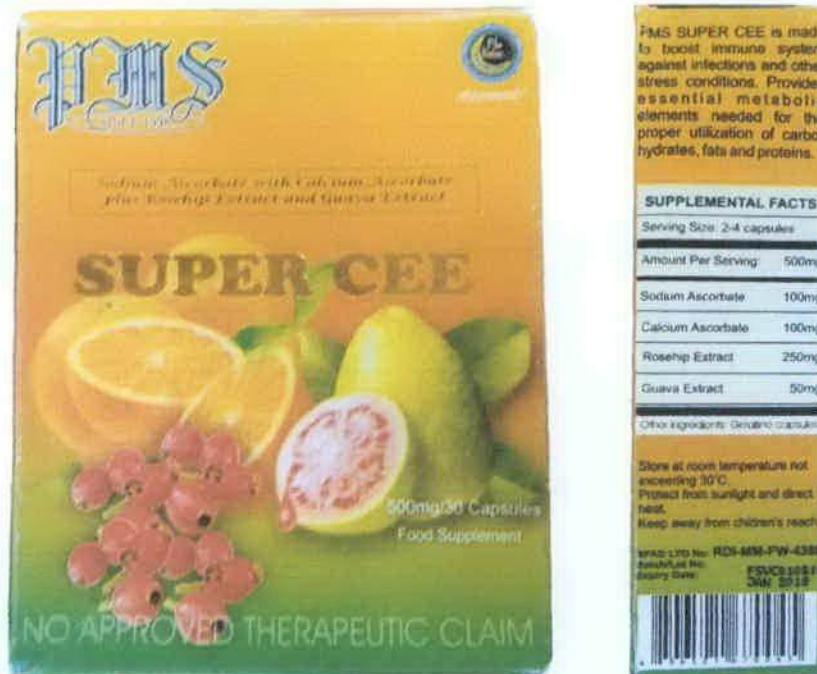
Figure 1. PMS Super Cee Sodium Ascorbate with Calcium Ascorbate plus Rosehip Extract and Guava Extract

The Food and Drug Administration (FDA) advises the public against the purchase and consumption of the following unregistered food products food supplements: