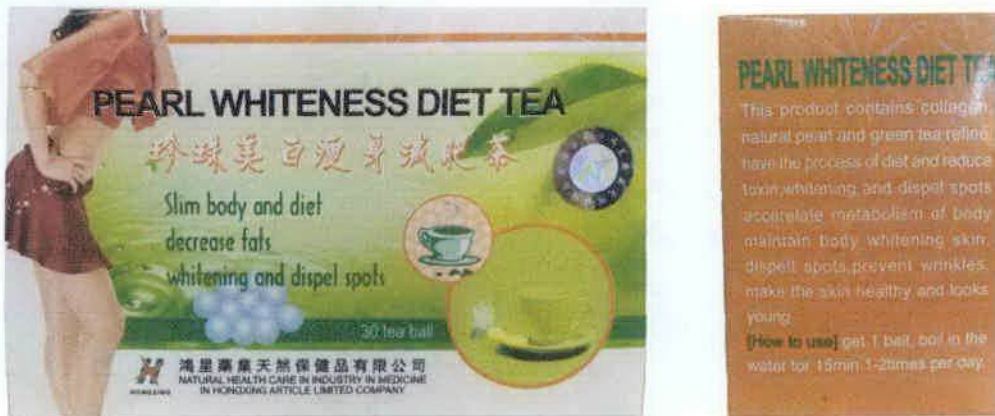
Figure 9. Pearl Whiteness Diet Tea