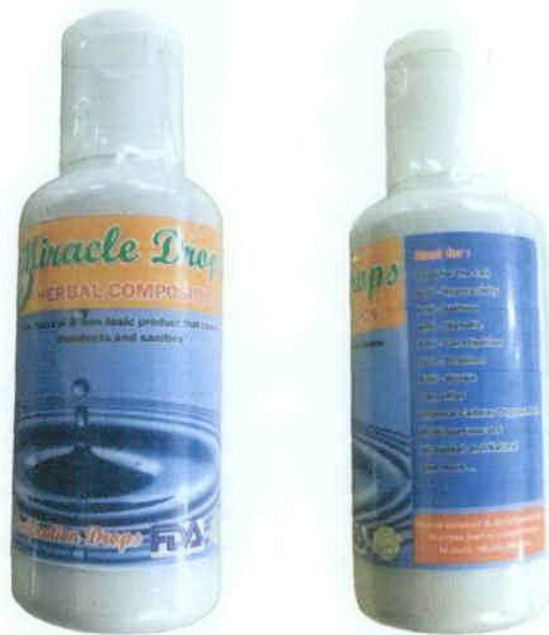
Figure 5. Herbs-Solution-By-Nature Miracle Drops Herbal Composition