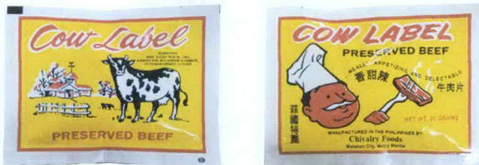
Figure 7. Cow Label Preserved Beef