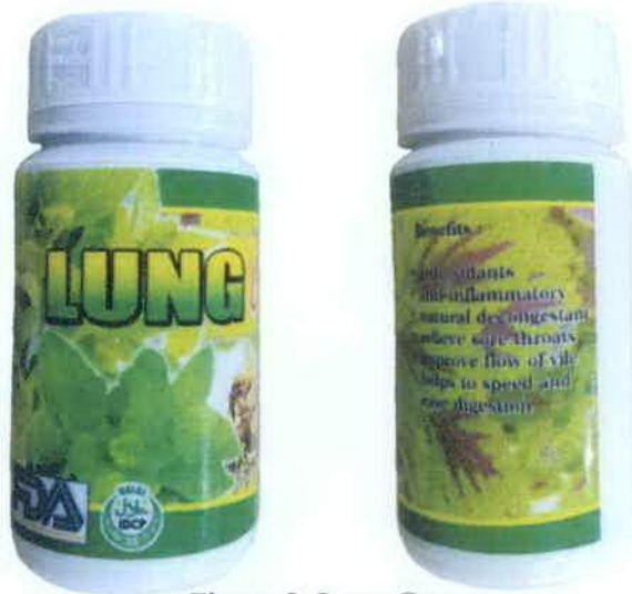
Figure 2. Lung Cure