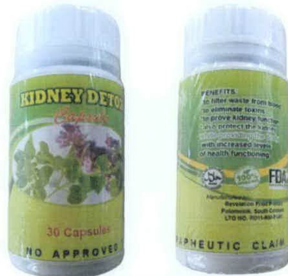
Figure 4. Kidney Detox Capsule