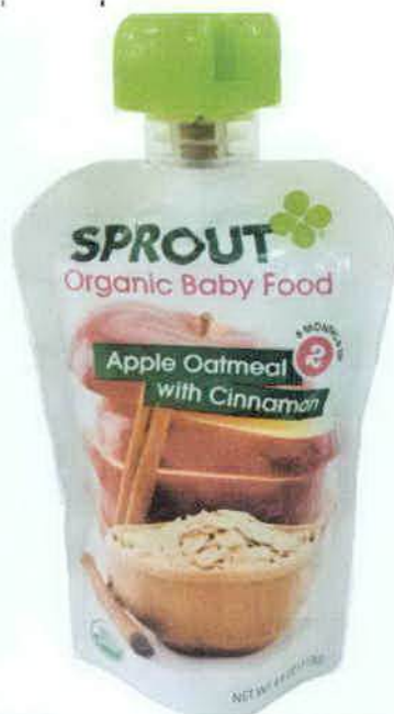
Figure 3. Unregistered Sprout Organic Baby Food Apple Oatmeal with Cinnamon