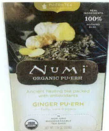
Figure 4. Unregistered NUMI Organic Pu-erh GINGER PU.ERH