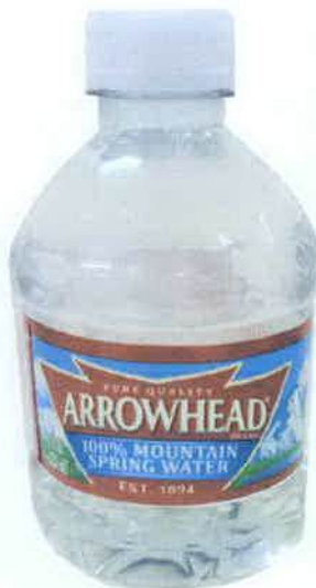
Figure 8. Unregistered Arrowhead 100% Mountain Spring Water