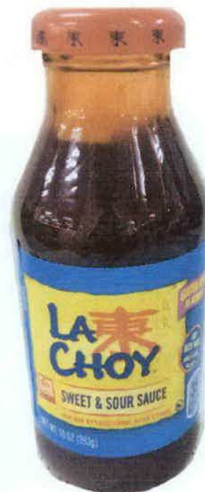
Figure 6. Unregistered La Choy Sweet & Sour Sauce