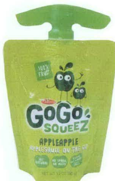
Figure 2: Unregistered Materne GoGo Squeez AppleApple