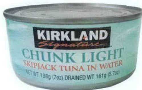
Figure 8. Unregistered Kirkland Signature Chunk Light Skipjack Tuna in Water