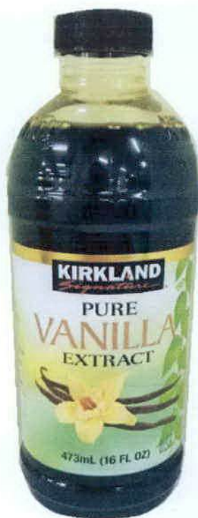
Figure 5. Unregistered Kirkland Signature Pure Vanilla Extract