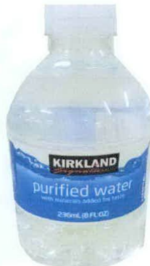
Figure 9. Unregistered Kirkland Signature Purified Water w/ minerals added for taste