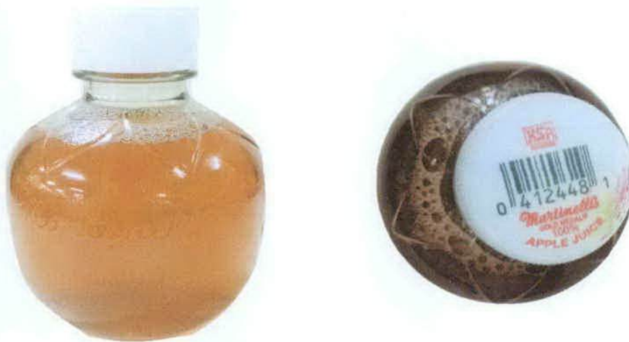
Figure 7. Unregistered Marinellis Gold Medal 100% Apple Juice