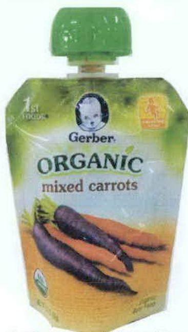
Figure 1. Unregistered Gerber Organic Mixed Carrots

The Food and Drug Administration (FDA) advises the public against the purchase and consumption of the following unregistered food products: