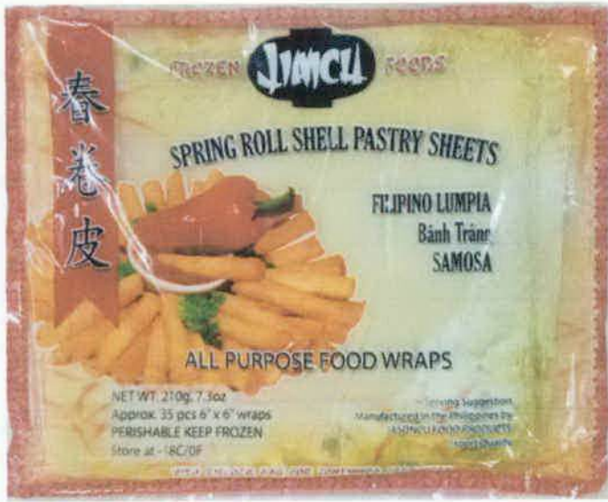
Figure 3. Unregistered JIMCH Spring Roll Shell Pastry Sheets