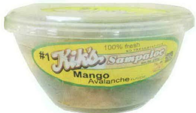
Figure 5. Unregistered #1 Kik's Sampaloc Mango Avalanche Flavor