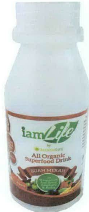
Figure 4. Unregistered iamLife by Bloomlife BUAH MERAH