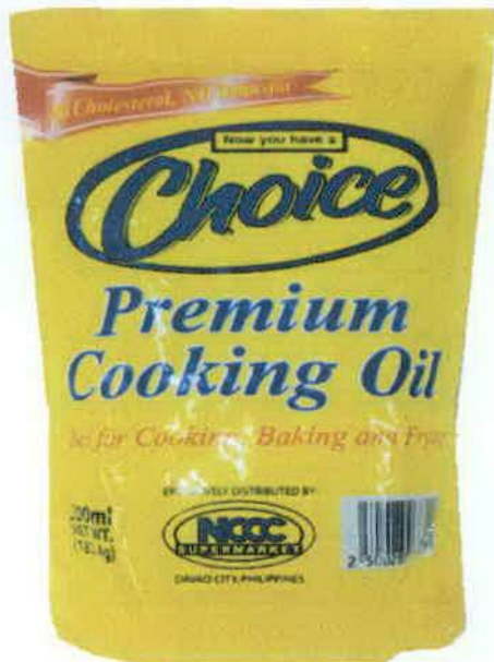
Figure 1. Unregistered Choice Premium Cooking Oil

The Food and Drug Administration (FDA) advises the public against the purchase and consumption of the following unregistered food products: