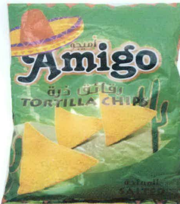
Figure 8. Unregistered Amigo Tortilla Chips, Salted