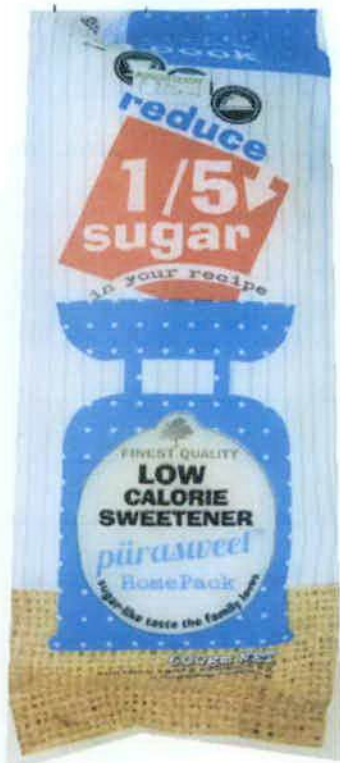
Figure 6. Unregistered Purasweet Low Calorie Sweetener