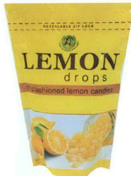
Figure 2: Unregistered Marca Señorita Lemon Drops