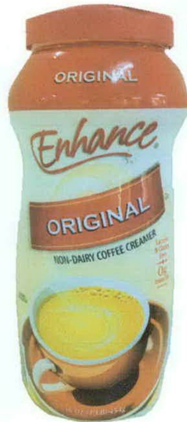
Figure 7. Unregistered Enhance Original Non-Dairy Coffee Creamer