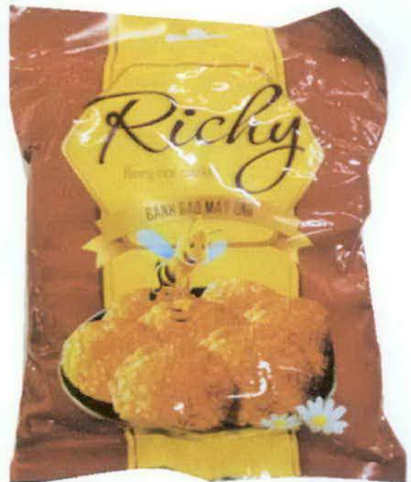
Figure 9. Unregistered Richy Honey Rice Cracker