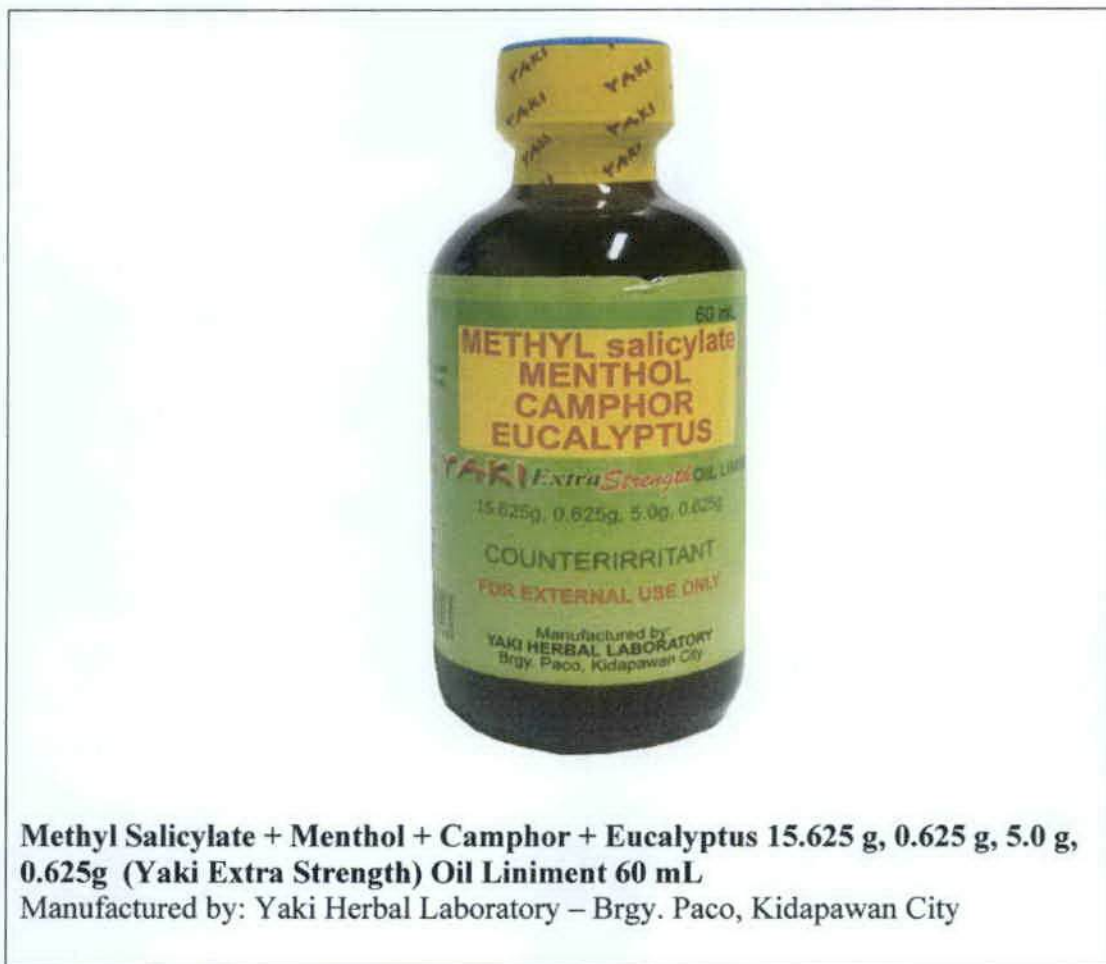
Figure 1. Unregistered drug product

The Food and Drug Administration (FDA) advises the public against the purchase and use of the unregistered drug product Methyl Salicylate + Menthol + Camphor + Eucalyptus 15.625 g, 0.625 g, 5.0 g, 0.625g (Yaki Extra Strength) Oil Liniment: