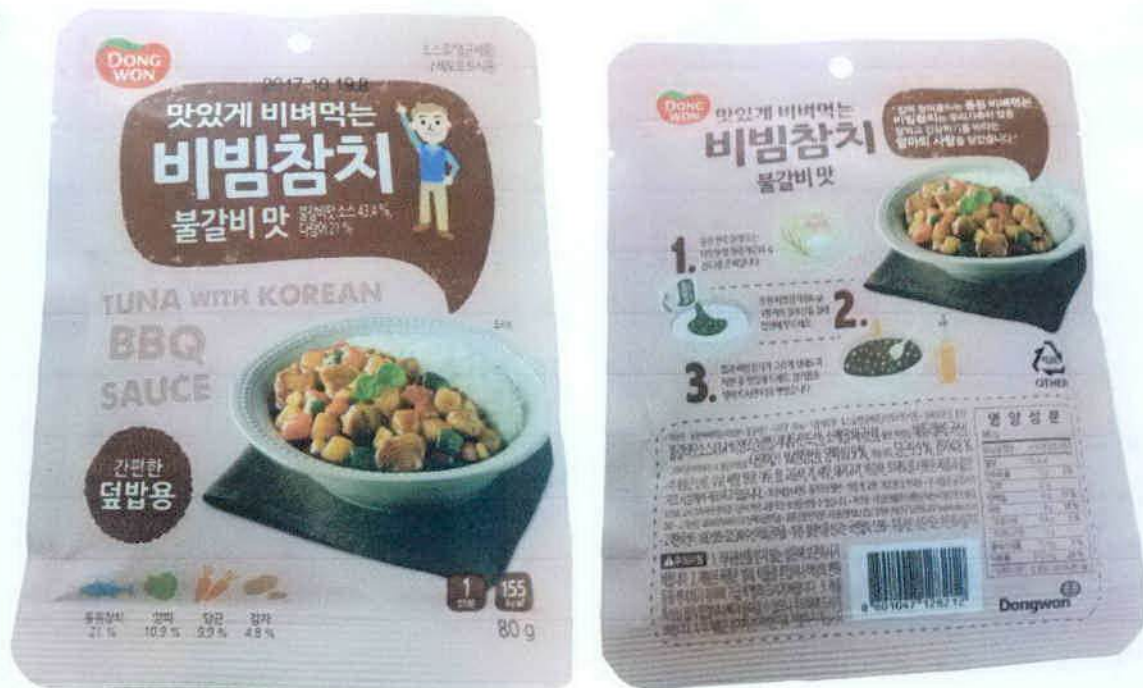
Figure 8. Unregistered Dong Won Tuna with Korean BBQ Sauce