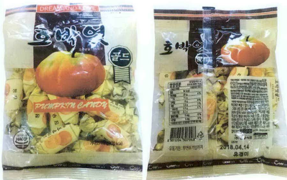
Figure 6. Unregistered Dream and Love Pumpkin Candy