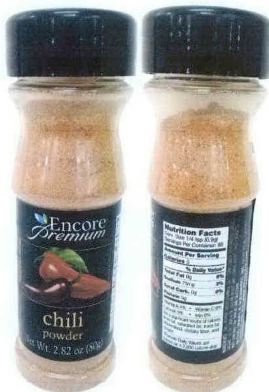
Figure 5. Unregistered Encore Premium Chili Powder