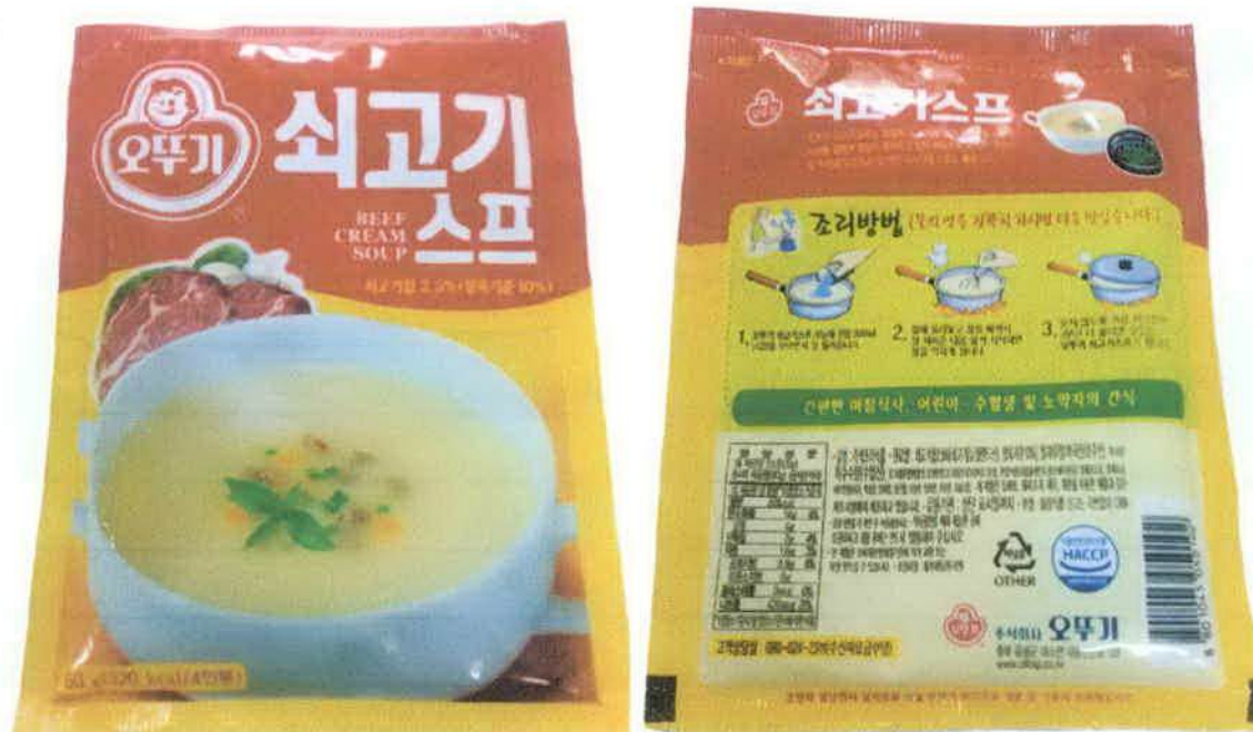
Figure 12. Unregistered Ottogi Beef Cream Soup

FDA post-marketing surveillance (PMS) activities have verified that the abovementioned food products and food supplements have not gone through the registration process of the agency and have not been issued the proper authorization in the form of Certificate of Product Registration. Pursuant to Republic Act No. 9711, otherwise known as the “Food and Drug Administration Act of 2009”, the manufacture, importation, exportation, sale, offering for sale, distribution, transfer, non-consumer use, promotion, advertising or sponsorship of health products without the proper authorization from FDA is prohibited.