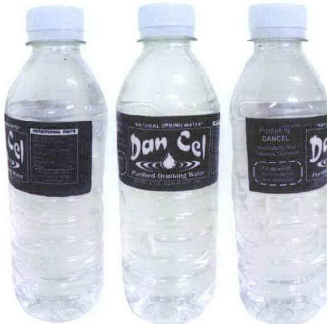
Figure 1. Unregistered Dan Cel Purified Drinking Water

The Food and Drug Administration (FDA) advises the public against the purchase and consumption of the following unregistered food products and food supplements: