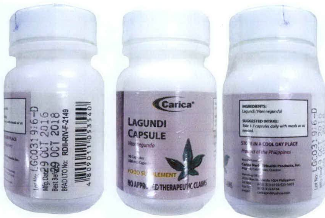
Figure 3. Unregistered Carica Lagunda Capsule