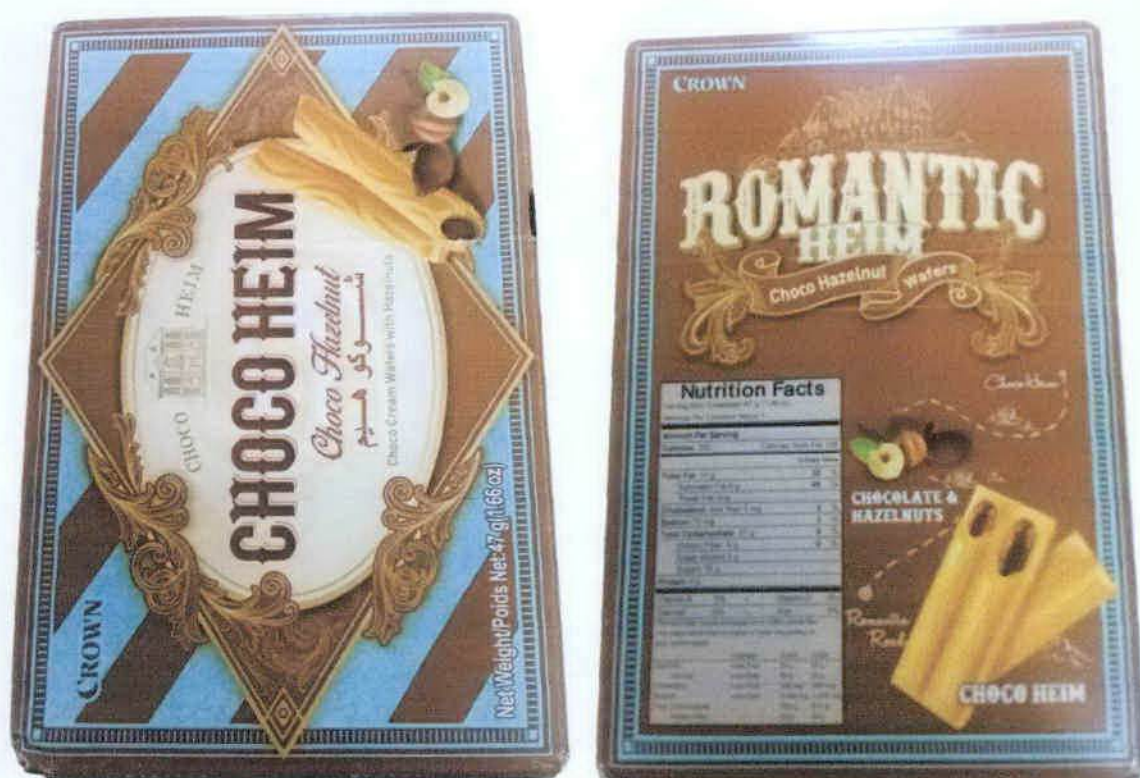
Figure 9. Unregistered Crown Choco Heim Choco Hazelnut