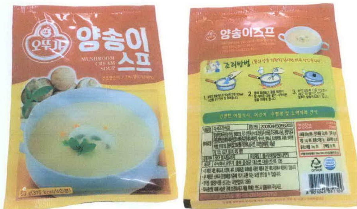
Figure 11. Unregistered Ottogi Mushroom Cream Soup