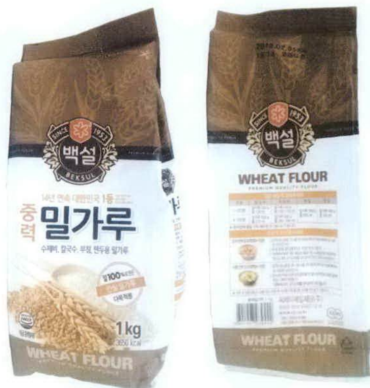
Figure 7. Unregistered Beksul Wheat Flour Premium Quality Flour