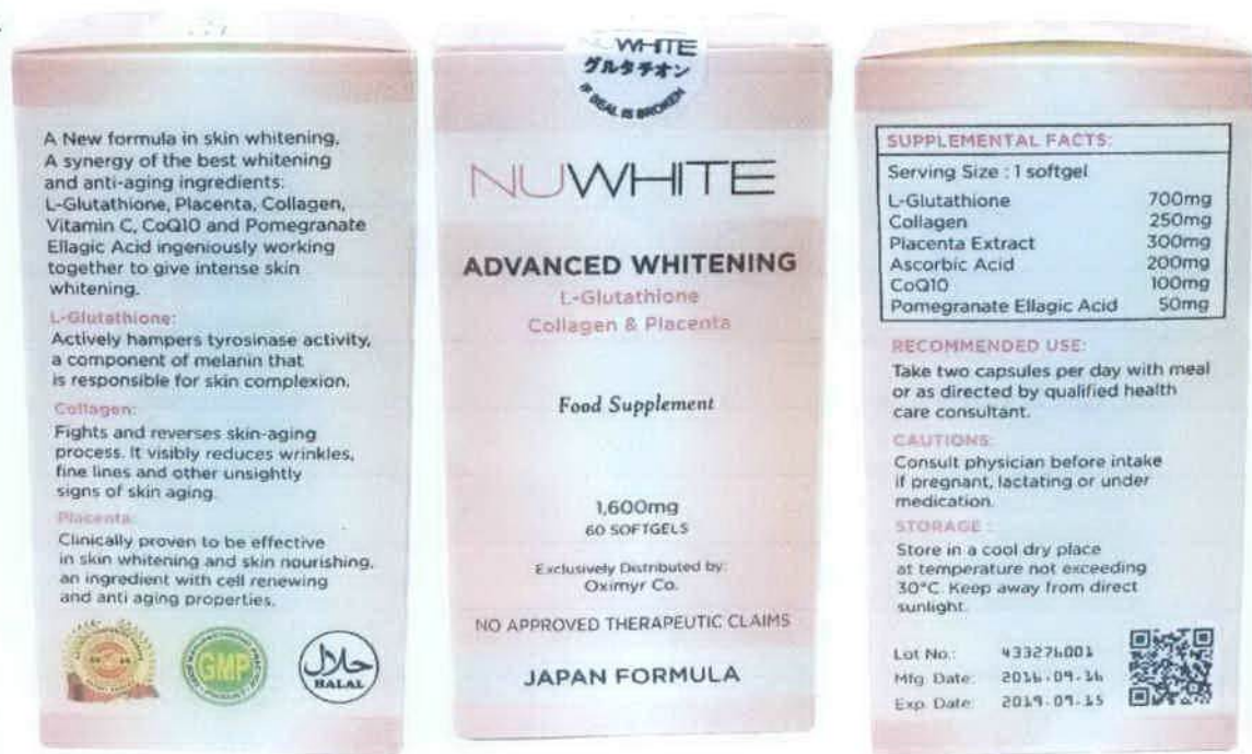
Figure 4. Unregistered NuWhite Advanced Whitening L-Glutathione Collagen & Placenta Food Supplement