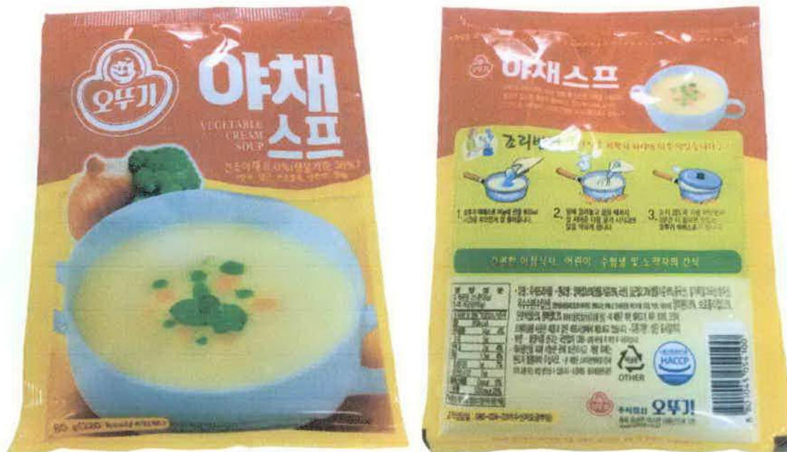
Figure 10. Unregistered Ottogi Vegetable Cream Soup