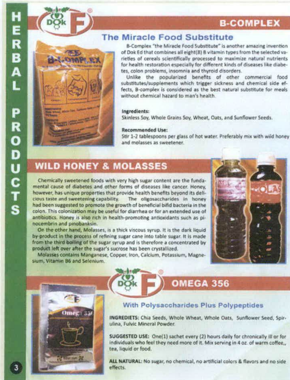
Figure 3. Unregistered DOK ALTRERNATIBO Food Products with Unapproved Claims

The public is hereby warned that the food products and food supplements are not registered with the FDA. Pursuant to Republic Act No. 9711, otherwise known as the "Food and Drug Administration Act of 2009", the manufacture, importation, exportation, sale, offering for sale, distribution, transfer, non-consumer use, promotion, advertising or sponsorship of health products without the proper authorization from FDA is prohibited.