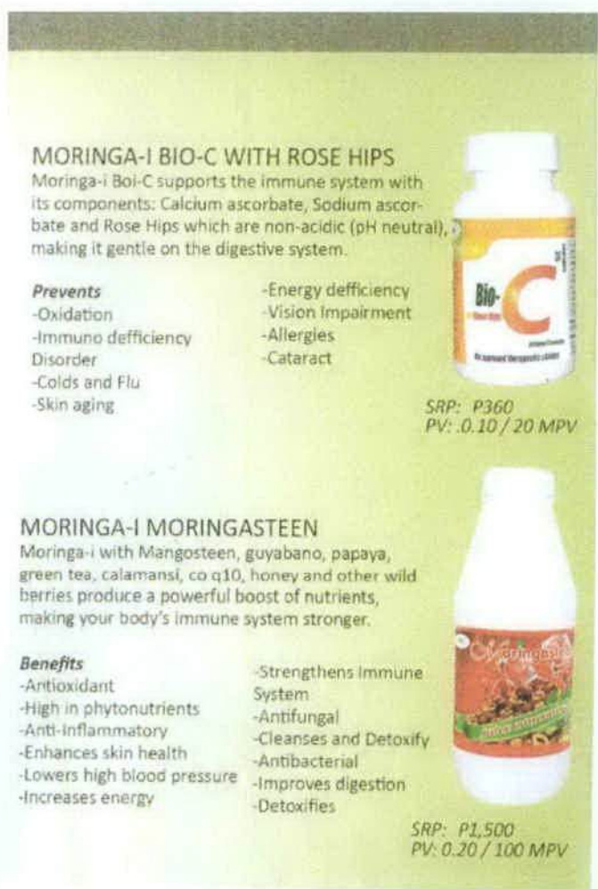
Figure 2. Unregistered Food Products and Supplements being advertised on the Brochure.