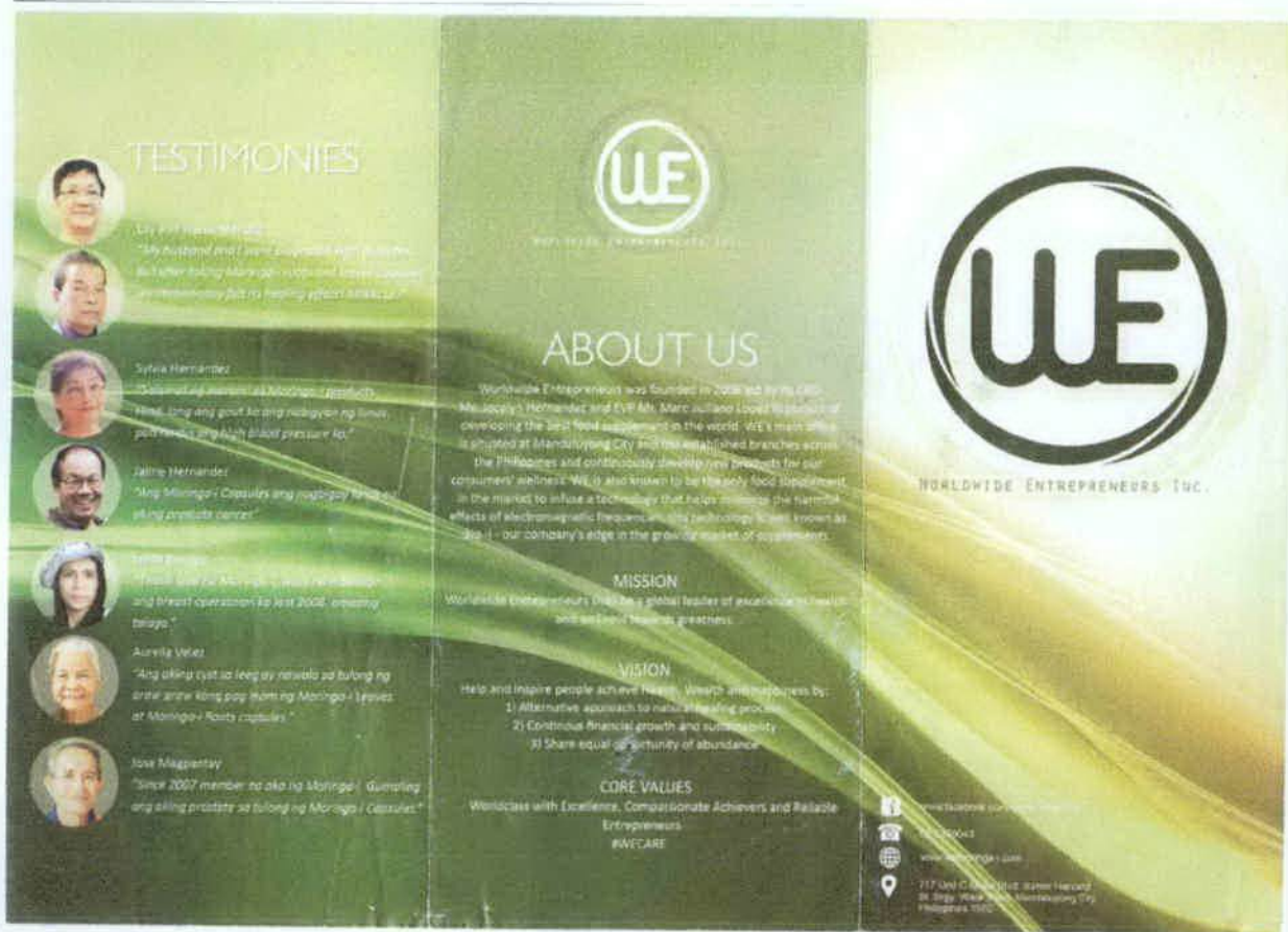
Figure 1. Front page of the brochure by WORLDWIDE ENTREPRENEURS, INC.

The Food and Drug Administration (FDA) advises the public against the purchase and consumption of the following unregistered food products and food supplements: