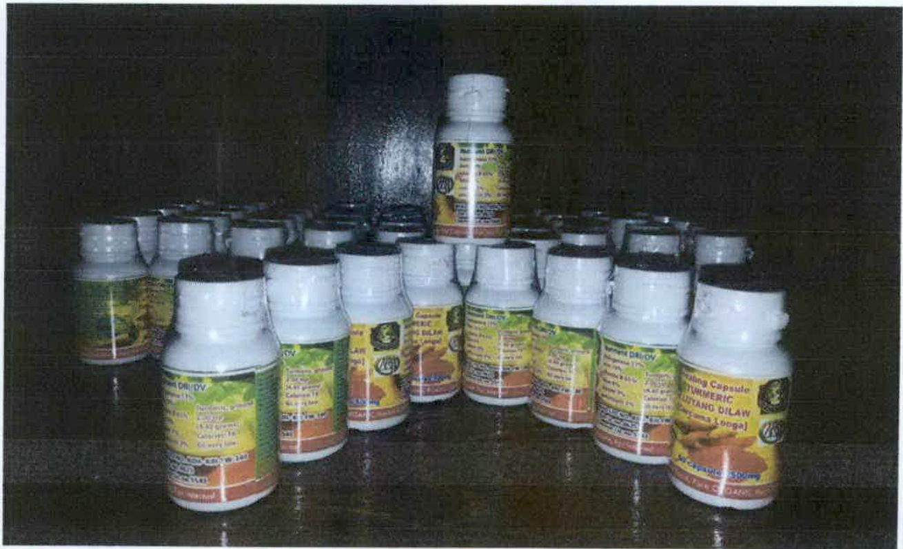
Figure 3. Unregistered Turmeric or Luyang Dilaw Capsules by the Establishment