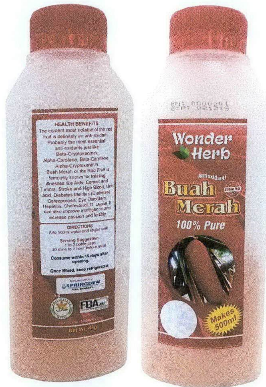
Figure 11. Unregistered Wonder Herb Buah Merah 100% Pure