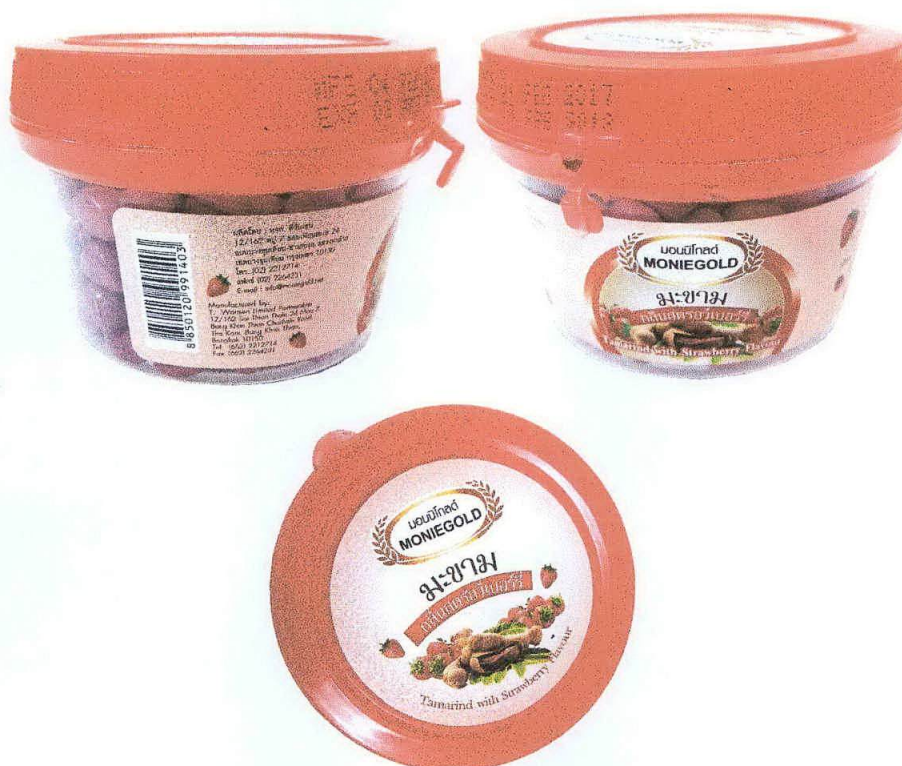
Figure 7. Unregistered Moniegold Tamarind with Strawberry Flavor