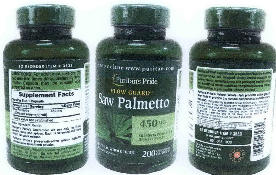
Figure 8. Unregistered Puritan's Pride Flow Guard Saw Palmetto Natural Whole Herb