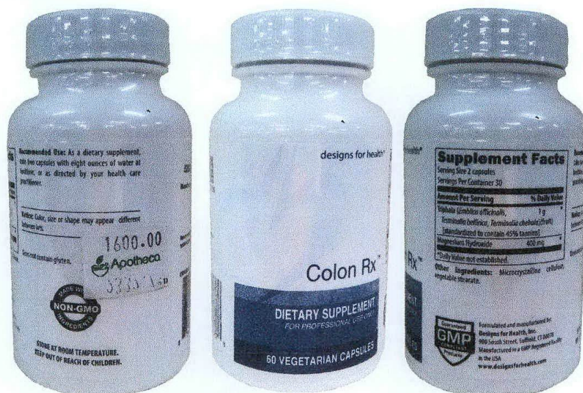
Figure 4. Unregistered Designs for Health Colon Rx™ Dietary Supplement