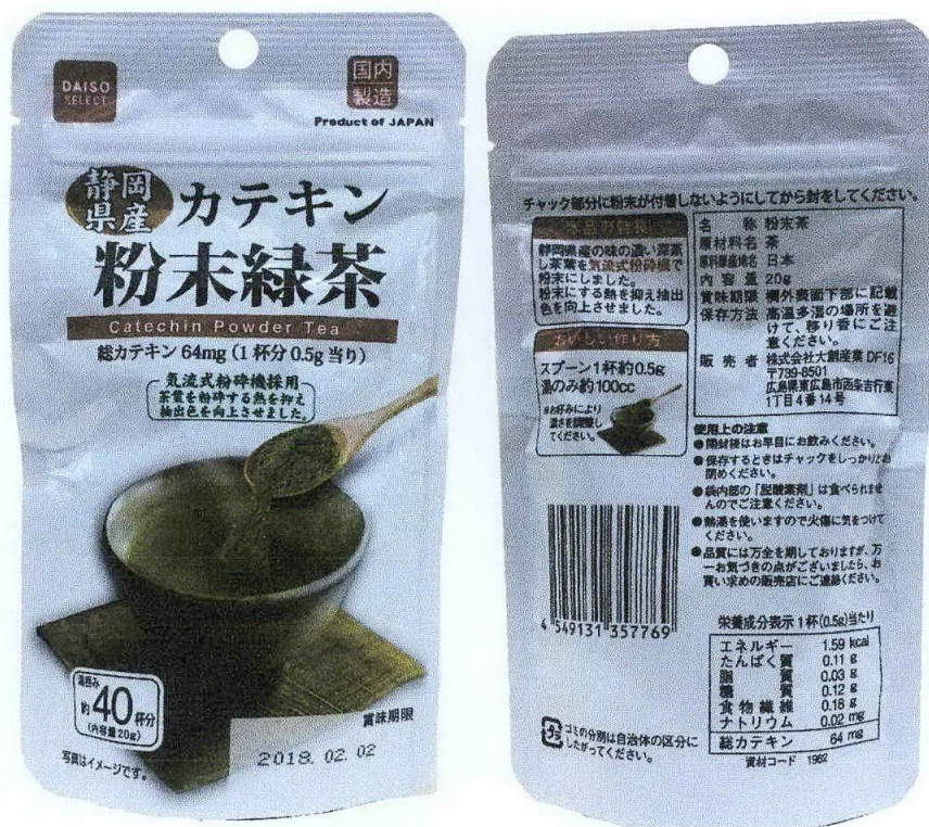
Figure 2. Unregistered Daiso Select Catechin Powder Tea