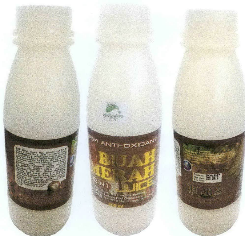
Figure 10. Unregistered Super Anti-Oxidant Buah Merah Juice 12 in 1