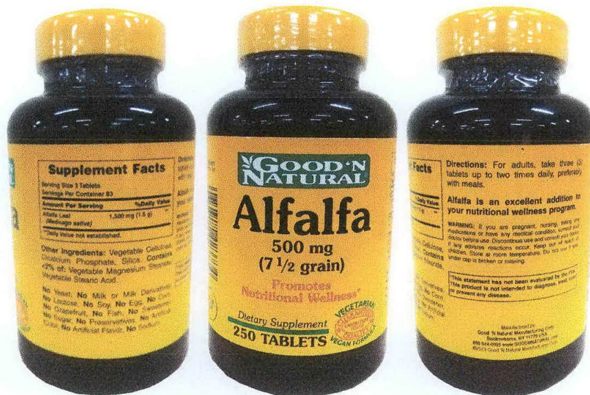
Figure 6. Unregistered Good 'N Natural Alfalfa 500 mg Dietary Supplements