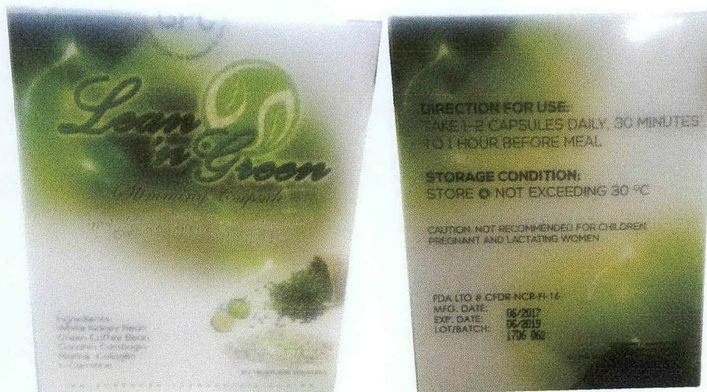
Figure 9. Unregistered Lean 'n Green Slimming Capsule