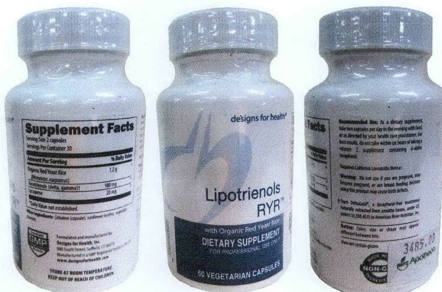
Figure 5. Unregistered Designs for Health Lipotrienols RYR™ Dietary Supplement