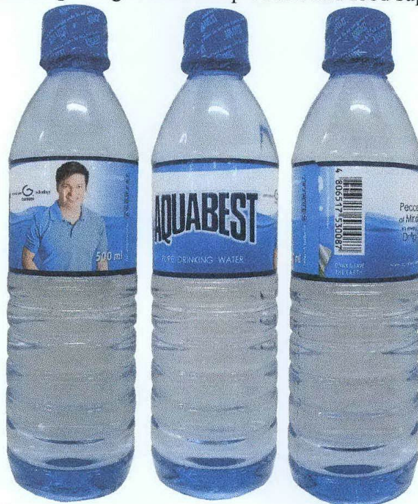
Figure 1. Unregistered Aquabest Pure Drinking Water

The Food and Drug Administration (FDA) advises the public against the purchase and consumption of the following unregistered food products and food supplements: