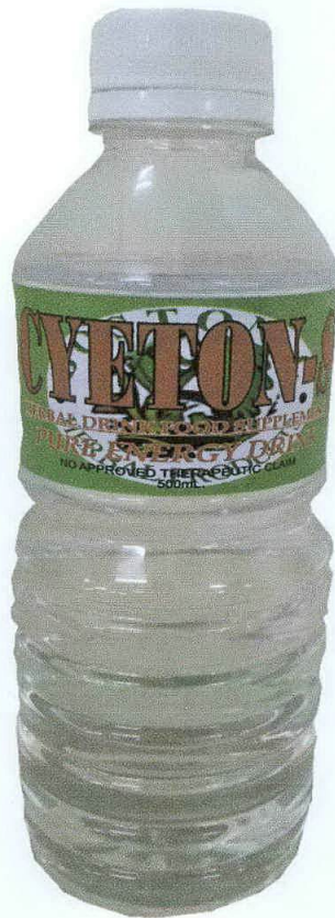
Figure 2. BOSTON-C CYETON-S SUPER ENERGY DRINK

FDA post-marketing surveillance (PMS) activities have verified that the abovementioned food products have not gone through the registration process of the agency and have not been issued the proper authorization in the form of Certificate of Product Registration. Pursuant to Republic Act No. 9711, otherwise known as the “Food and Drug Administration Act of 2009”, the manufacture, importation, exportation, sale, offering for sale, distribution, transfer, non-consumer use, promotion, advertising or sponsorship of health products without the proper authorization from FDA is prohibited.