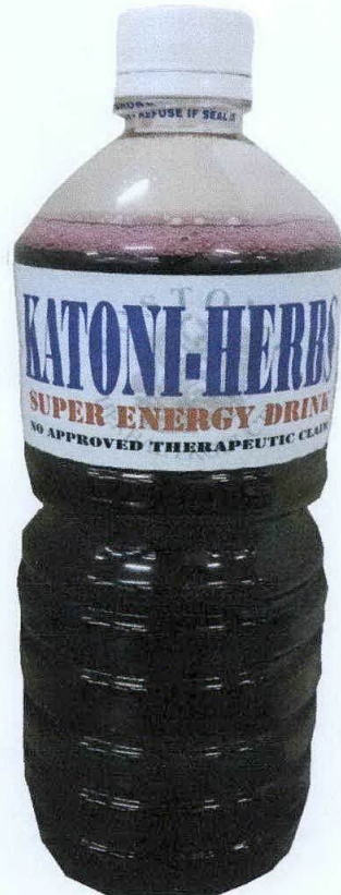
Figure 1. BOSTON-C KATONI-HERBS SUPER ENERGY DRINK

The Food and Drug Administration (FDA) advises the public against the purchase and consumption of the following unregistered food products and food supplements: