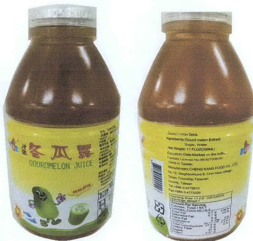
Figure 9. Unregistered GOURDMELON Juice, 330ml (labels are in foreign characters)