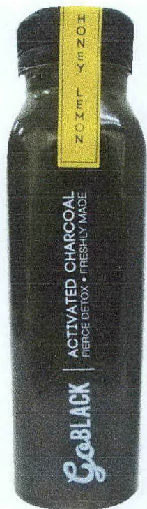
Figure 5. Unregistered GOBLACK Activated Charcoal Honey Lemon