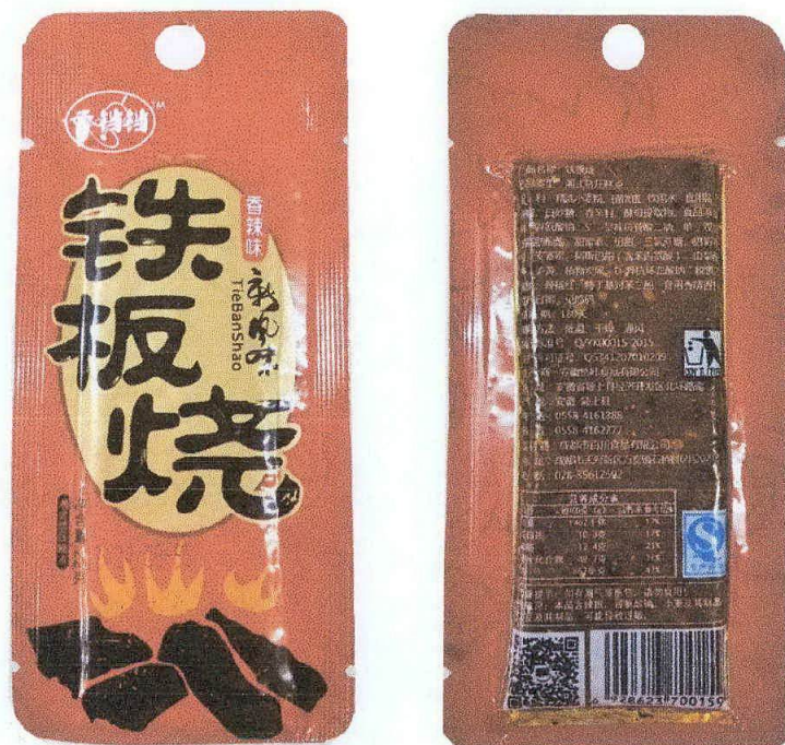
Figure 3. Unregistered TIEBANSHAO in red packaging (labels are in foreign characters)