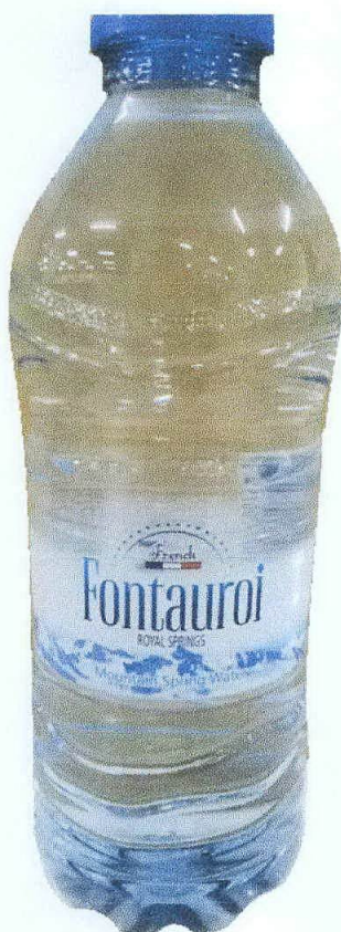
Figure 10. Unregistered French Fontauroi Royal Springs Mountain Spring Water