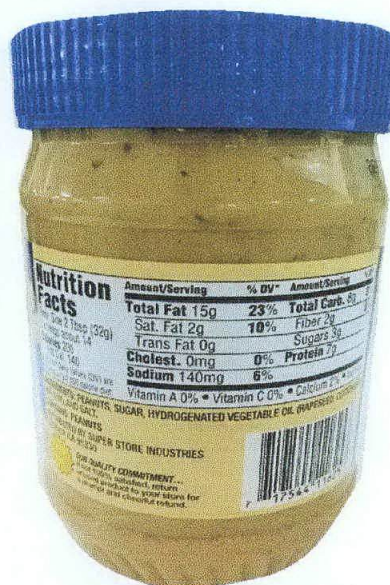
Figure 8. Unregistered SUNNY SELECT Crunchy Peanut Butter