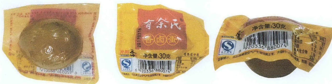
Figure 4. Unregistered GOOSUN Brown egg (labels are in foreign characters)