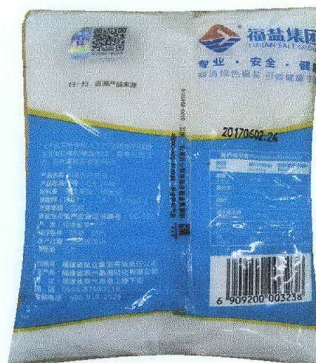
Figure 7. Unregistered FUJIAN Salt (labels are in foreign characters)