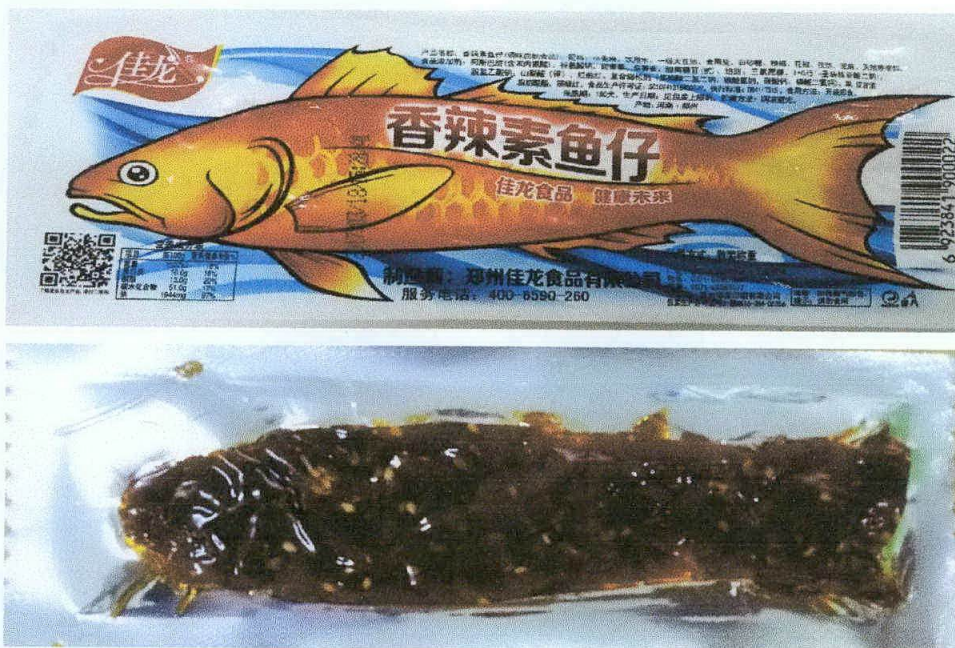
Figure 1. Unregistered Seasoned Dried Fish (labels are in foreign characters)

The Food and Drug Administration (FDA) advises the public against the purchase and consumption of the following unregistered food products: