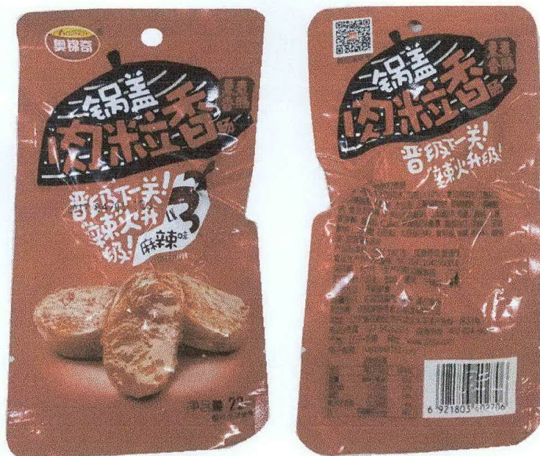
Figure 2. Unregistered AOJINQ Churizo, Red Spicy Flavor (labels are in foreign characters)