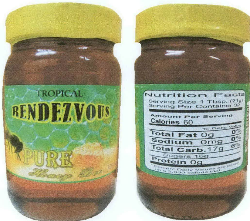
Figure 3. Unregistered TROPICAL RENDEZVOUZ Pure Honey Bee