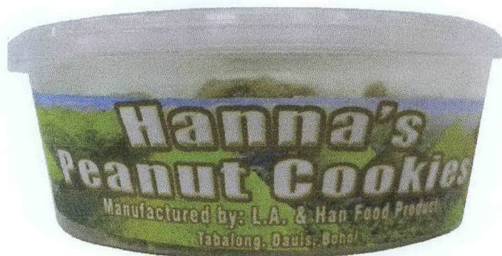
Figure 4. Unregistered HANNA'S Peanut Cookies