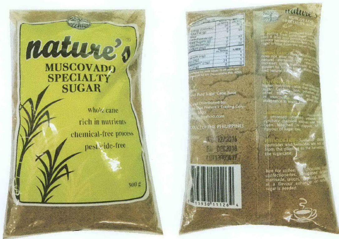
Figure 5. Unregistered NATURE'S Muscovado Specialty Sugar