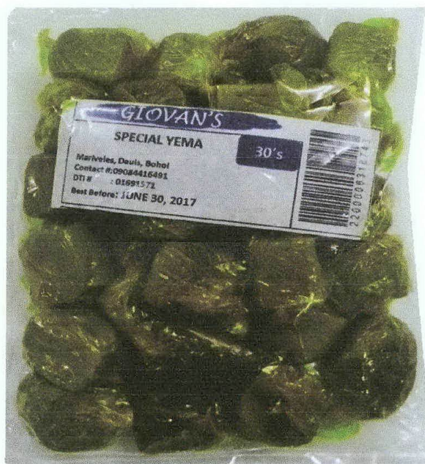
Figure 6. Unregistered GIOVAN'S Special Yema