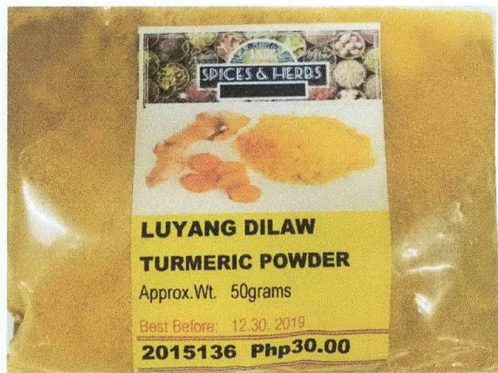
Figure 2. Unregistered SPICES & HERB Luyang Dilaw Turmeric Powder