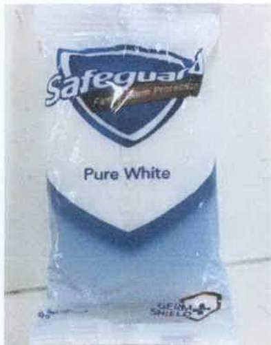
Figure 1. Counterfeit Safeguard Family Germ Protection Pure White (Principal Display Panel)

The Food and Drug Administration (FDA) hereby advises the public against the purchase and use of SAFEGUARD FAMILY GERM PROTECTION PURE WHITE 60G with Batch/Lot number 50282043841 170618 whose pictures appear below: