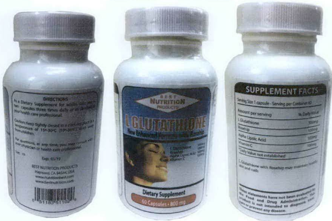
Figure 9. Unregistered BEST NUTRITION PRODUCTS L-Glutathione New Enhanced Formula with Rosehip