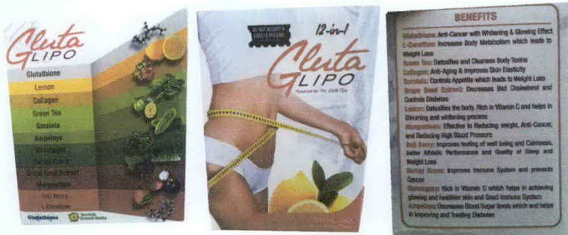
Figure 5. Unregistered Gluta Lipo