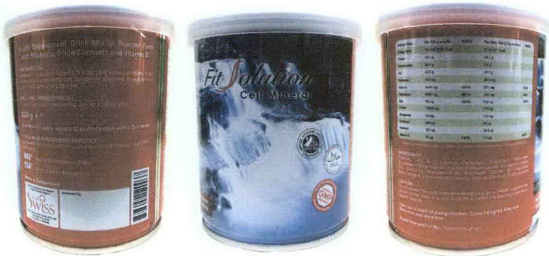
Figure 10. Unregistered Fit Solution Cell Mineral

FDA post-marketing surveillance (PMS) activities have verified that the abovementioned food products and food supplements have not gone through the registration process of the agency and have not been issued the proper authorization in the form of Certificate of Product Registration. Pursuant to Republic Act No. 9711, otherwise known as the “Food and Drug Administration Act of 2009”, the manufacture, importation, exportation, sale, offering for sale, distribution, transfer, non-consumer use, promotion, advertising or sponsorship of health products without the proper authorization from FDA is prohibited.