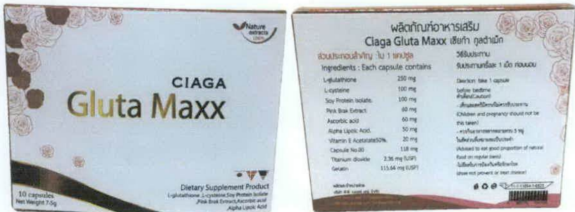
Figure 7. Unregistered Ciaga Gluta Maxx