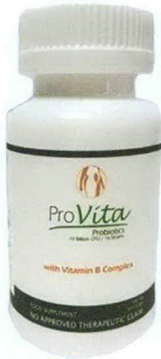
Figure 2. Unregistered Provita Probiotics with Vitamin B Complex