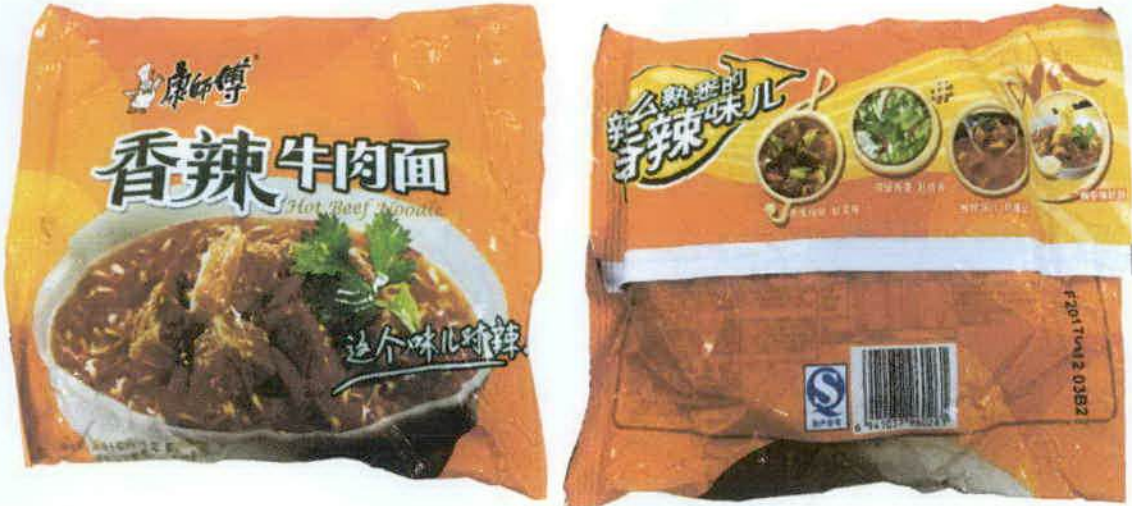
Figure 6. Unregistered Hot Beef Noodle