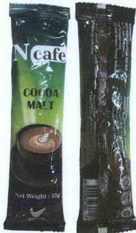
Figure 3. Unregistered N Café Cocoa Malt 35 g