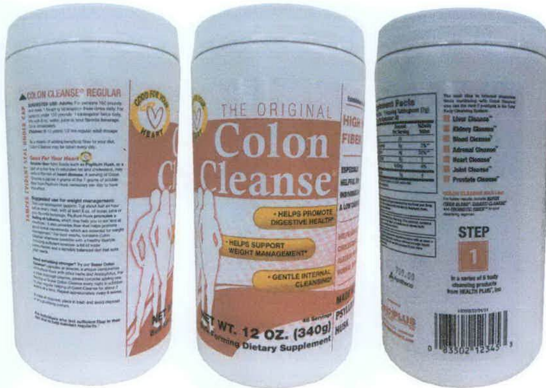
Figure 4. Unregistered The Original Colon Cleanse Bulk Forming Dietary Supplement