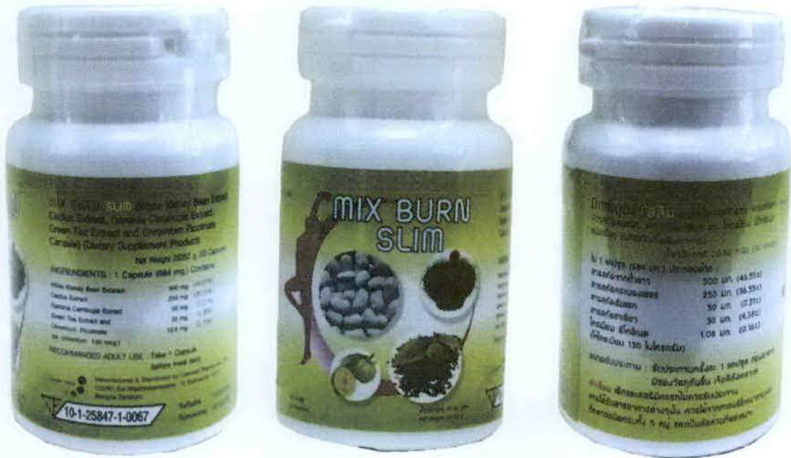
Figure 8. Unregistered Mix Burn Slim