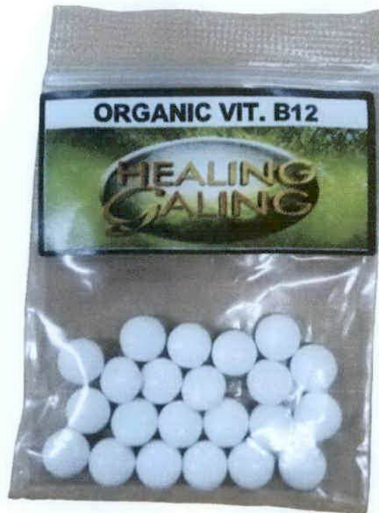
Figure 8. Unregistered Healing Galing Organic Vit. B12