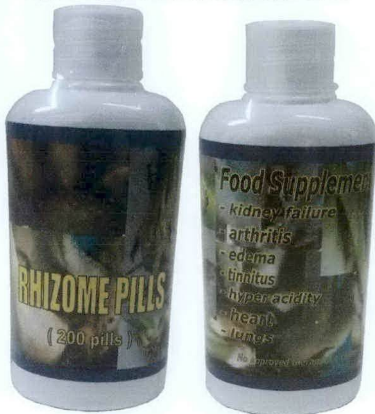
Figure 9. Unregistered Healing Galing Rhizome Pills