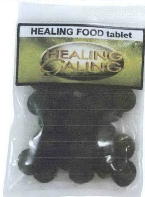
Figure 1. Unregistered Healing Galing Healing Food Tablet

The Food and Drug Administration (FDA) advises the public against the purchase and consumption of the following unregistered food products and food supplements: