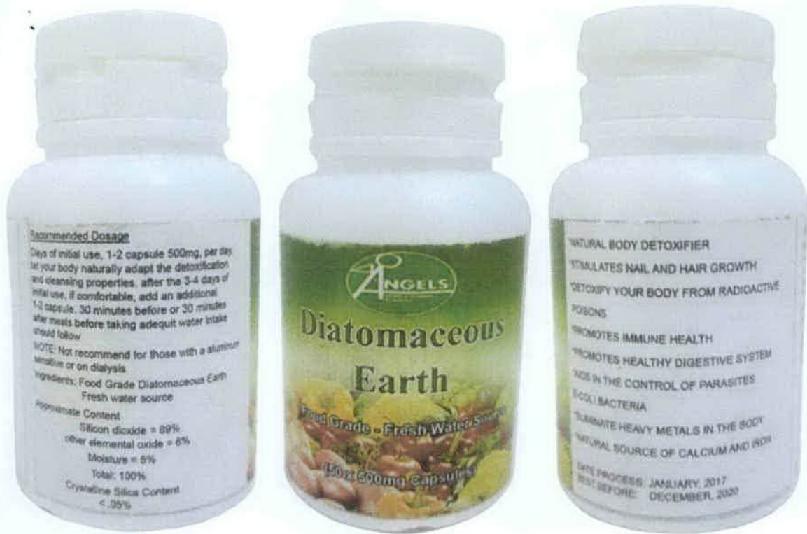
Figure 2. Unregistered Angels Diatomaceous Earth