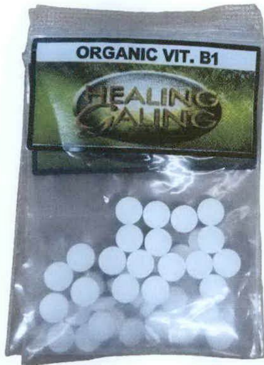
Figure 6. Unregistered Healing Galing Organic Vit. B1