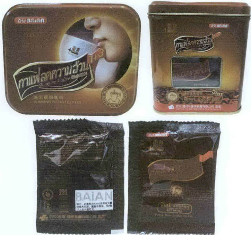
Figure 4. Unregistered Lishou Slimming Coffee 3 in 1