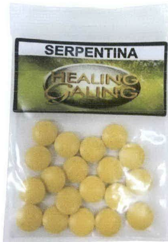
Figure 10. Unregistered Healing Galing Serpentina

FDA post-marketing surveillance (PMS) activities have verified that the abovementioned food products and food supplements have not gone through the registration process of the agency and have not been issued the proper authorization in the form of Certificate of Product Registration. Pursuant to Republic Act No. 9711, otherwise known as the “Food and Drug Administration Act of 2009”, the manufacture, importation, exportation, sale, offering for sale, distribution, transfer, non-consumer use, promotion, advertising or sponsorship of health products without the proper authorization from FDA is prohibited.