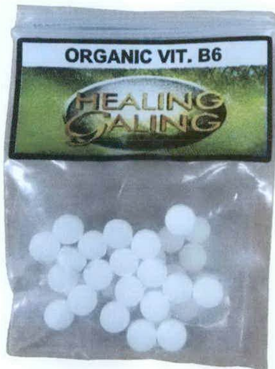
Figure 7. Unregistered Healing Galing Organic Vit. B6