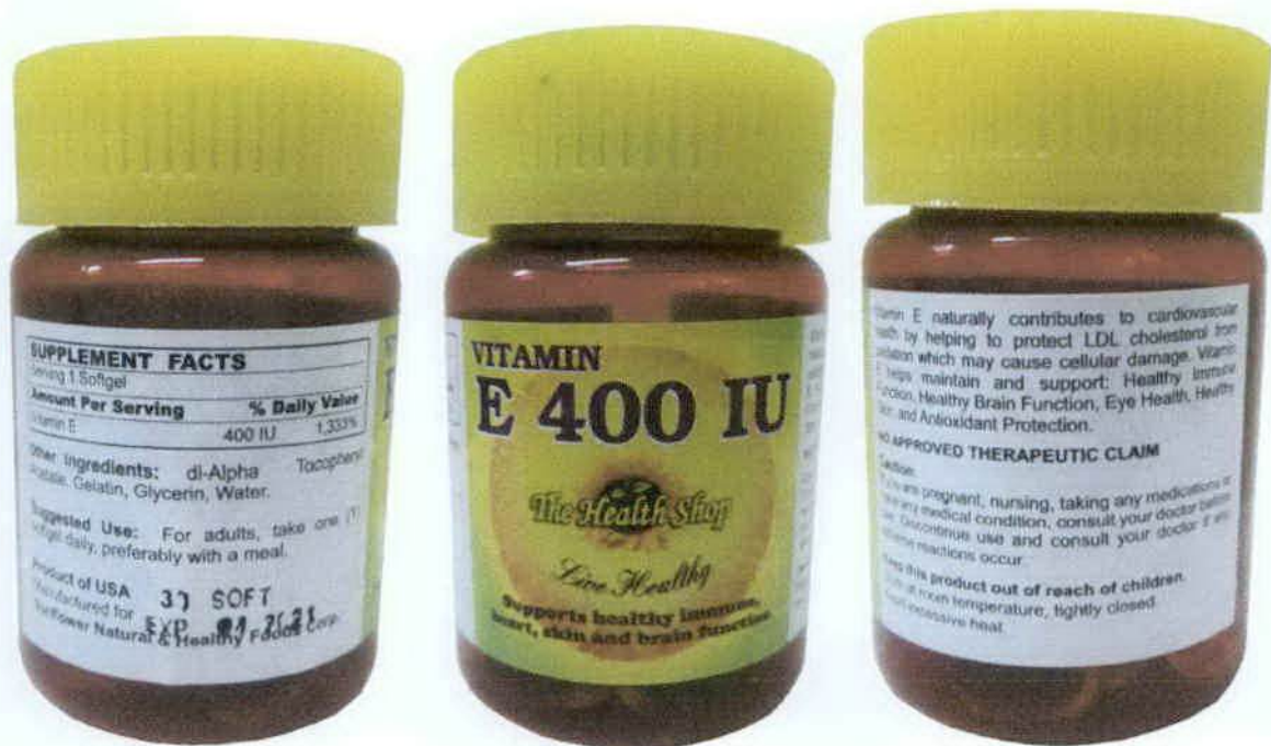
Figure 3. Unregistered The Health Shop Vitamin E 400 IU