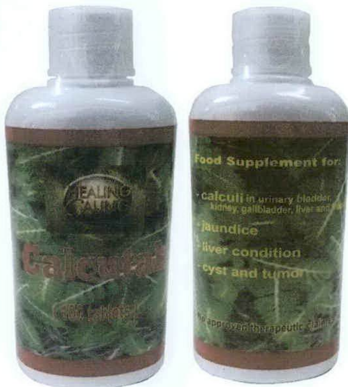
Figure 5. Unregistered Healing Galing Calcutab