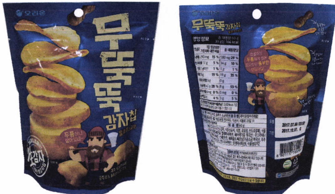
Figure 6. Unregistered Orion Chopped Potato Chips