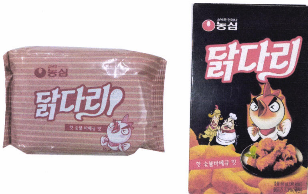
Figure 1. Unregistered NONGSHIM Chicken Drumsticks

The Food and Drug Administration (FDA) advises the public against the purchase and consumption of the following unregistered food supplements: