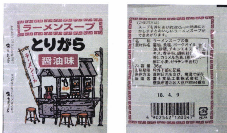
Figure 3. Unregistered Fuji Food Stalls Ramen Chicken Genuine Oil Flavor