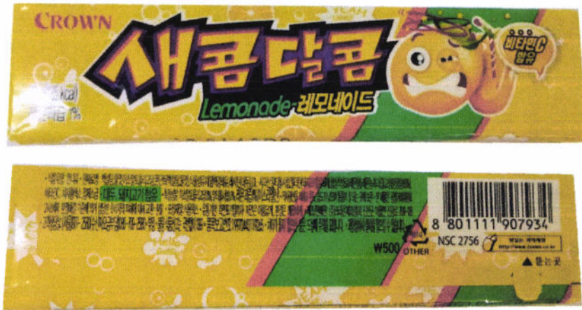
Figure 5. Unregistered CROWN Saekom Dalkom Lemonade Flavor