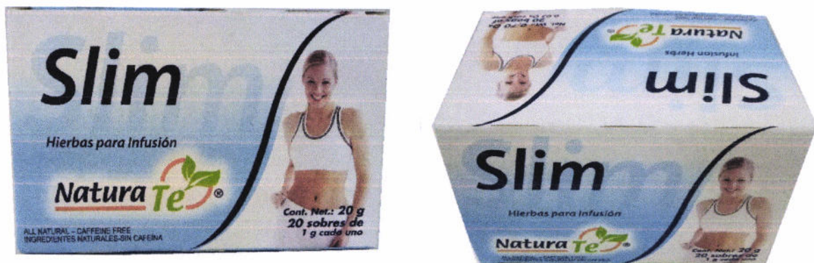
Figure 7. Unregistered NATURA TE Slim Infusion Herbs