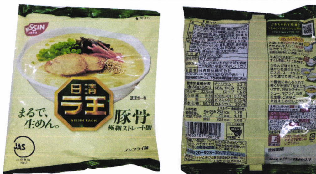
Figure 4. Unregistered NISSIN RAOH Japanese Instant Ramen Noodles