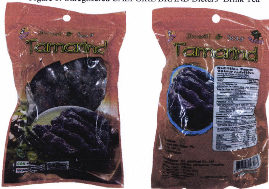
Figure 9. Unregistered Sweet & Sour Tamarind, Spicy