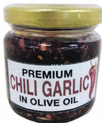
Figure 10. Unregistered Premium Chili Garlic in Olive Oil