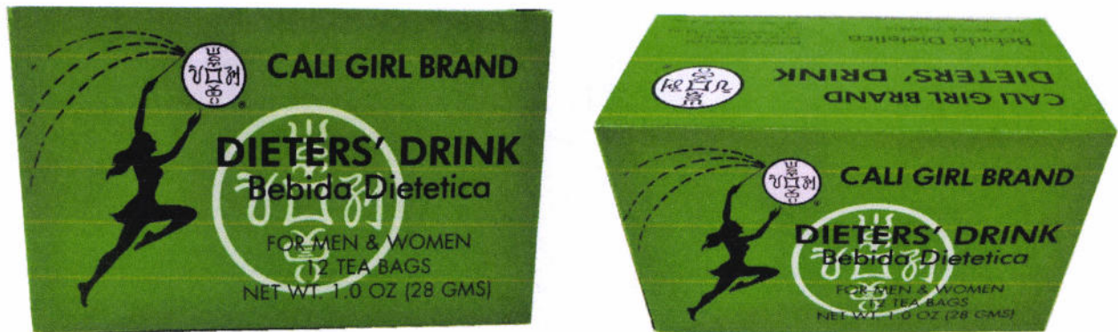
Figure 8. Unregistered CALI GIRL BRAND Dieters' Drink Tea