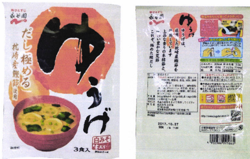
Figure 2. Unregistered NAGATANIEN Yuge Instant Dashi Raw Miso Soup