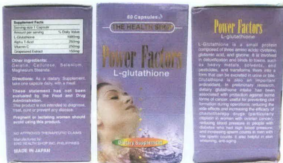
Figure 1. Unregistered THE HEALTH SHOP Power Factors L-Glutathione Dietary Supplement

The Food and Drug Administration (FDA) advises the public against the purchase and consumption of the following unregistered food supplements claiming to contain L-Glutathione: