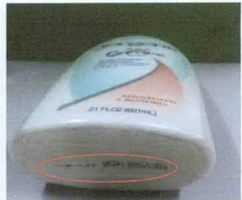
Figure 3. Counterfeit Jergens® Age Defying Multi-Vitamin Moisturizer with highlight on the Batch/Lot Number and Manufacturing/Expiration Date (Bottom of the bottle)

FDA, in coordination with the Market Authorization Holder (MAH), Vibelle Manufacturing Corporation, has verified that Jergens® Age Defying Multi-Vitamin Moisturizer 621mL products with this particular batch/lot number and manufacturing/expiry date are COUNTERFEIT .