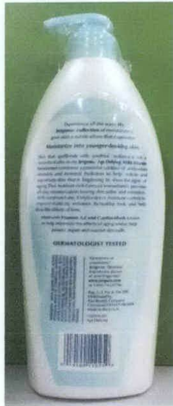
Figure 2. Counterfeit Jergens® Age Defying Multi-Vitamin Moisturizer (Back Display Panel)