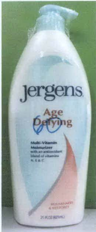
Figure 1. Counterfeit Jergens® Age Defying Multi-Vitamin Moisturizer (Principal Display Panel)

The Food and Drug Administration (FDA) hereby advises the public against the purchase and use of JERGENS® AGE DEFYING MULTI-VITAMIN MOISTURIZER 621mL with Batch/Lot number SKK-L11 and Manufacturing/Expiry date 2017/01 / 2020/01 whose pictures appears below: