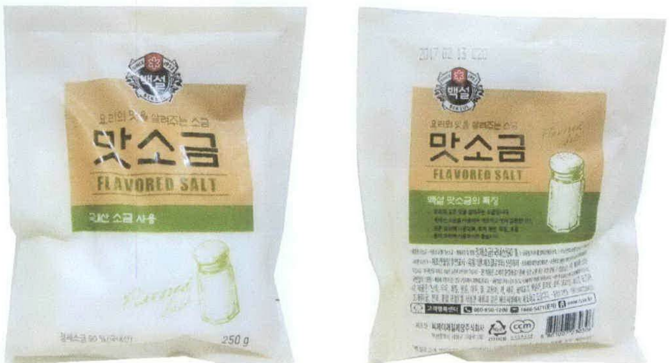
Figure 6. Unregistered CJ BEKSUL Flavored Salt (in foreign characters)