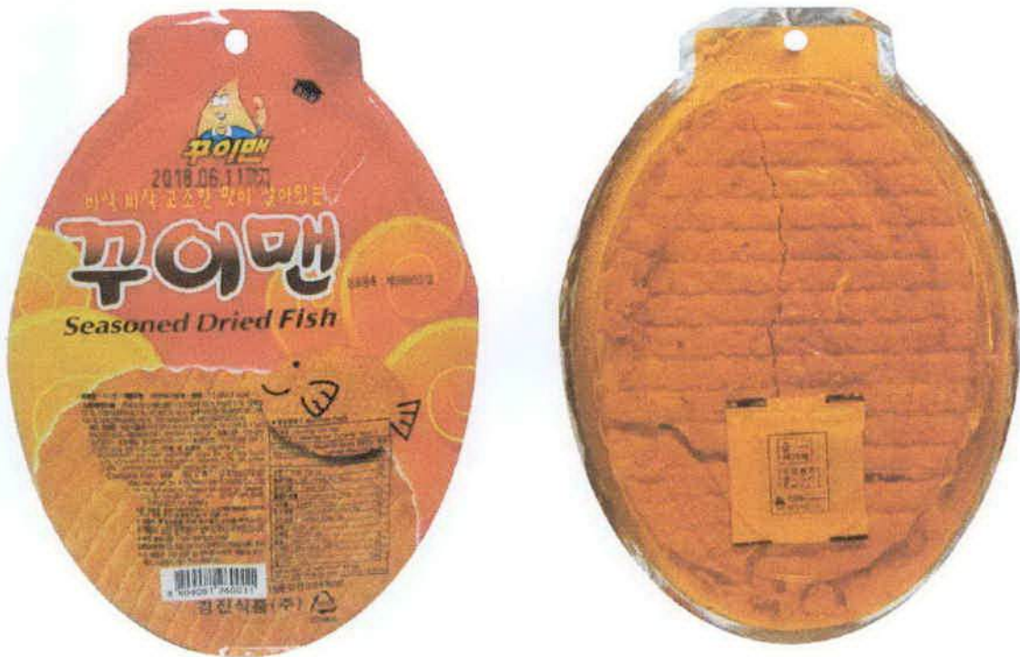
Figure 5. Unregistered Seasoned Dried Fish (in foreign characters)