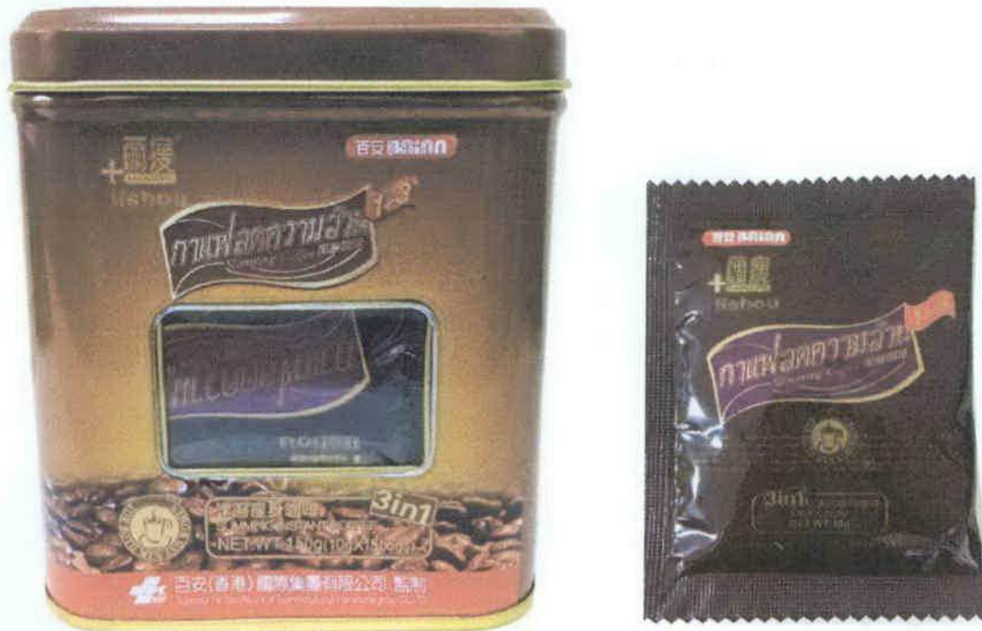
Figure 1. Unregistered LISHOU SLIMMING COFFE 3in1

The Food and Drug Administration (FDA) advises the public against the purchase and consumption of the following unregistered food products: