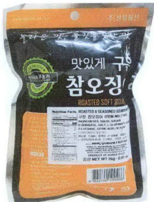
Figure 2. Unregistered SUNIL Roasted Soft Squid