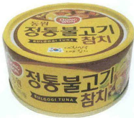
Figure 3. Unregistered DONG WON Bulgogi Tuna