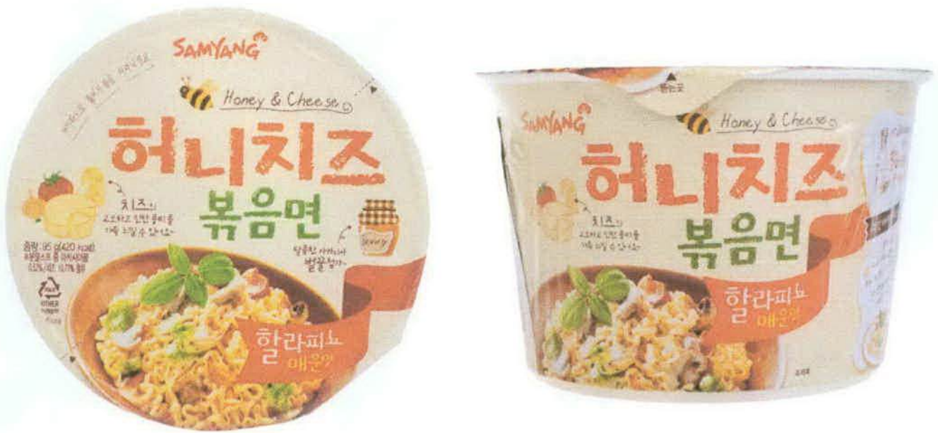
Figure 7. Unregistered SAMYANG Honey & Cheese Noodle Ramen