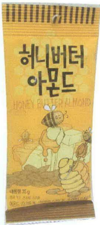
Figure 4. Unregistered Honey Butter Almond Nuts